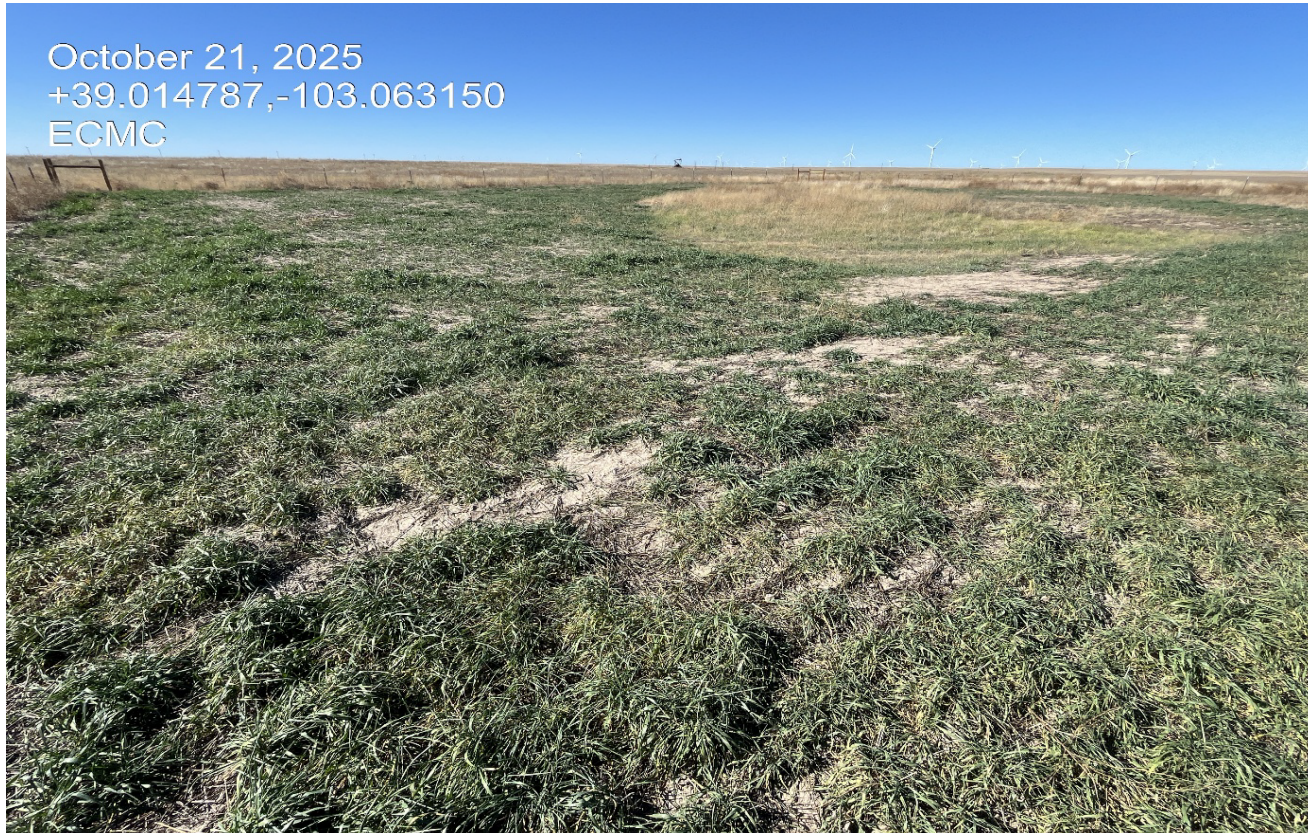
Photo 5. Facing northwest at the location where bare soils were observed. This area has been reclaimed and vegetation is establishing.