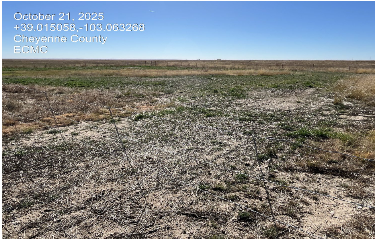
Photo 3. Facing southwest toward the location.