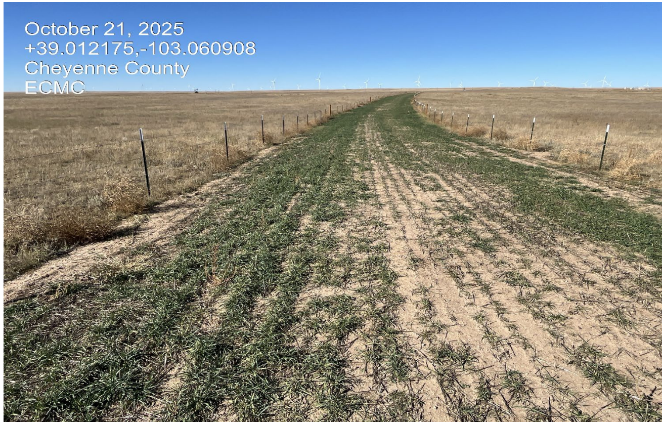
Photo 2. Facing north further along the reclaimed road.