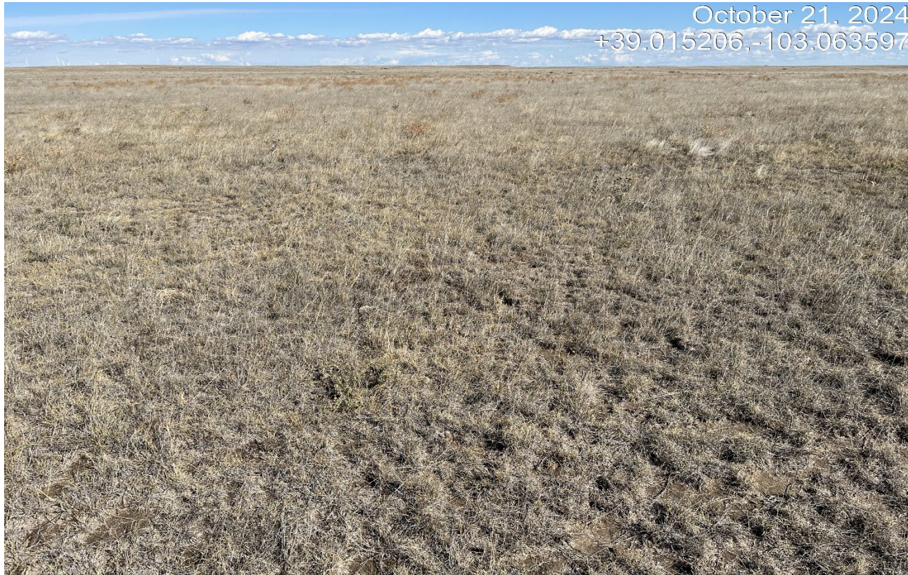
Photo 6. Facing east toward the surrounding undisturbed rangeland.