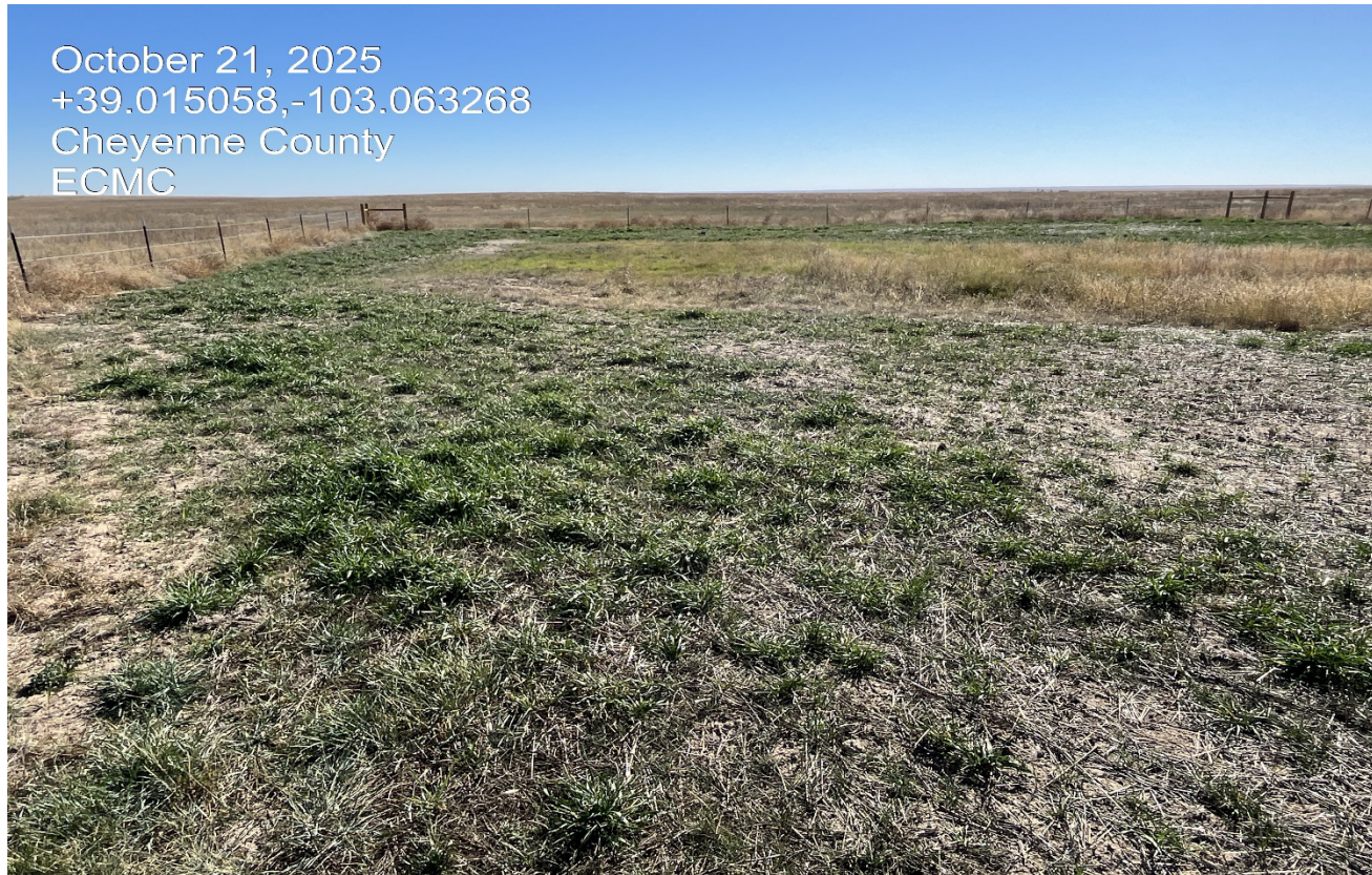
Photo 4. Facing southwest at the location where bare soils were observed. This area has been reclaimed and vegetation is establishing.