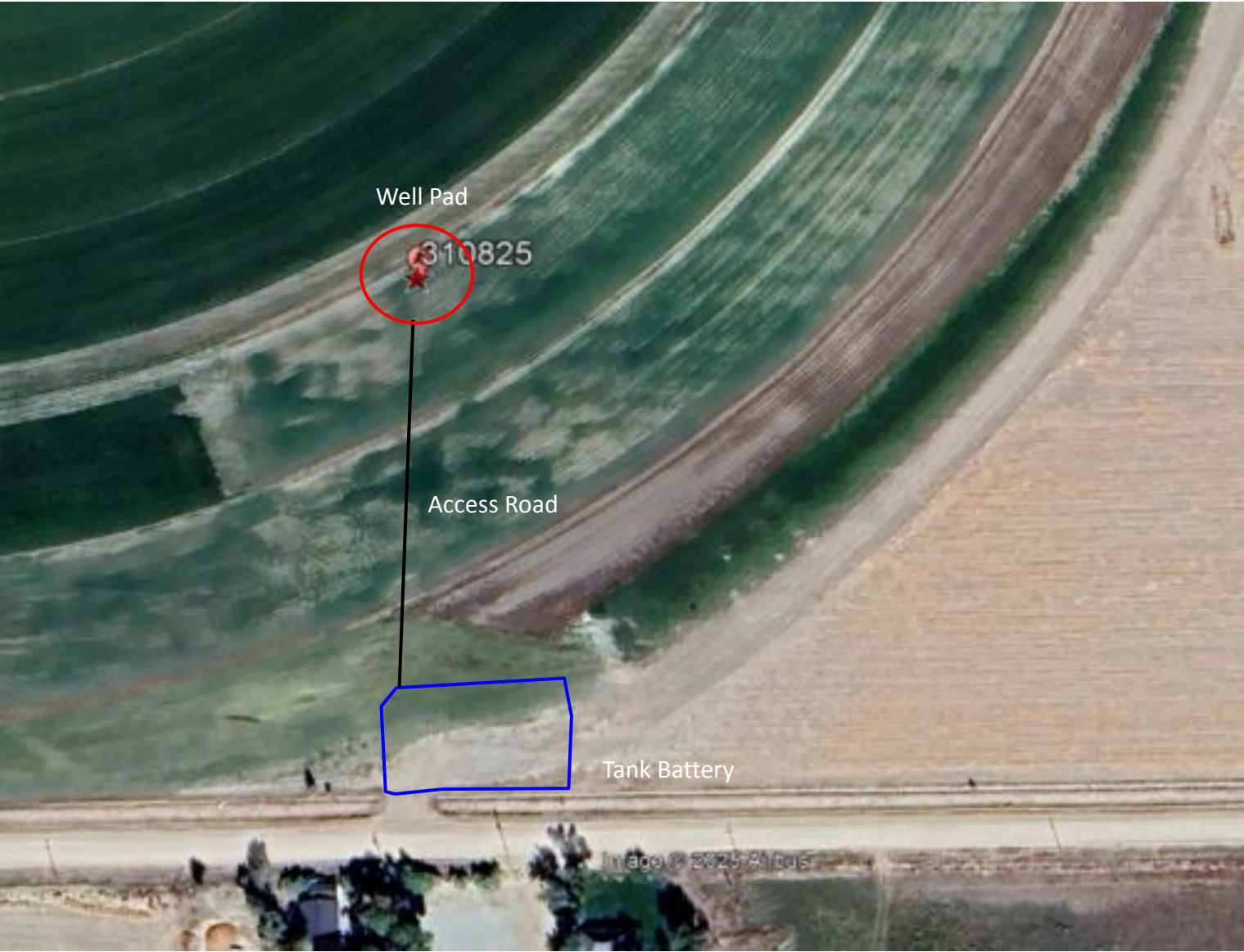
Photo 1. 2025 aerial imagery showing the Tank Battery location (highlighted in blue), Access Road (highlighted in black) and Well Pad (highlighted in Red). Note: Tank battery is associated with its own location ID #461166.