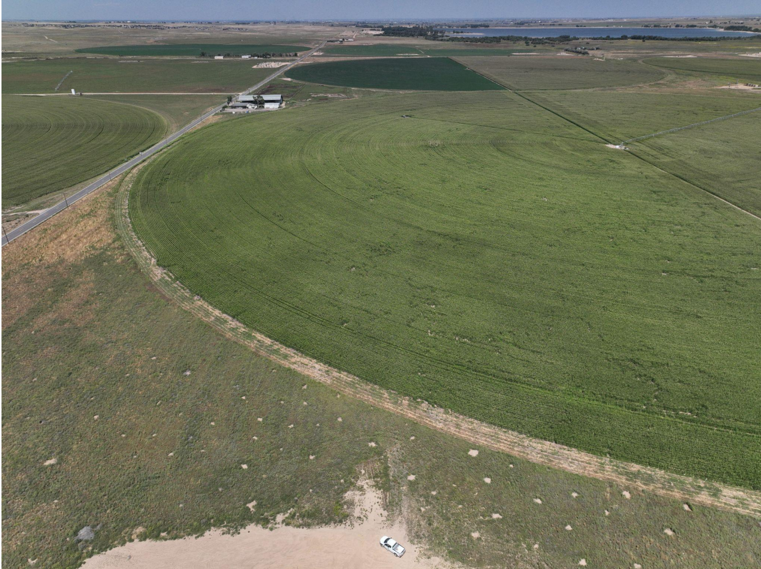
Photo 2. Aerial view of the well pad and access road taken with a drone at the time of the inspection from the southern edge facing north. Note: Well pad and access road crop vegetation appears consistent with adjacent reference areas.