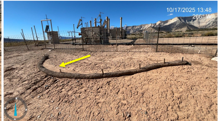
Photo 3: Photos showing production equipment shared between multiple locations. Erosion, rilling and degradation is evident, and some wattles are laden with sediment. Stormwater BMP's appear to be missing or insufficient. Comply with Rule 1002.f.