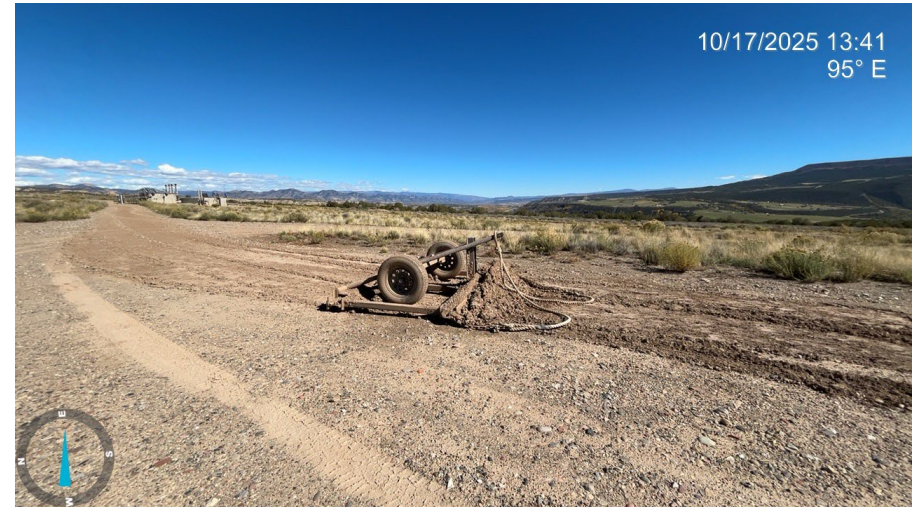
Photo 4: Photos ponding and vehicle tracking occurring on the wellhead working pad surface; gravel appears to be sparse in some places. Unused equipment appears to be present on the working pad. Comply with Rule 1002.f. and implement or maintain stormwater BMPs. Comply with 606.a. and remove unused equipment.