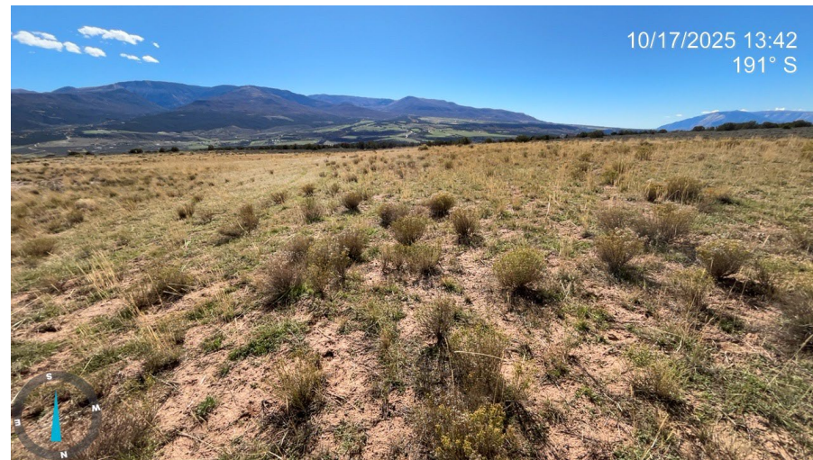
Photo 2: Photos showing an overview of the northwestern interim area. Interim areas are composed of Russian wildrye and intermediate wheatgrass, with secondary to trace amounts of broom snakeweed. Desirable, perennial and uniform plant establishment is evident. Interim areas are progressing towards 1003 reclamation requirements.