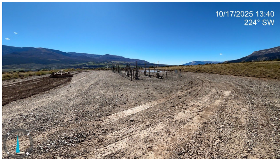
Photo 1: Photos showing an overview of the location looking north and southwest (left top and bottom, respectively) and the production equipment shared with locations #335215 and #324187 looking north (top right).