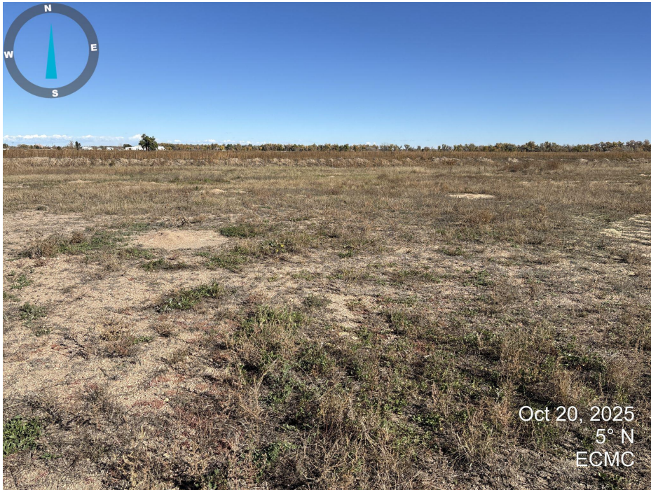
Photo 1. Looking north across the wellbore area. No oil and gas equipment is present. Some desirable vegetation is present. Bare ground and undesirable weeds such as kochia are also present around the wellbore.