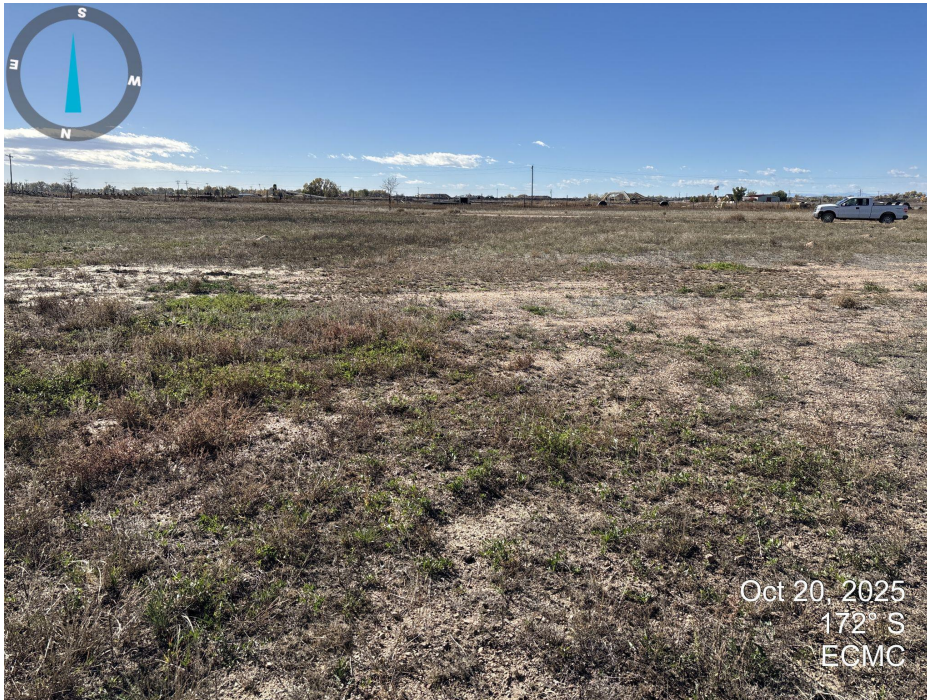
Photo 3. Looking south from the wellbore. See photo 1 comments.