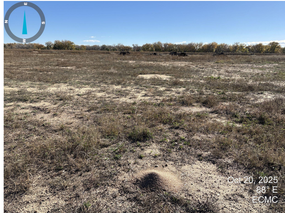
Photo 4. Looking east from the wellbore. See photo 1 comments.