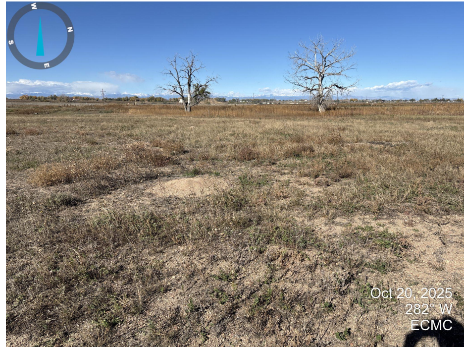
Photo 2. Looking west from the wellbore. See photo 1 comments.