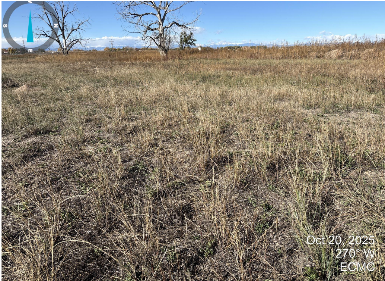
Photo 5. Reference vegetation to the west of the well location.