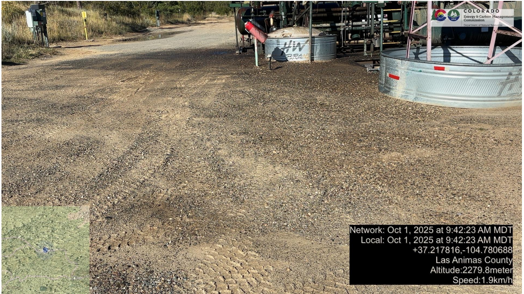
PHOTO 5: ANOTHER IMAGE SHOWING THE SPILL AREA. THE BULK OF THE SPILL FLUID IS APP. 35' AROUND THE EQUIPMENT WITH SOME SPRAY REACHING OUT TO THE EAST AND SOUTH APP. 50'.