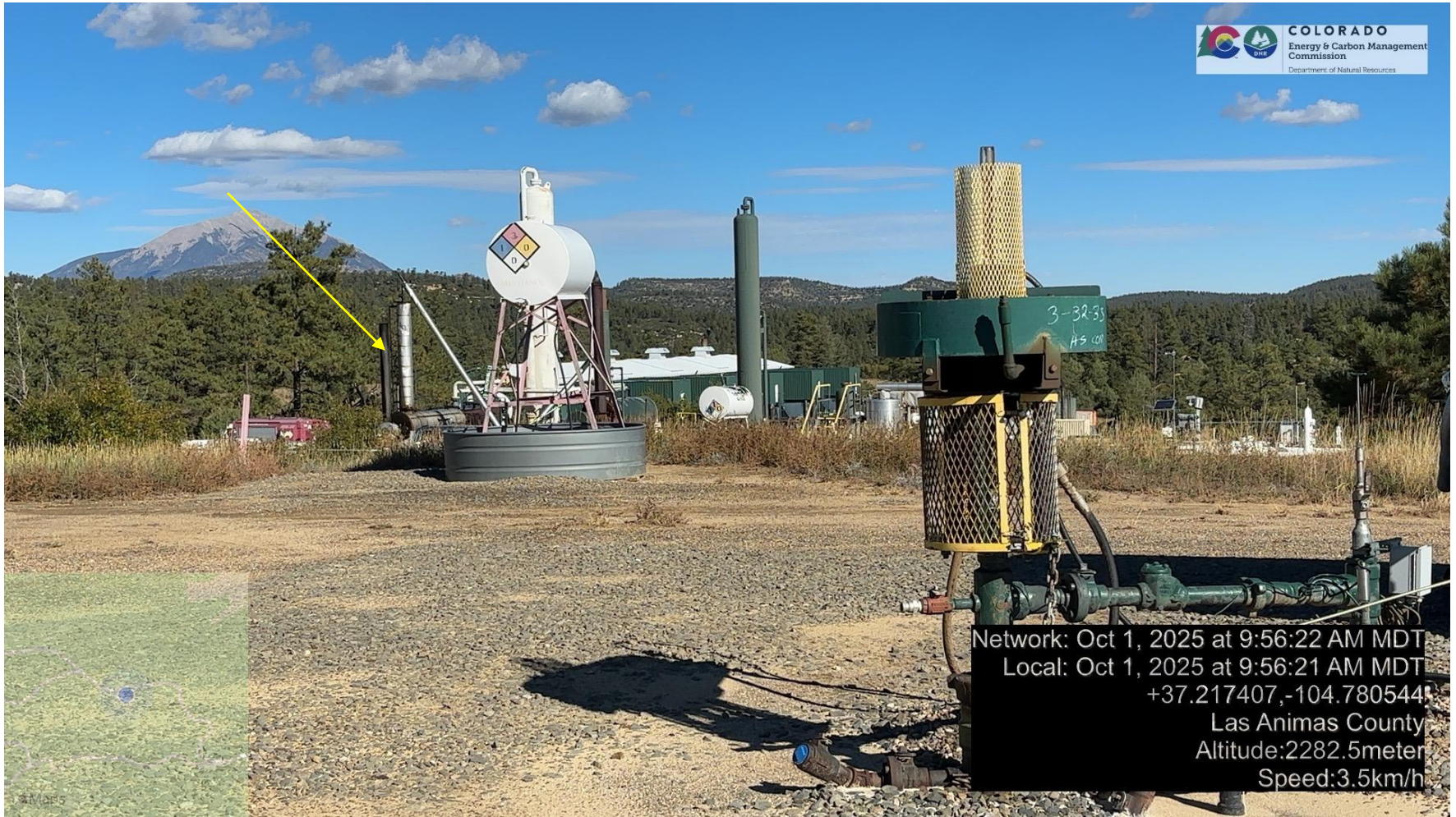
PHOTO 3: AROW SHOWING THE EQUIPMENT WITH THE FAILURE APP. 120' TO THE NORTH OF THE EDGE OF LOCATION, THERE IS A ROW BETWEEN THE METHANOL TANK AND THE DEHYDRATOR EQUIPMENT THAT IS NOT SHOWN IN PHOTO.