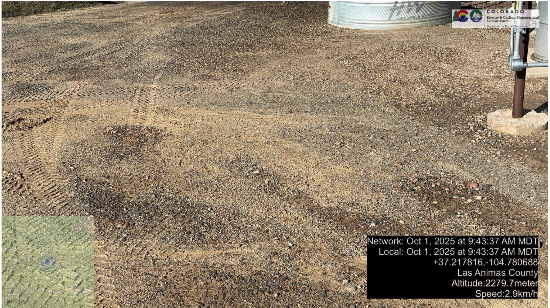
PHOTO 6: ANOTHER IMAGE SHOWING THE SPILL AREA. THE BULK OF THE SPILL FLUID IS APP. 35' AROUND THE EQUIPMENT WITH SOME SPRAY REACHING OUT TO THE EAST AND SOUTH APP. 50'.