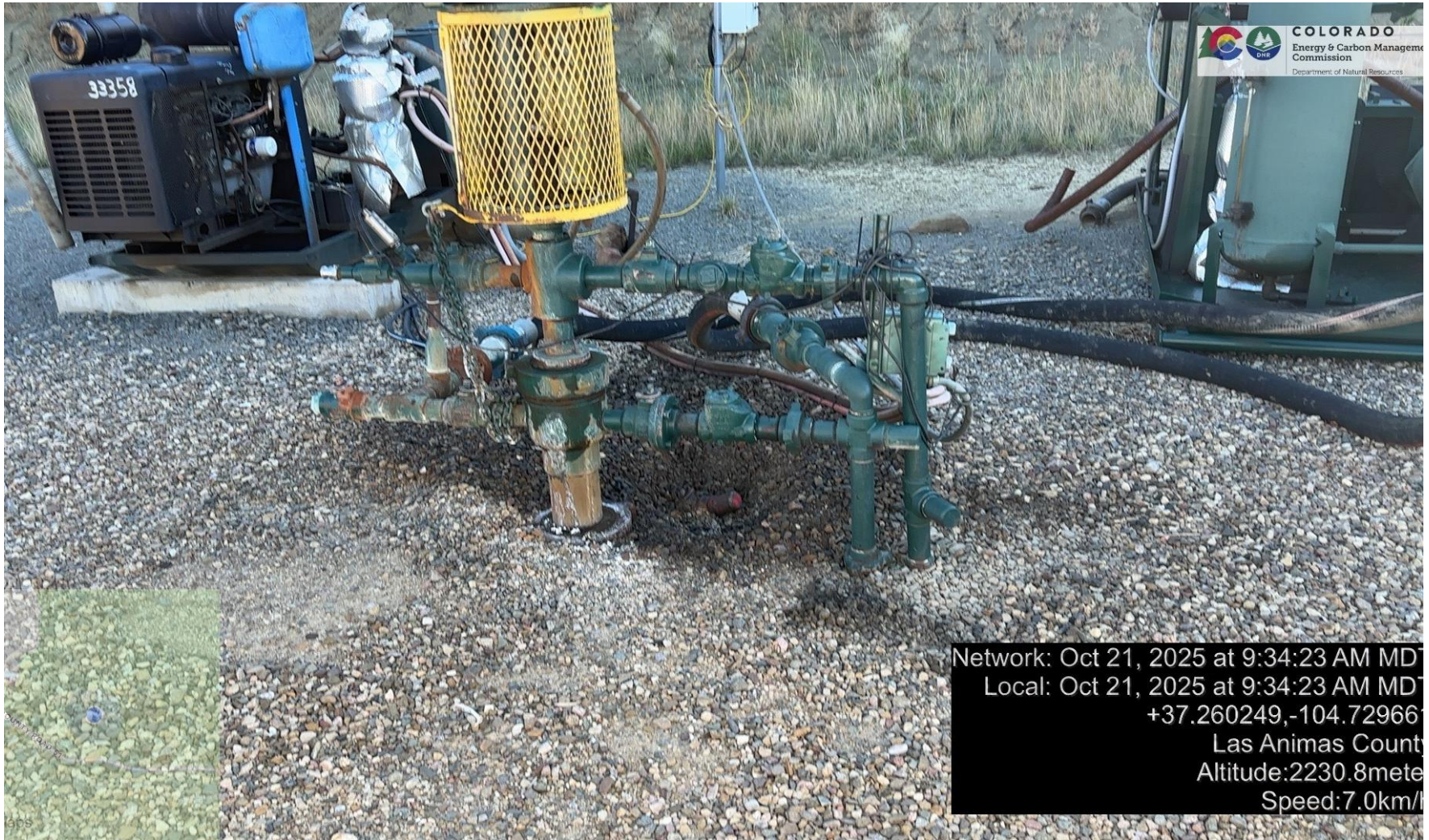
PHOTO 3: THERE IS AN AREA OF IMPACTED SOIL NEXT TO ORIGINAL WELLHEAD. Conduct maintenance on equipment, cleanup stained material and review self inspection processes. COMPLY WITH RULE 1002,.(2).D. CA DATE 11-21-2025.