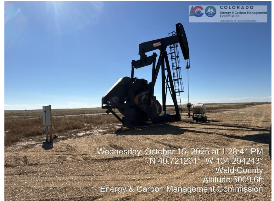
Photo 10 – Pumping Unit