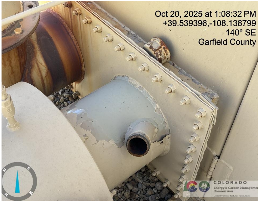
Photo # 22 Open ended pipe on fire tube/wildlife hazard/ available for entry by wildlife