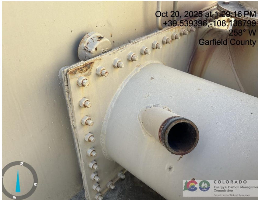
Photo # 24 Open ended pipe on fire tube/wildlife hazard/ available for entry by wildlife