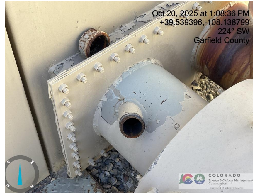
Photo # 23 Open ended pipe on fire tube/wildlife hazard/ available for entry by wildlife