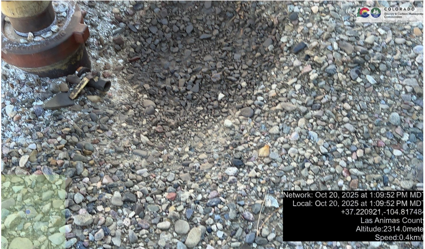
PHOTO 3: AREA OF IMPACTED SOIL FROM LEAKING DRIVEHEAD ON TR WELL. Conduct maintenance on equipment, cleanup stained material and review self inspection processes. COMPLY WITH RULE 1002,(2).D. CA DATE 11-20-2025.