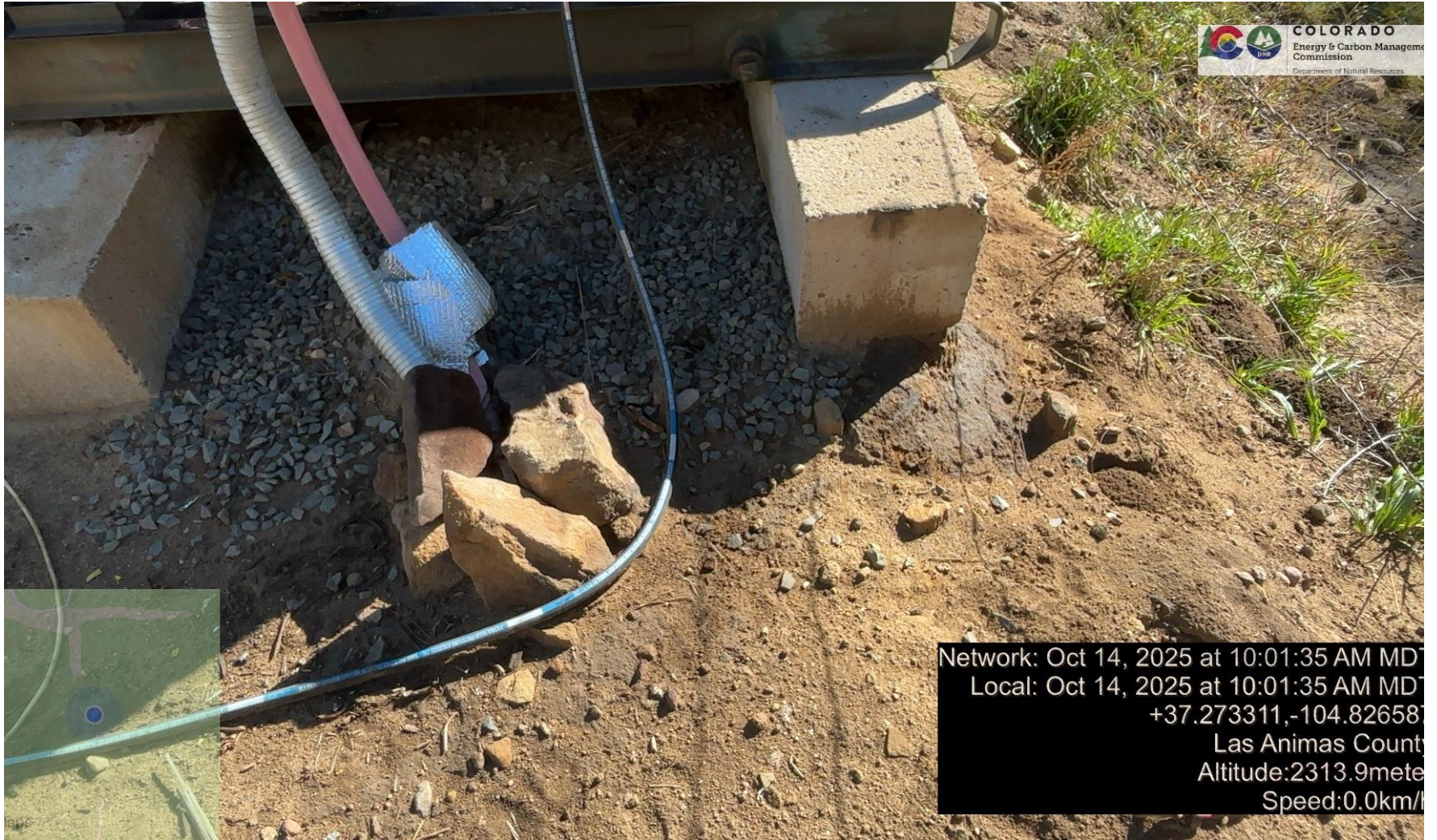
PHOTO 4: AREA OF IMPACTED SOIL NEAR PRIME MOVER. Conduct maintenance on equipment, cleanup stained material and review self inspection processes. COMPLY WITH RULE 1002,(2).D. CA DATE 11-14-2025.