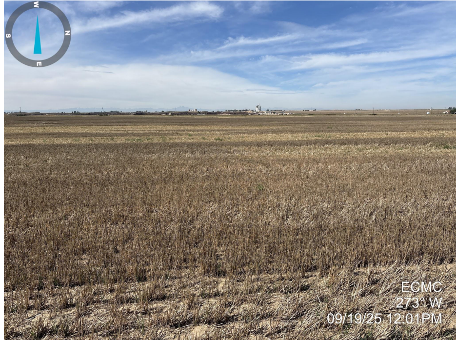
Photo 6. Photo taken of the abandoned well location, facing west. See comments under Photo 3.