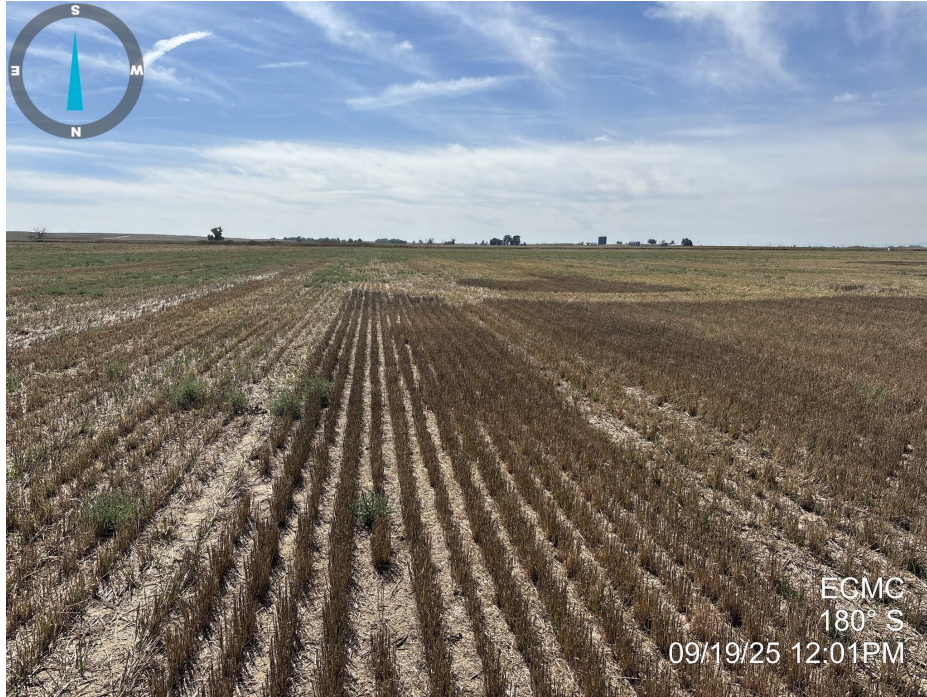
Photo 5. Photo taken of the abandoned well location, facing south. See comments under Photo 3.