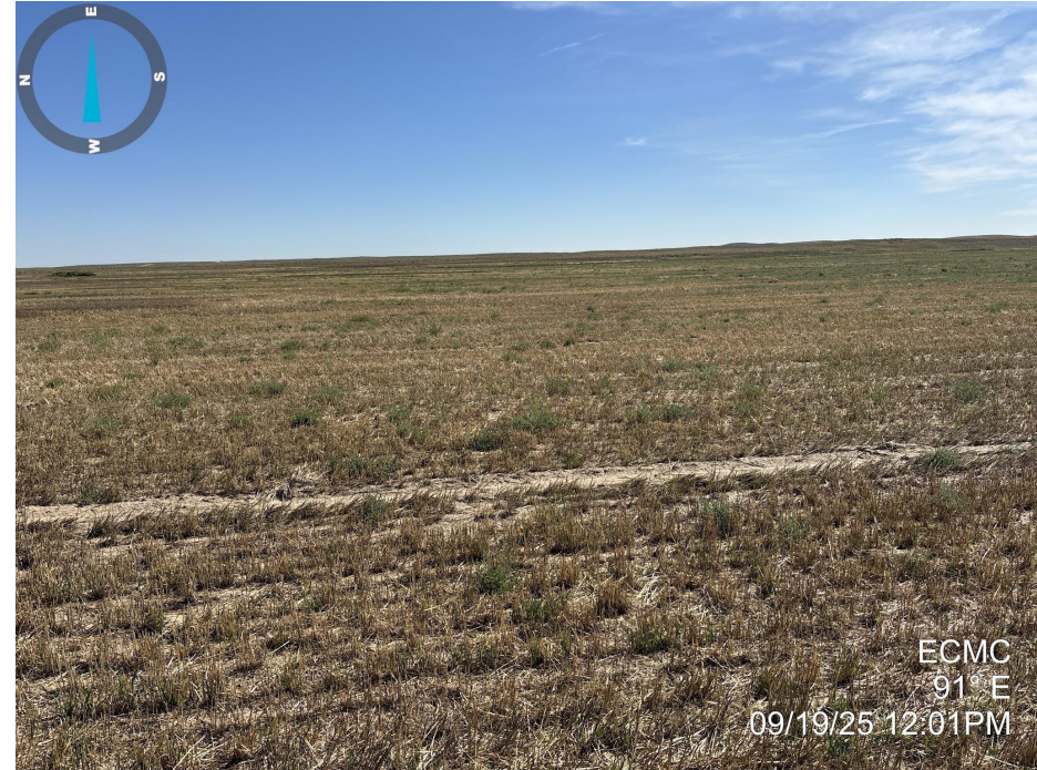
Photo 4. Photo taken of the abandoned well location, facing east. See comments under Photo 3.