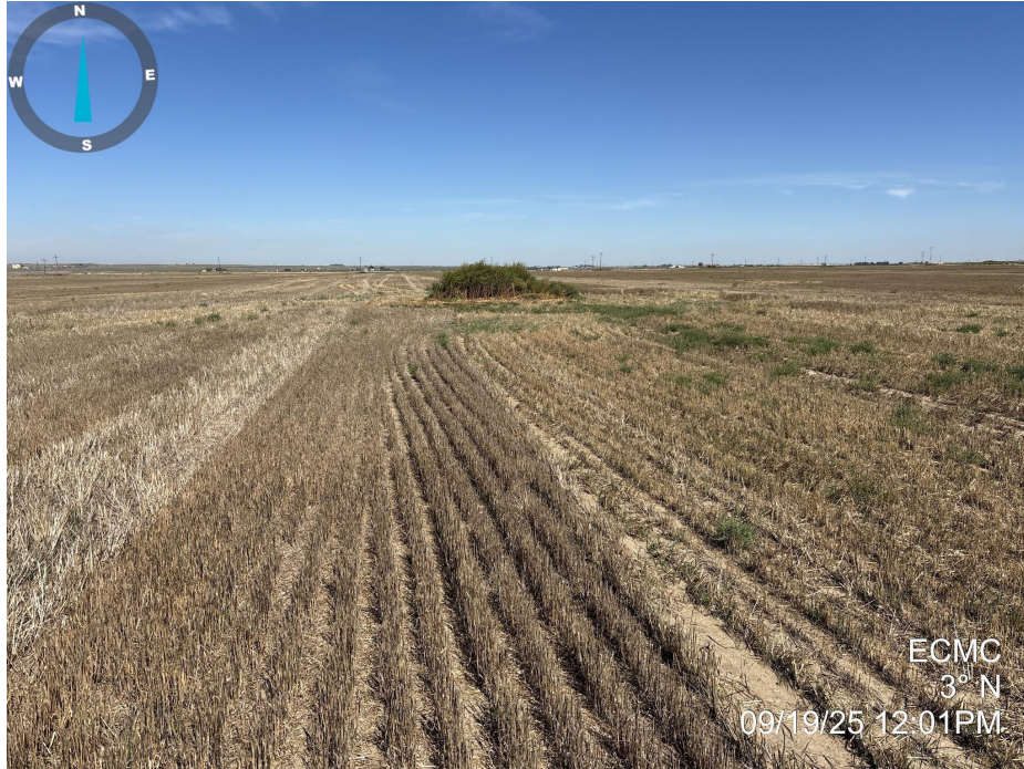
Photo 3. Photo taken of the abandoned well location, facing north. Photo illustrates that there is no evidence of oil and gas disturbance at the location and based on records the well was never drilled.