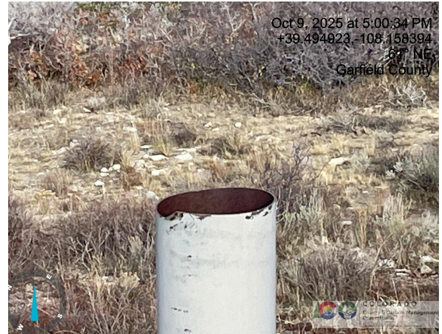
Photo # 6034 Burner exhaust stack on tank heater lacks bird protection/available for entry by wildlife/wildlife hazard