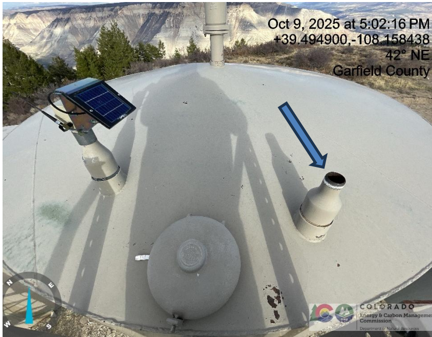
Photo # 6035 Open ended pipe on production tank/available for entry by wildlife/wildlife hazard