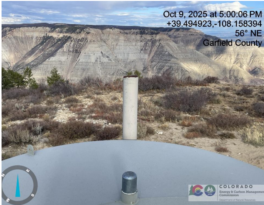
Photo # 6033 Burner exhaust stack on tank heater lacks bird protection/available for entry by wildlife/wildlife hazard