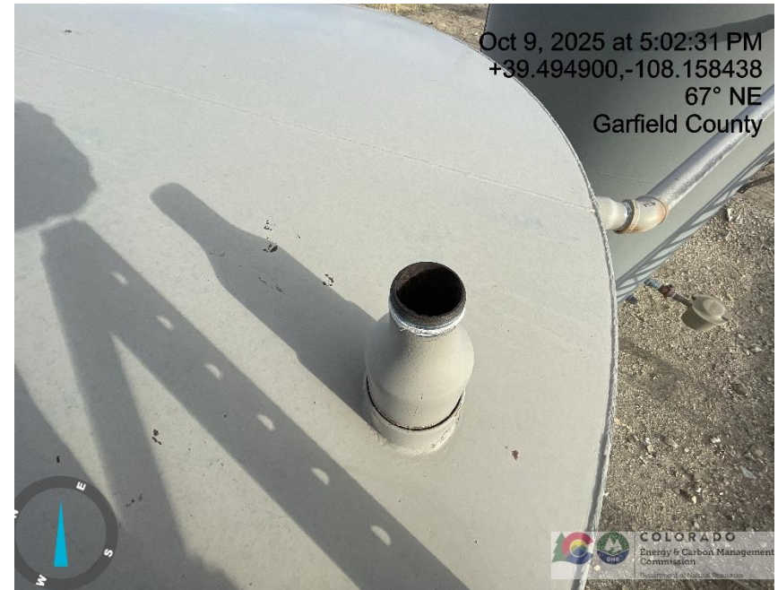
Photo # 6036 Open ended pipe on production tank/available for entry by wildlife/wildlife hazard