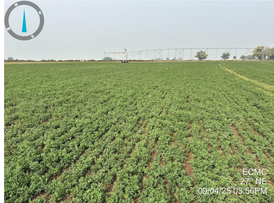
Photo 8. Photo taken of the reference area to the well location, northwest of the location, facing northeast. Photo illustrates alfalfa cropland.