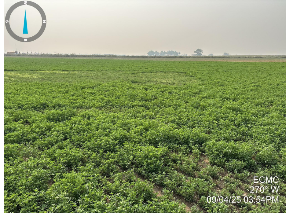
Photo 6. Photo taken of the well location, facing west. See comments under Photo 3.