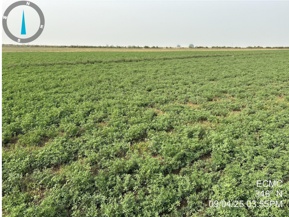
Photo 7. Photo taken of the access road to the well location, facing north. Photo illustrates that vegetation establishment meets Rule 1004 standards.