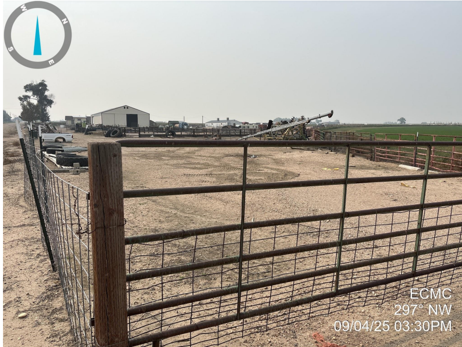
Photo 9. Photo taken of the tank battery location, facing northwest. Photo illustrates that final reclamation activities have taken place and the tank battery is now located within a land use change.