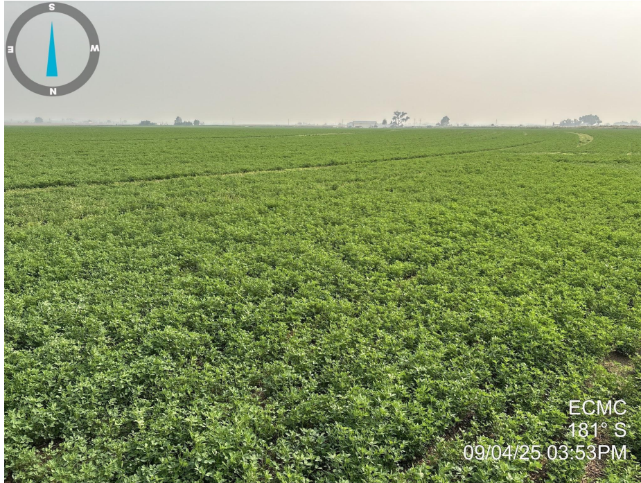
Photo 5. Photo taken of the well location, facing south. See comments under Photo 3.