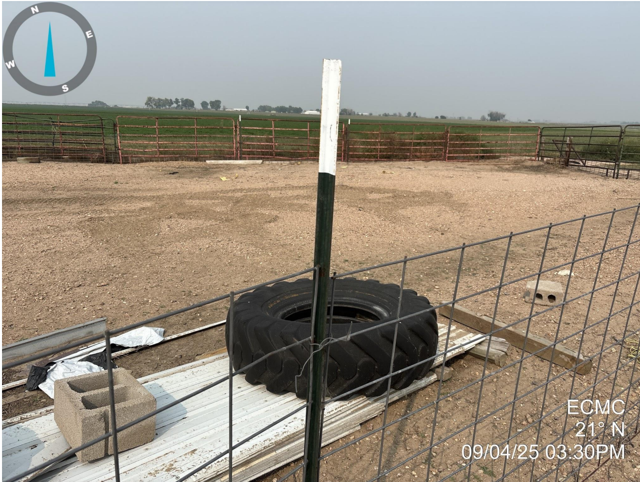
Photo 11. Photo taken of the tank battery location, facing north. See comments under Photo 9.