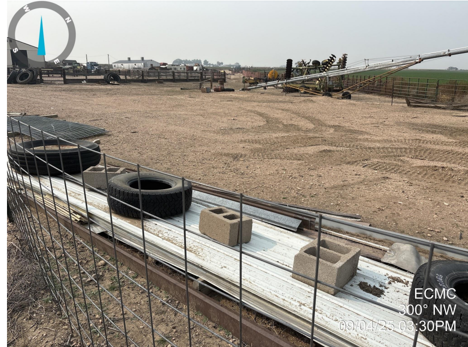
Photo 10. Photo taken of the tank battery location, facing northwest. See comments under Photo 9.