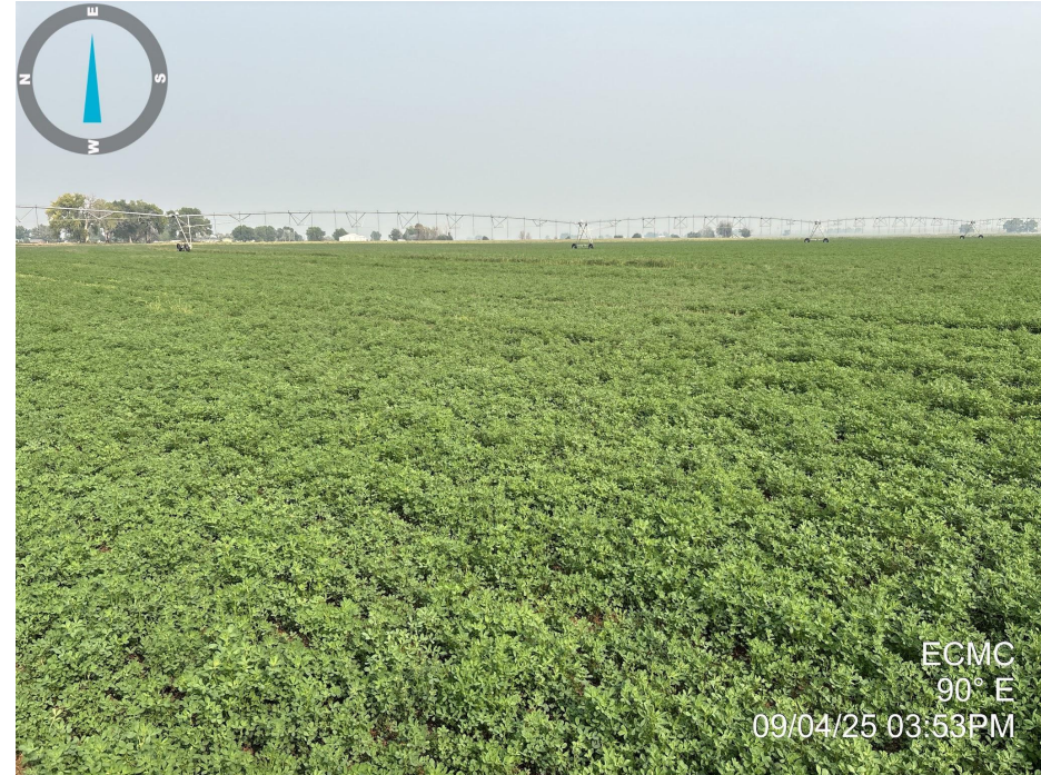
Photo 4. Photo taken of the well location, facing east. See comments under Photo 3.