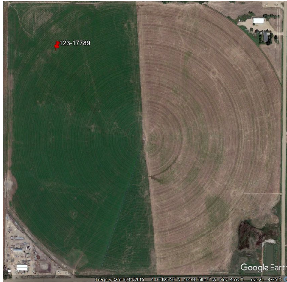
Photo 1. Google Earth Aerial Imagery from October 14, 2017 depicting the well location, access road, and associated off-location tank battery at the time of active operations.