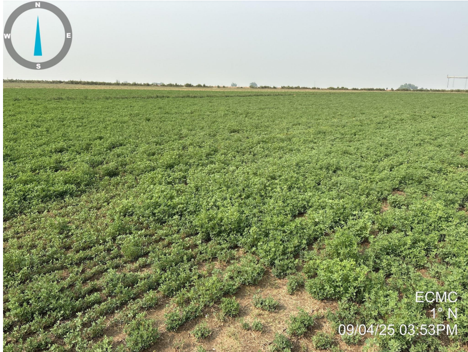
Photo 3. Photo taken of the well location, facing north. Photo illustrates that the well location meets Rule 1004 standards.