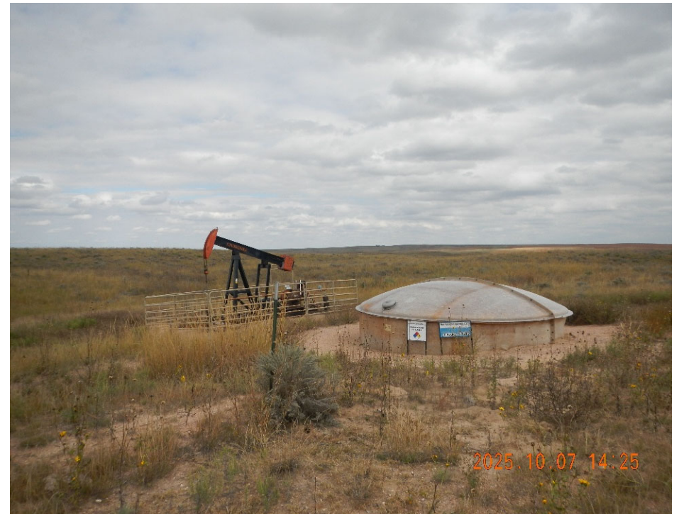
4. Well location overview.