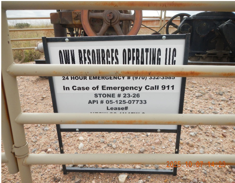
1. Lease sign at well location.