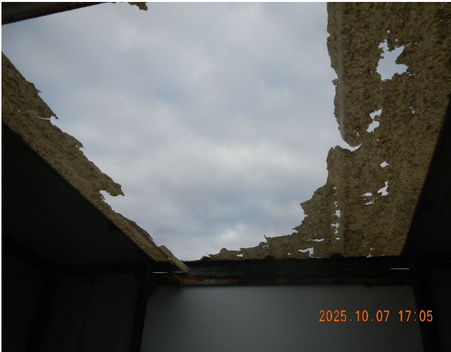
7. Damage to Meter Shed roof.