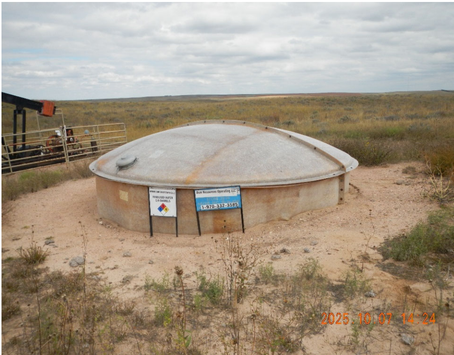
3. View of production tank at well location.