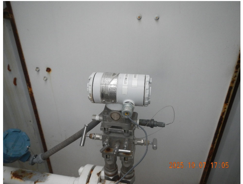
8. Gas meter inside meter shed.