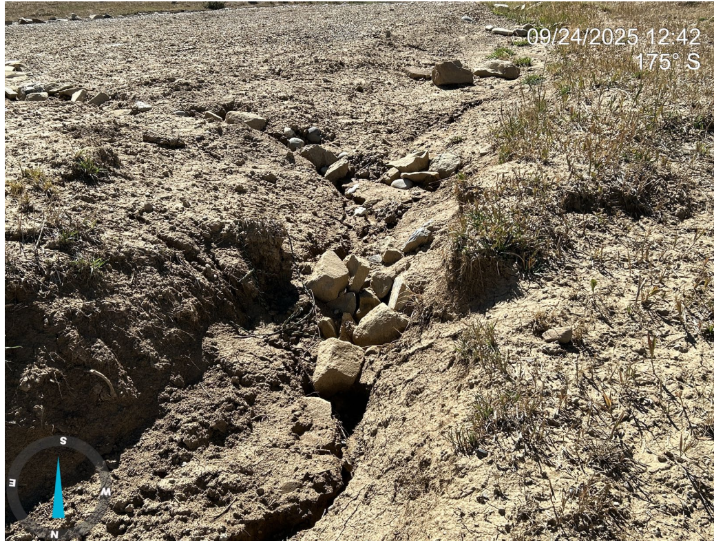
Photo 5: Photos showing stormwater controls on the northern portion of the location appear to be in disrepair. Sediment deposition and erosion is evident. Stormwater BMPs do not appear to be constructed per good engineering practices. Comply with 1002.f. and implement or maintain stormwater BMPs.