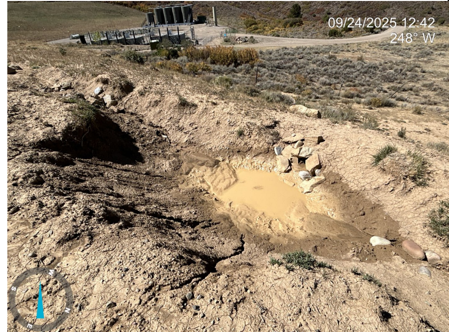
Photo 3: Photos showing stormwater controls on the northern portion of the location appear to be in disrepair. Sediment migration and rilling is evident. Stormwater BMPs do not appear to be constructed per good engineering practices. Comply with 1002.f. and implement and/or maintain stormwater BMPs.