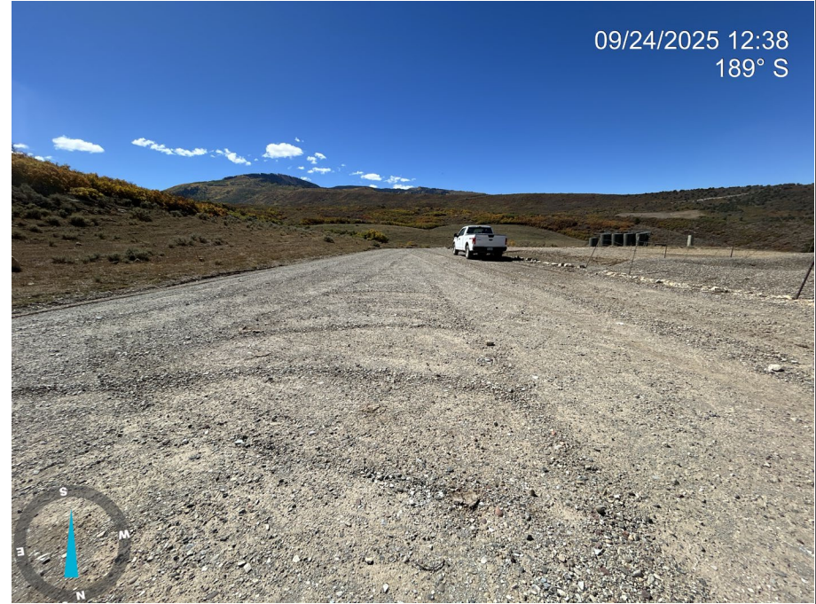
Photo 1: Photos showing an overview of the location looking northeast and south, respectively.