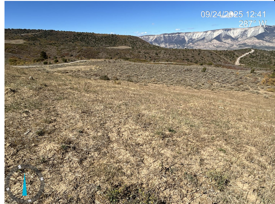
Photo 2: Photos showing interim areas at the location are composed of smooth brome and intermediate wheatgrass, with secondary amounts of curlycup gumweed and trace amounts of big sagebrush. Interim areas are progressing towards 1003 reclamation requirements.