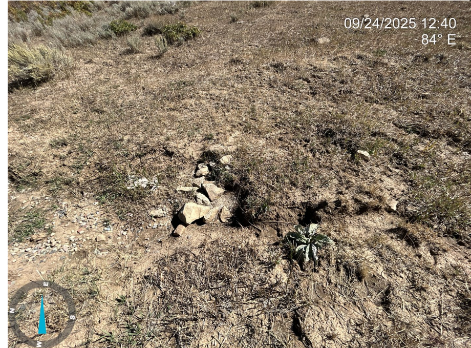
Photo 4: Photos showing stormwater controls on the northern portion of the location appear to be in disrepair. Sediment deposition and erosion is evident. Stormwater BMPs do not appear to be constructed per good engineering practices. Comply with 1002.f. and implement or maintain stormwater BMPs.