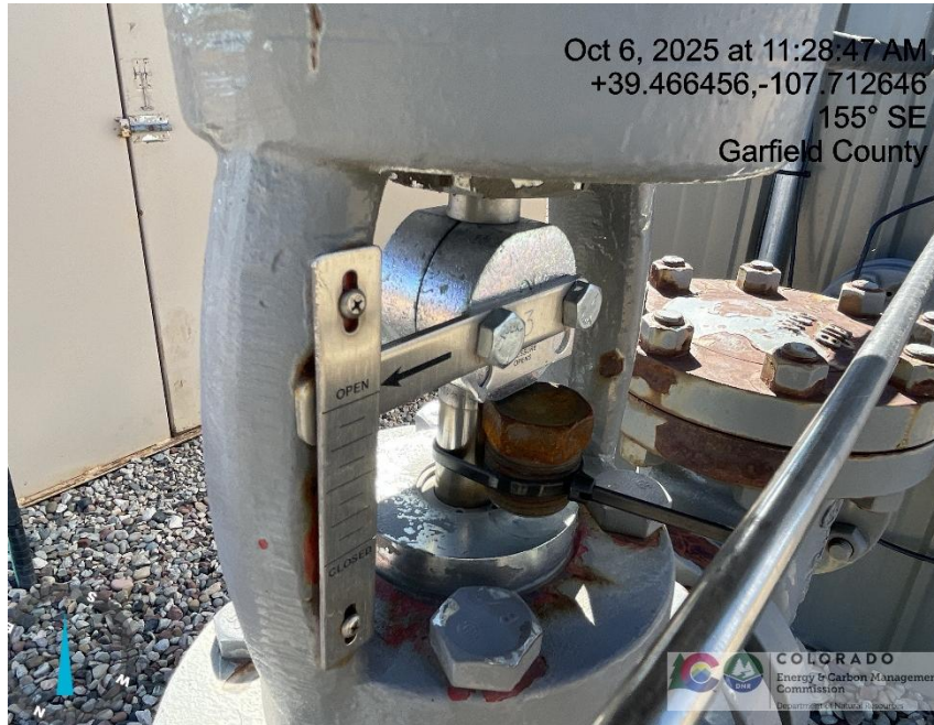
Photo # 3972 Pneumatic control valve on summit pipeline has been modified/valve no longer has the ability to close