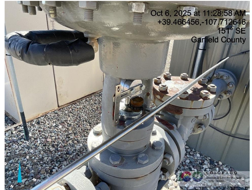
Photo # 3971 Pneumatic control valve on summit pipeline has been modified/valve no longer has the ability to close