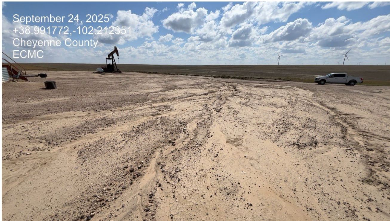
Photo 10 Facing southeast at the location showing erosion channels across the location.