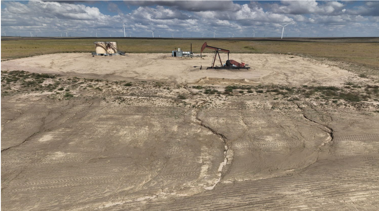
Photo 11. Drone aerial photo facing north toward the location.