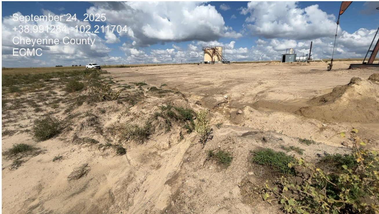
Photo 6. Stormwater has eroded the berm along the south side of the location which was not properly constructed with armored outlets/ sediment traps/ ect.