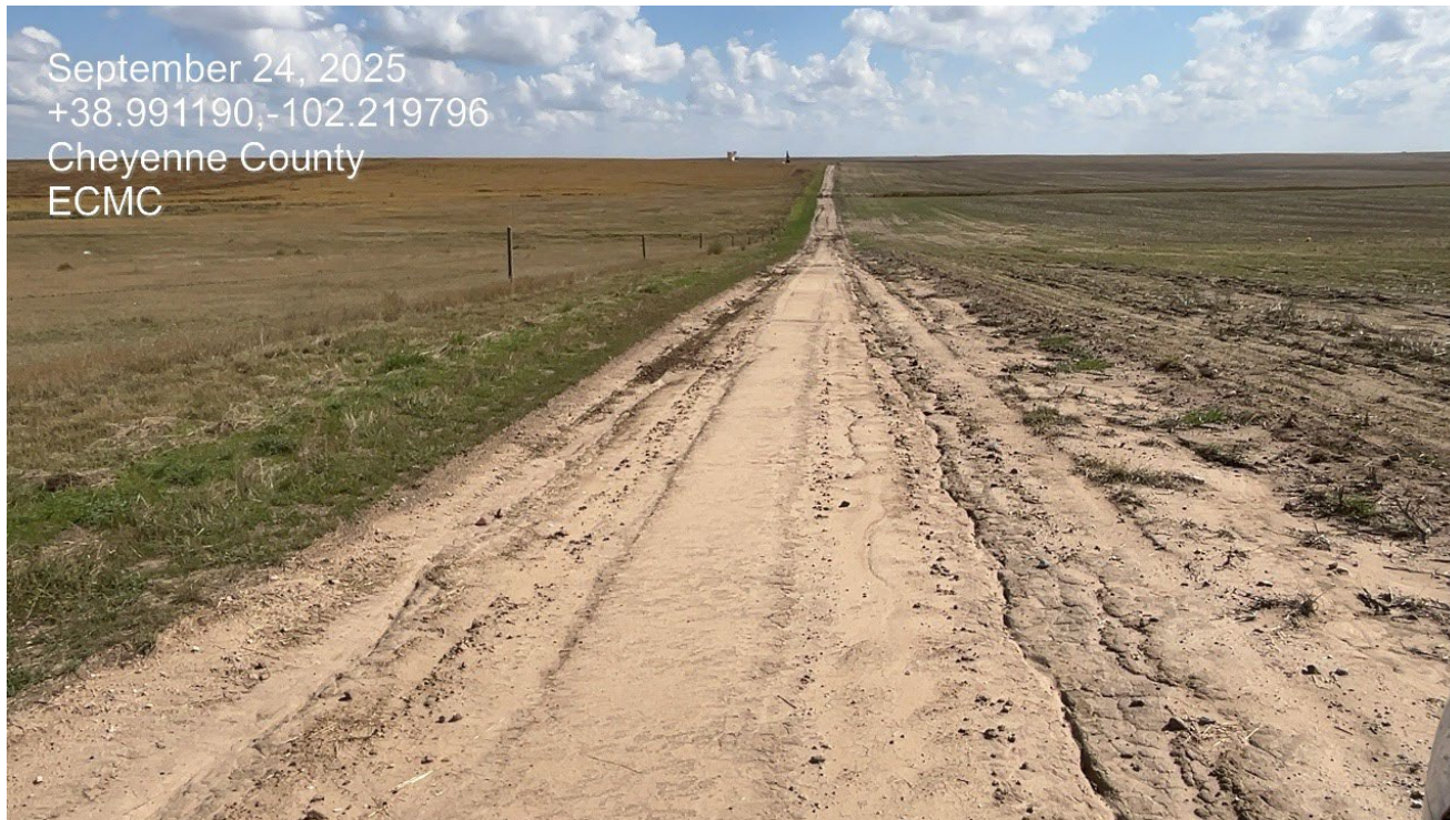
Photo 1. Facing east along the access road. Stormwater is eroding the road and is not properly diverted off the road with BMP's.