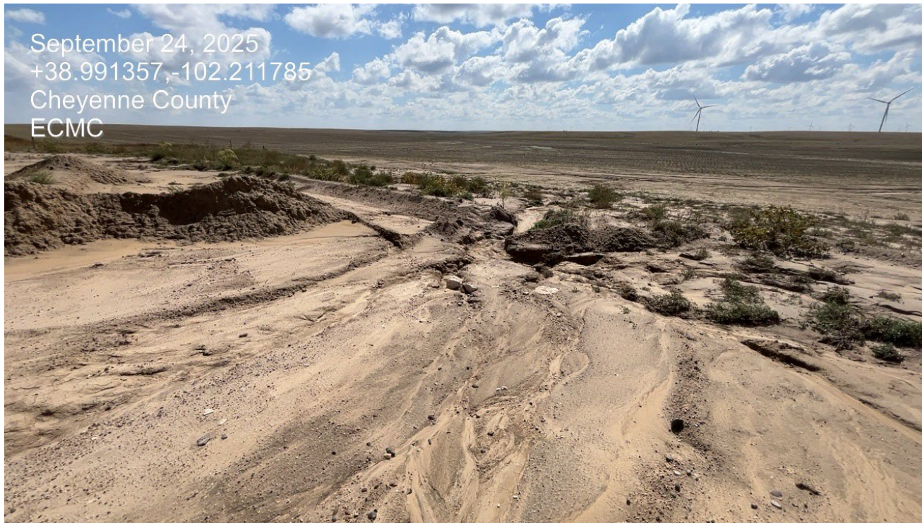
Photo 5. Stormwater has eroded the berm along the south side of the location which was not properly constructed with armored outlets/ sediment traps/ ect.