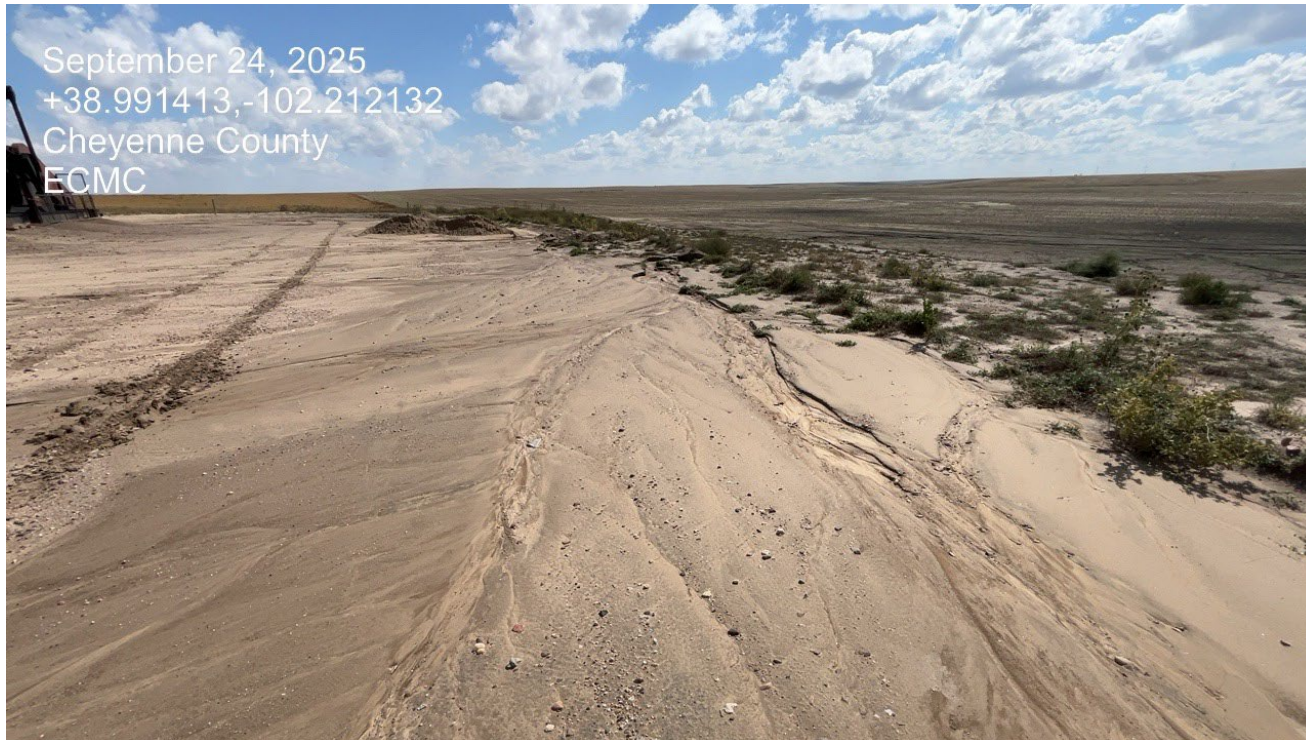
Photo 4. Facing east at the south side of the location. This area is not reclaimed or stabilized. The perimeter berm has filled in with sediment and has eroded.