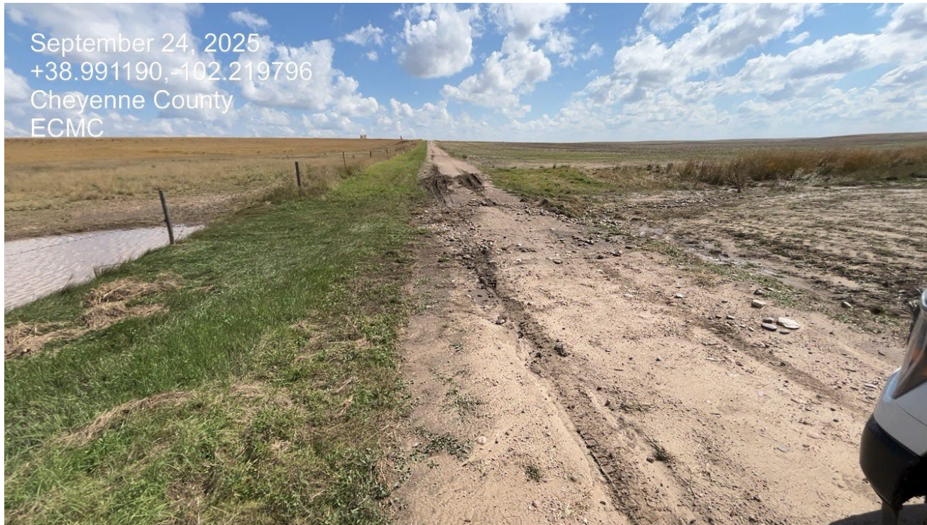
Photo 2. Facing east along the access road. The road has eroded in this area. It appears a culvert needs to be installed in this area.