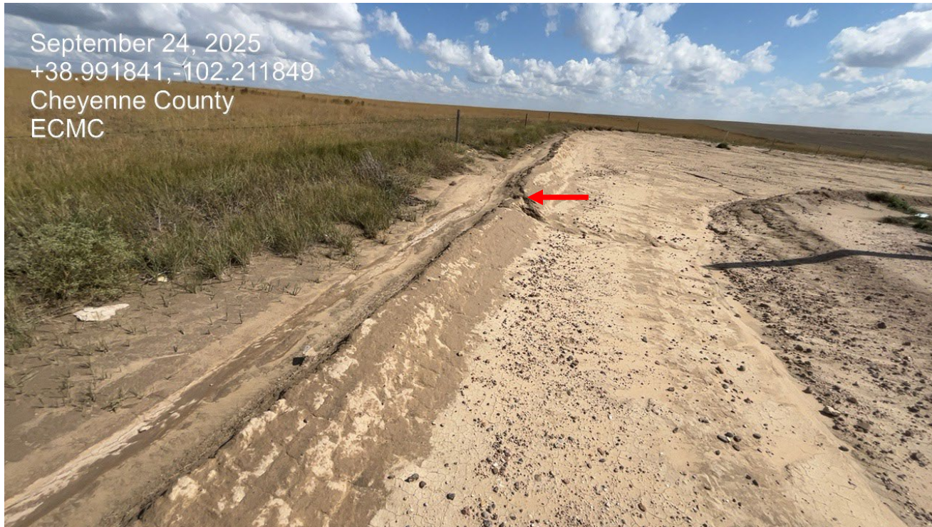
Photo 9. Facing east at the north side of the location. The diversion ditch has eroded at red arrow.