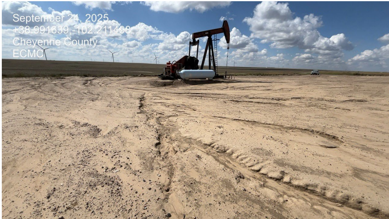
Photo 8. Facing southwest at the location showing stormwater erosion across the location. This unused area of the location needs to be reclaimed.