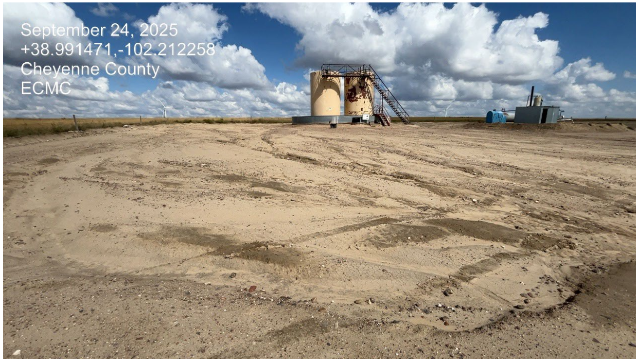
Photo 3. Facing northeast toward the location.