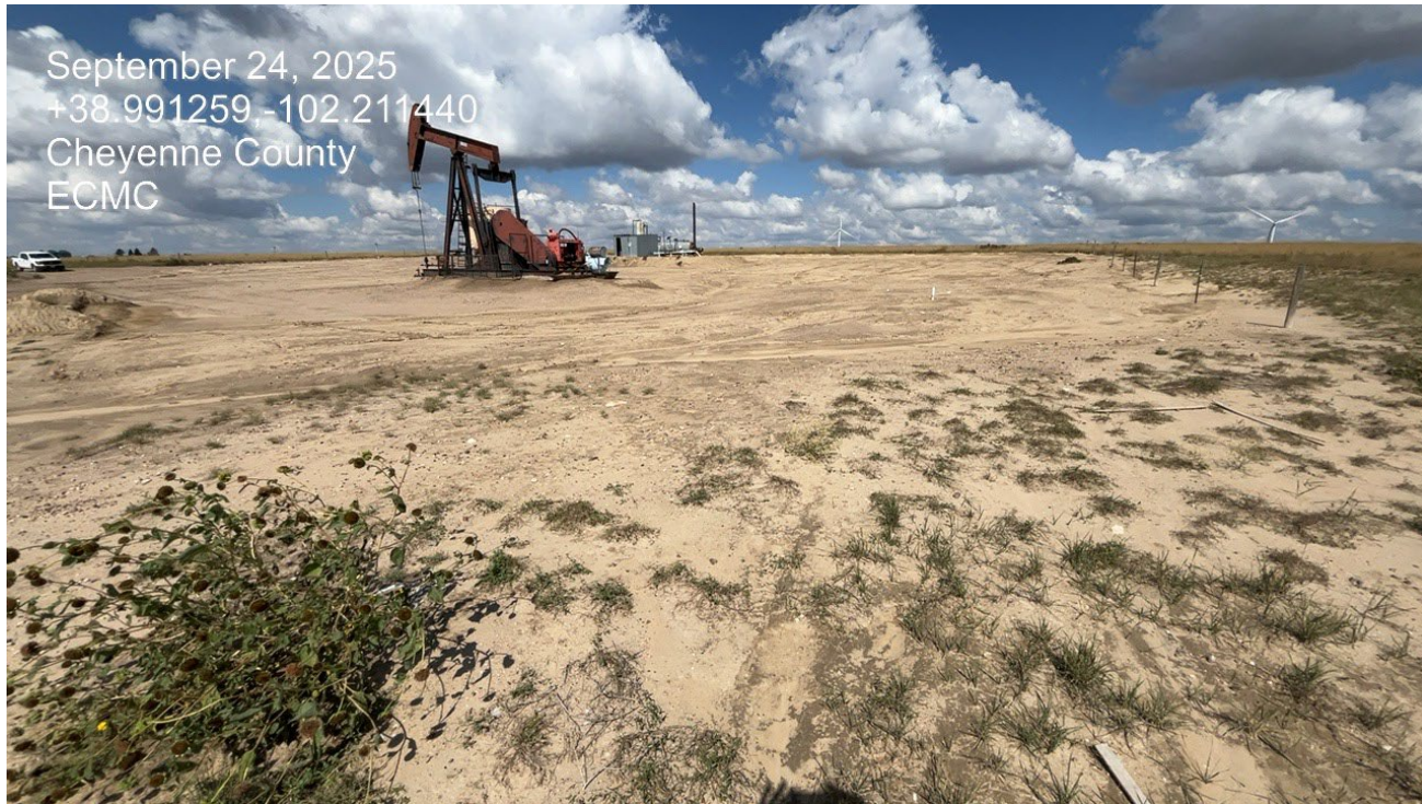
Photo 7. Facing north at the east side of the location. There are used areas of the location that need to be reclaimed which will help stabilize the location to prevent erosion.