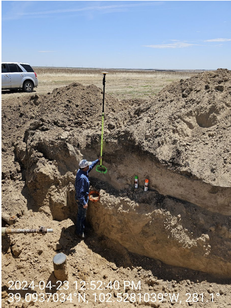
Low 1 B SWD Sampling WH-2 Photo 1