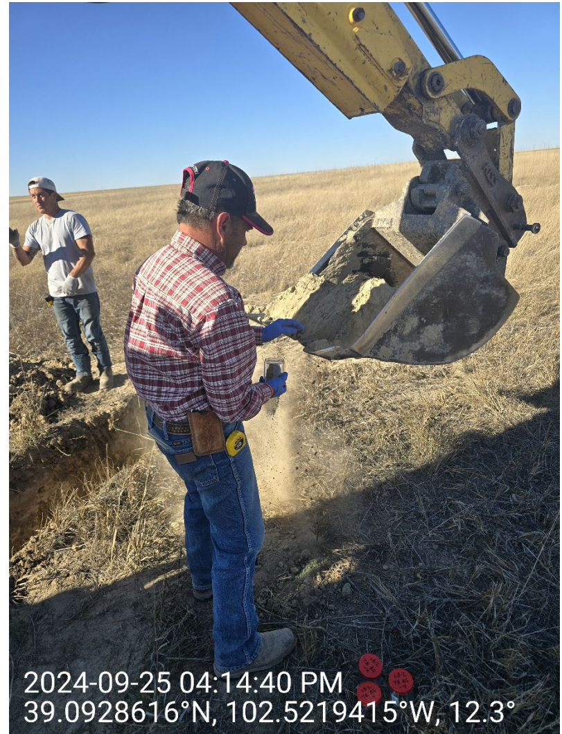
Low 1B TBBG-4 Sampling Photo 1

2024-09-25 04:14:40 PM 39.0928616°N, 102.5219415°W, 12.3°