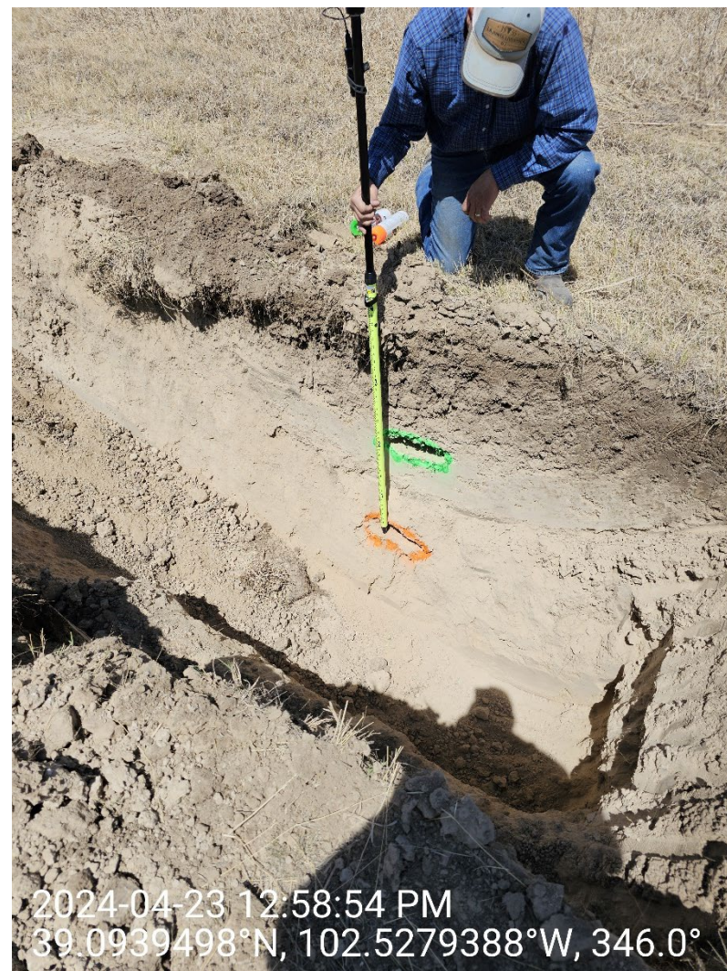
Lowe 1 B SWD Sampling WHBG-4 Photo 2