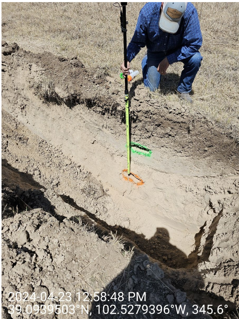
Lowe 1 B SWD Sampling WHBG-4 Photo 1