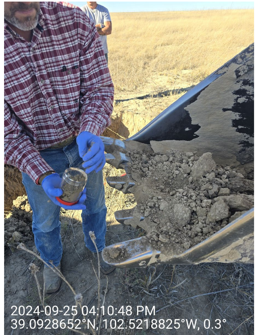
Lowe 1B TBBG-2 Sampling Photo 1

2024-09-25 04:10:48 PM 39.0928652°N, 102.5218825°W, 0.3°