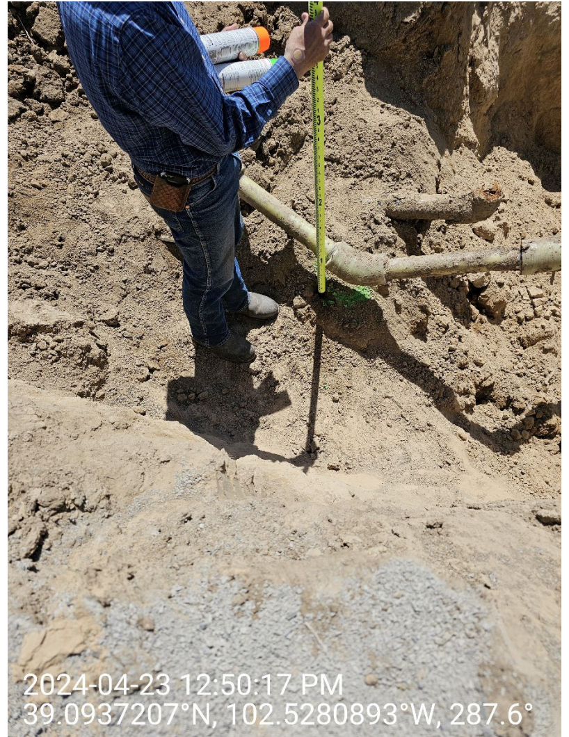
Low 1 B SWD Sampling FL90-4 Photo 2