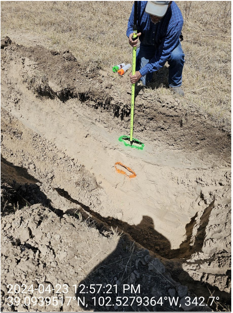
Low 1 B SWD Sampling WHBG-2 Photo 2