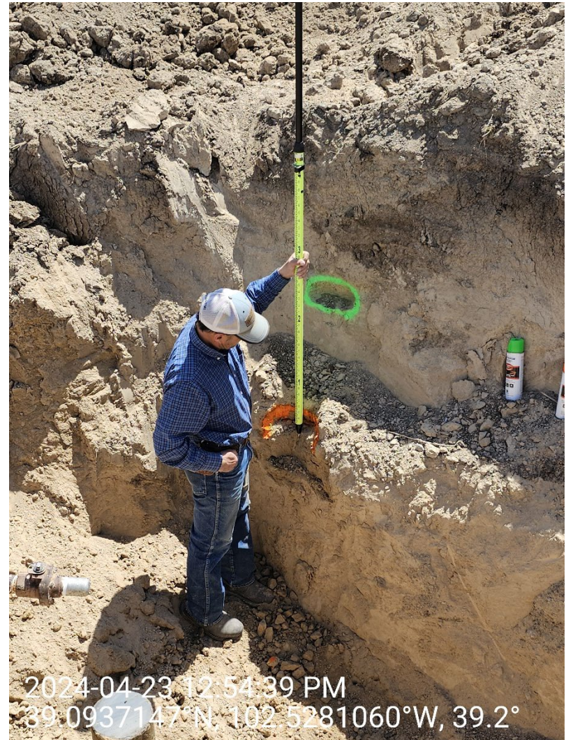
Lowe 1 B SWD Sampling WH-4 Photo 2