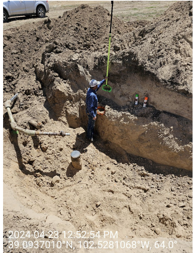
Low 1 B SWD Sampling WH-2 Photo 2