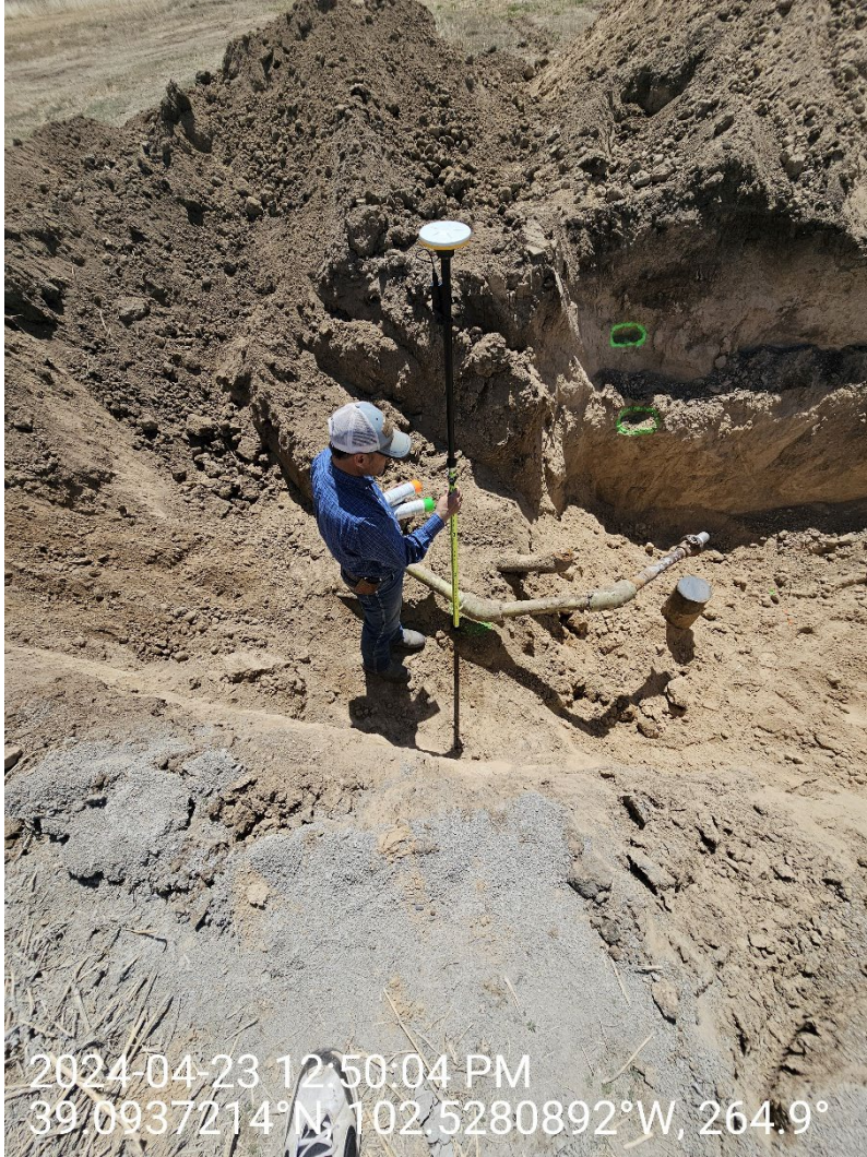
Low 1 B SWD Sampling FL90-4 Photo 1