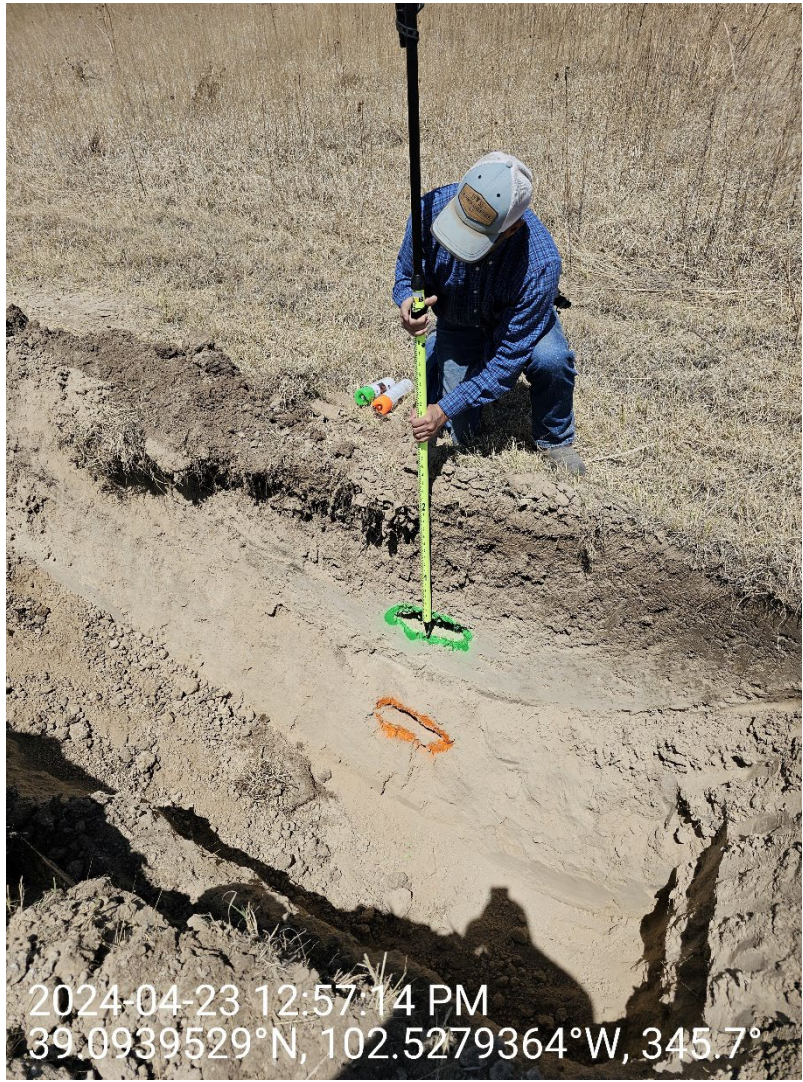
Low 1 B SWD Sampling WHBG-2 Photo 1