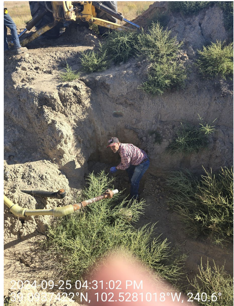
Low 1 B SWD Sampling FL90-6 Photo 2