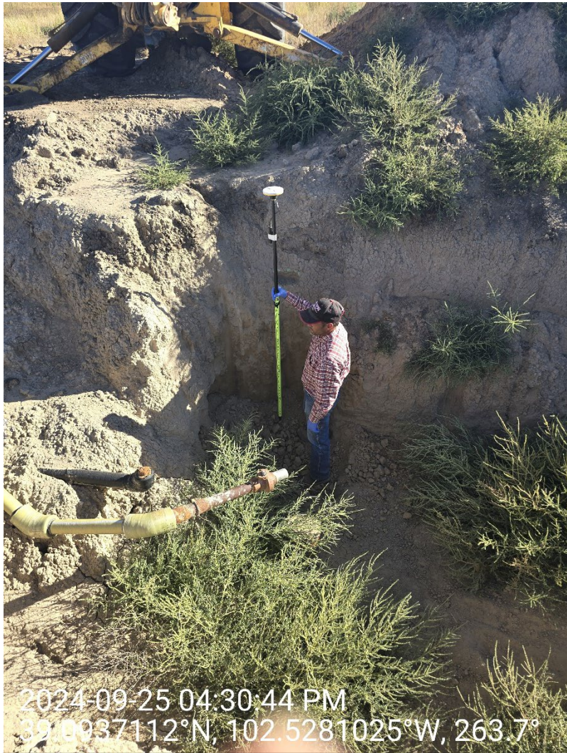
Low 1 B SWD Sampling FL90-6 Photo 1