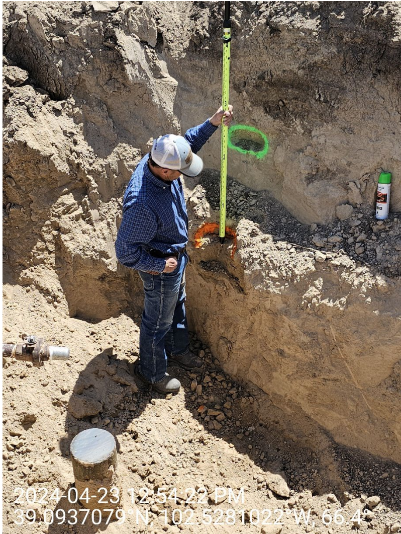
Lowe 1 B SWD Sampling WH-4 Photo 1