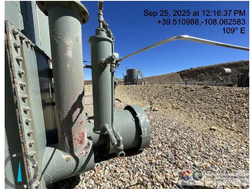
Photo # 2546 PRV vent line on tank burner does not comply with CECMC pressure safety device rules

Photo # 2547 PRV vent line on tank burner does not comply with CECMC pressure safety device rules