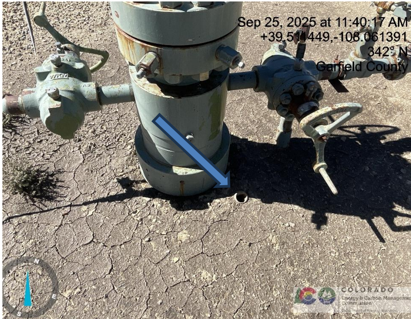
Photo # 2534 Open ended piping near wellhead/wildlife hazard/available for entry by wildlife