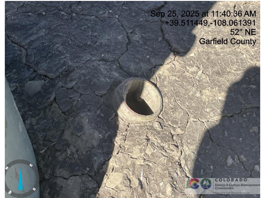
Photo # 2535 Open ended piping near wellhead/wildlife hazard/available for entry by wildlife