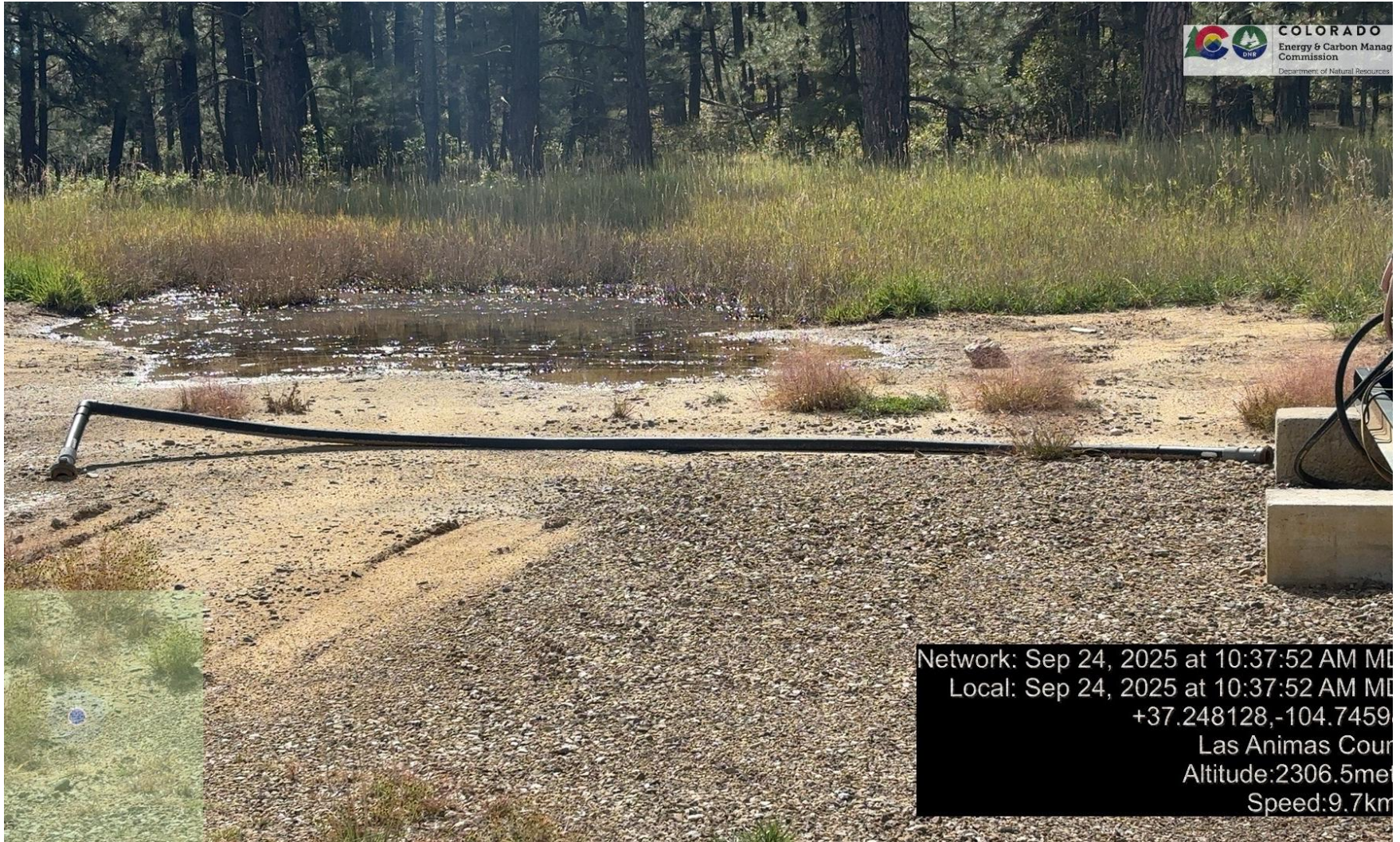
PHOTO 5: THE STORMWATER POOLING ON LOCATION SHOULD BE DRAINED. INSTALL AND MAINTAIN BMP'S TO PREVENT STORMWATER POOLING ON LOCATIONS PER 1002 SERIES RULES. CA DATE 10-24-2025.