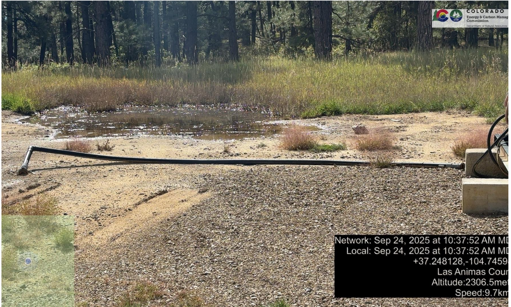
PHOTO 3: UNUSED 2" POLY PIPE STORED ON LOCATION. REMOVE UNUSED EQUIPMENT PER RULE 606. CA DATE 10-24-2025.