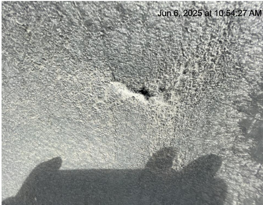
Photo # 6913 From inspection/audit 708906677 conducted on 06/06/2025 Hole in liner/liner needs maintenance