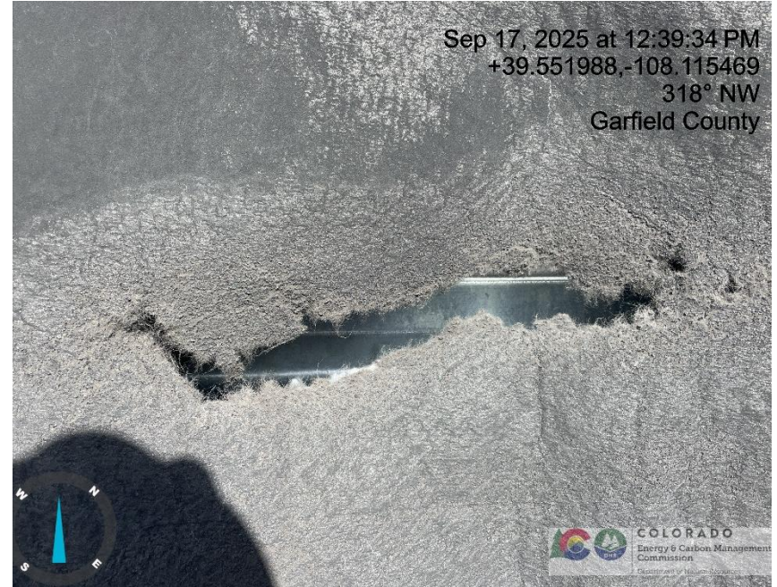
Photo # 6911 From inspection/audit 708906677 conducted on 06/06/2025 Hole in liner/liner needs maintenance