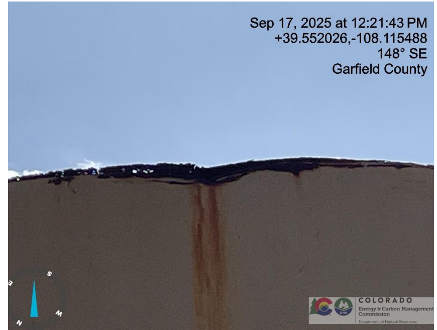
Photo # 6899 From inspection/audit 708906677 conducted on 06/06/2025 Tank failure/tank lacks integrity