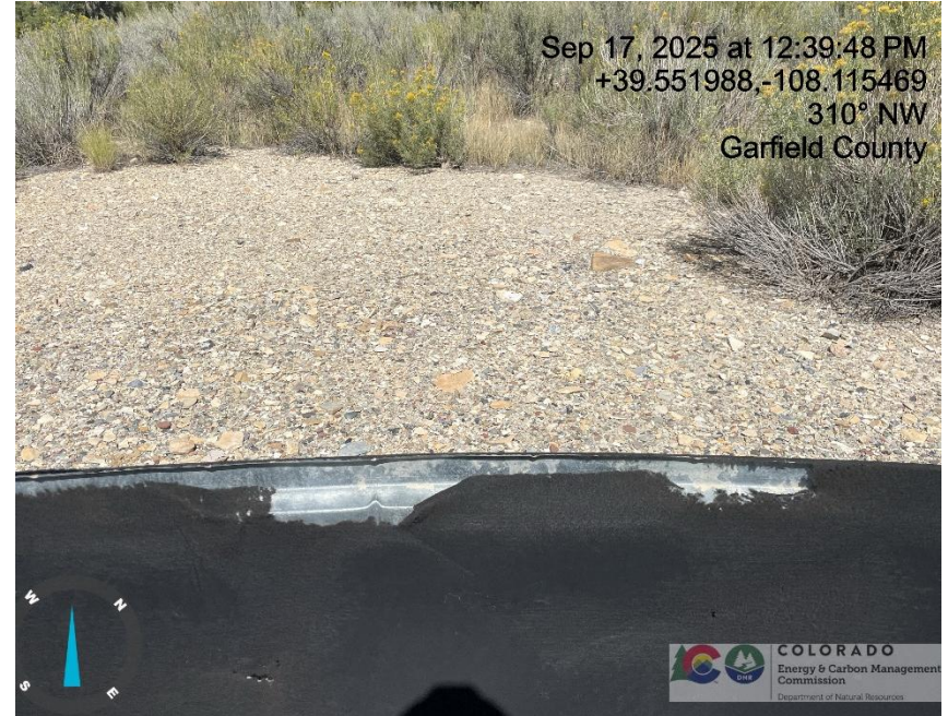
Photo # 6912 From inspection/audit 708906677 conducted on 06/06/2025 Holes in liner/liner needs maintenance