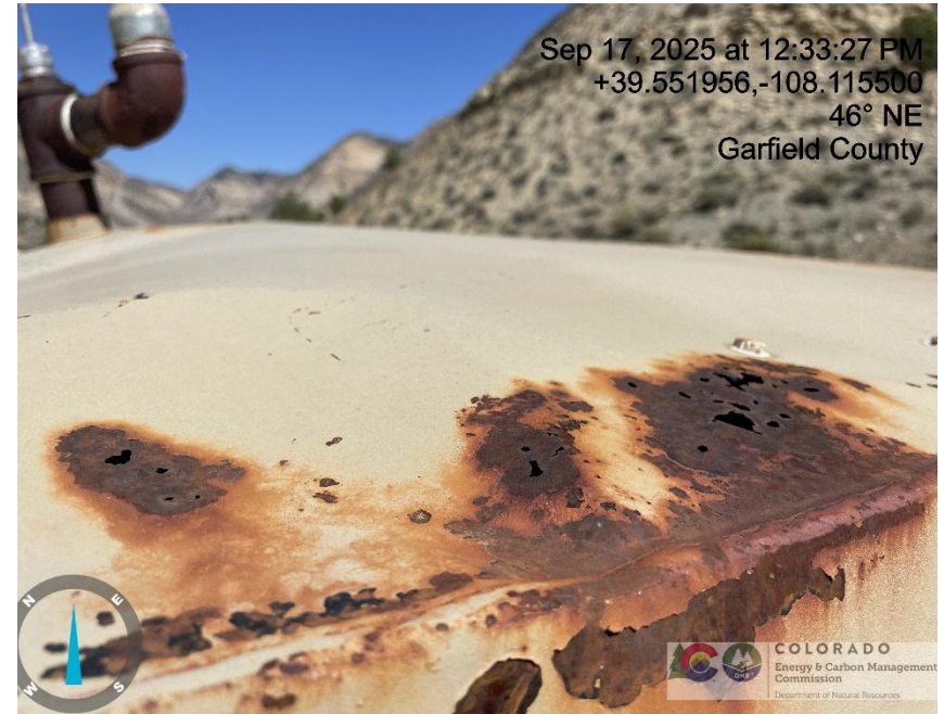
Photo # 6904 From inspection/audit 708906677 conducted on 06/06/2025 Tank failure Multiple holes in tank/tank lacks integrity