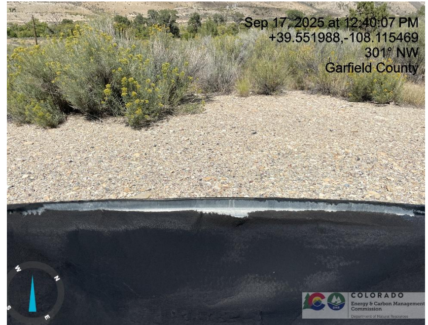
Photo # 6919 From inspection/audit 708906677 conducted on 06/06/2025 Liner in disrepair/liner needs maintenance