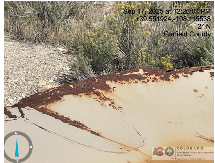
Photo # 281 Tank failure Multiple holes in tank/tank lacks integrity