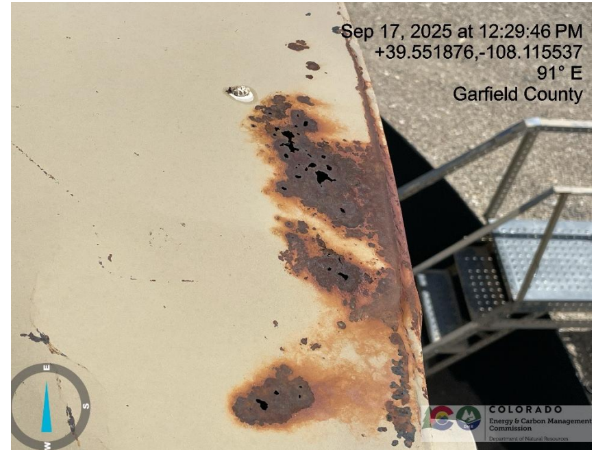
Photo # 282 Tank failure Multiple holes in tank/tank lacks integrity