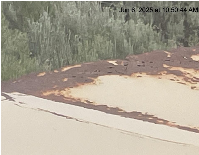
Photo # 6902 From inspection/audit 708906677 conducted on 06/06/2025 Tank failure Multiple holes in tank/tank lacks integrity