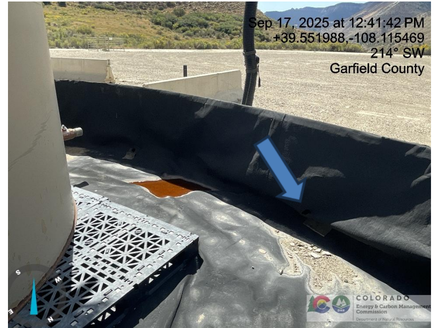
Photo # 6915 From inspection/audit 708906677 conducted on 06/06/2025 Hole in liner/liner needs maintenance