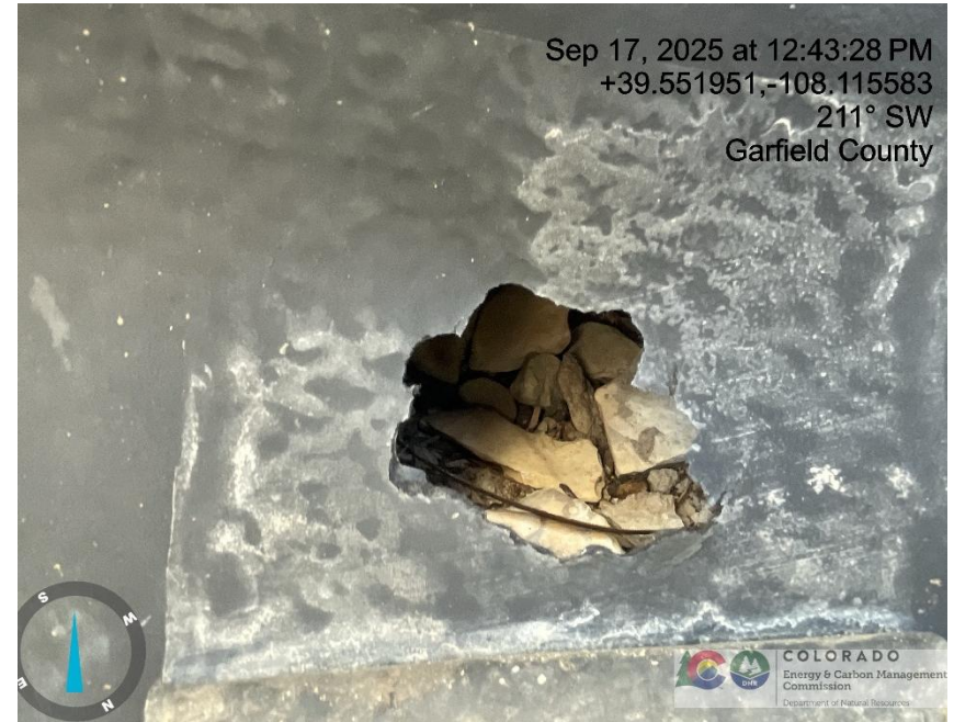
Photo # 6918 From inspection/audit 708906677 conducted on 06/06/2025 Hole in liner/liner needs maintenance