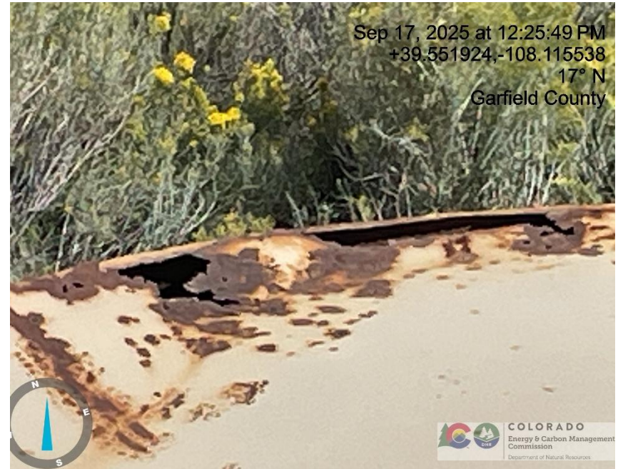
Photo # 6900 From inspection/audit 708906677 conducted on 06/06/2025 Tank failure Multiple holes in tank/tank lacks integrity