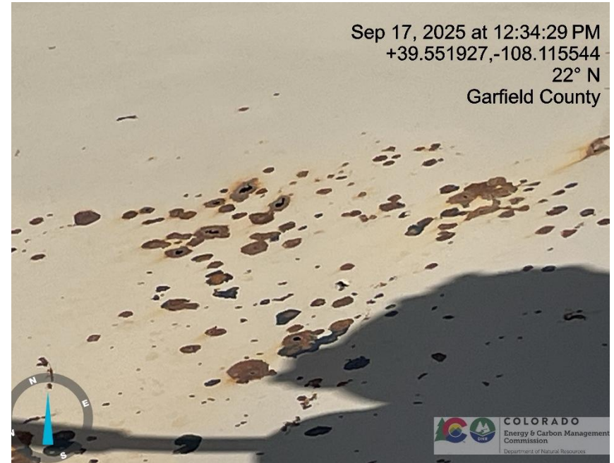
Photo # 6906 From inspection/audit 708906677 conducted on 06/06/2025 Tank failure Multiple holes in tank/tank lacks integrity