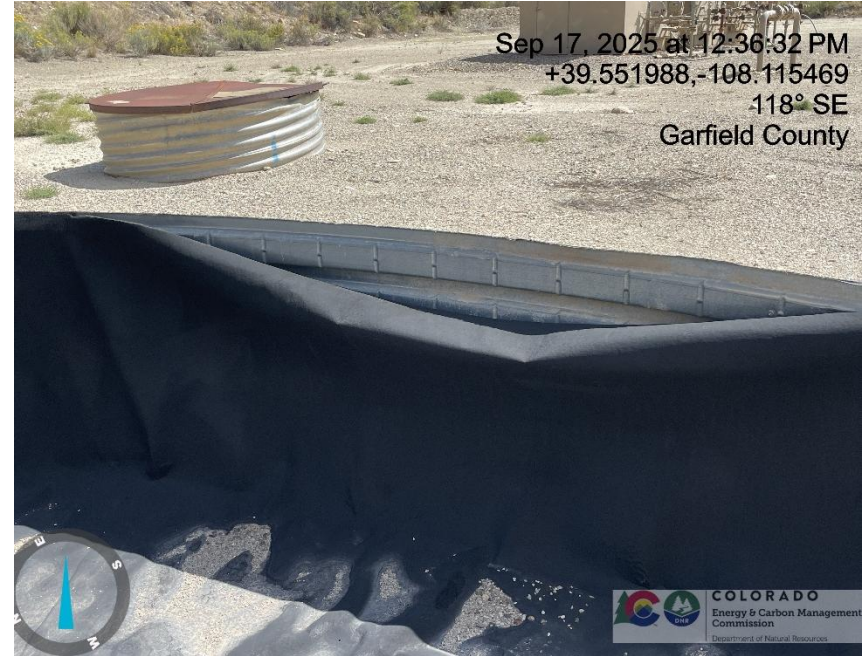
Photo # 6907 From inspection/audit 708906677 conducted on 06/06/2025 Liner in disrepair/liner needs maintenance