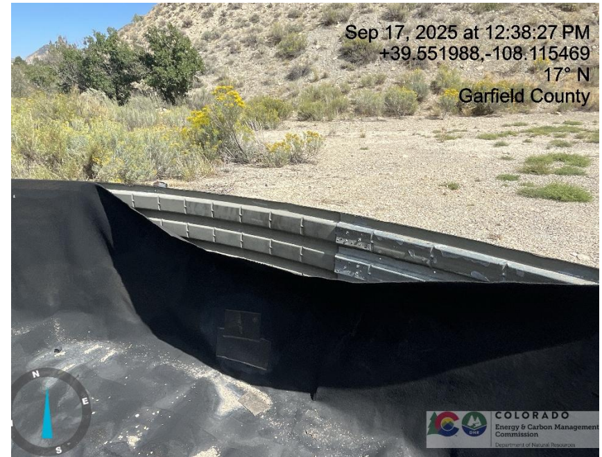
Photo # 6908 From inspection/audit 708906677 conducted on 06/06/2025 Liner in disrepair/liner needs maintenance