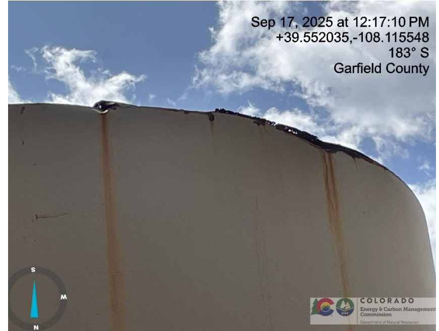
Photo # 6897 From inspection/audit 708906677 conducted on 06/06/2025 Tank failure/tank lacks integrity