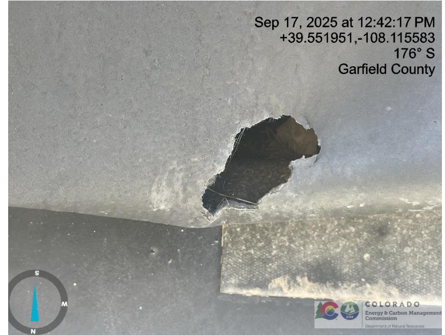
Photo # 6916 From inspection/audit 708906677 conducted on 06/06/2025 Hole in liner/liner needs maintenance