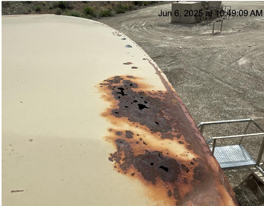
Photo # 6903 From inspection/audit 708906677 conducted on 06/06/2025 Tank failure Multiple holes in tank/tank lacks integrity