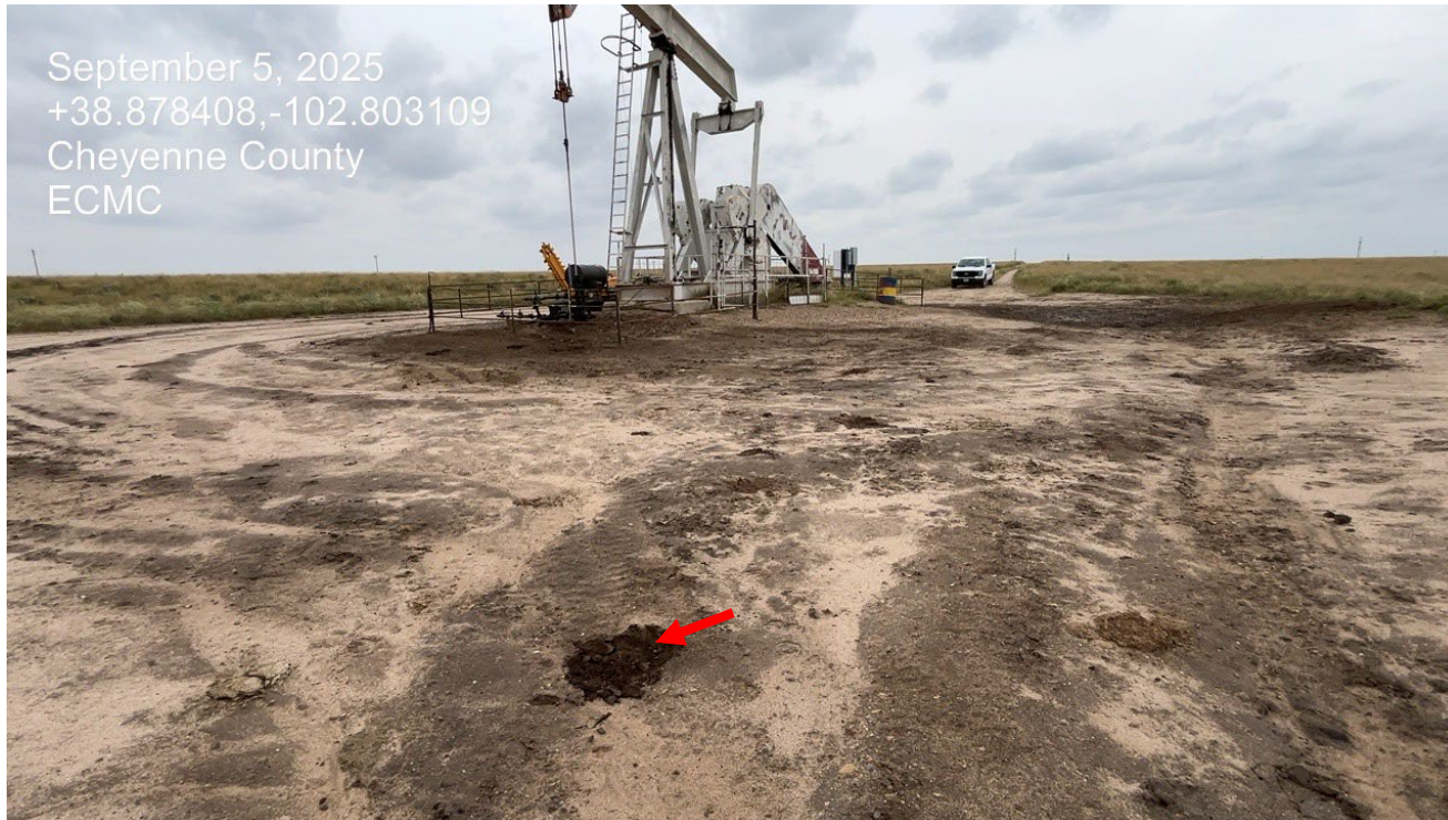
Photo 4. Facing northeast toward the wellsite. There are oil stained soils near the wellhead that have not been cleaned up since the previous inspection. The previous leak observed had flowed approximately 50 ft. to the southwest of the wellhead.