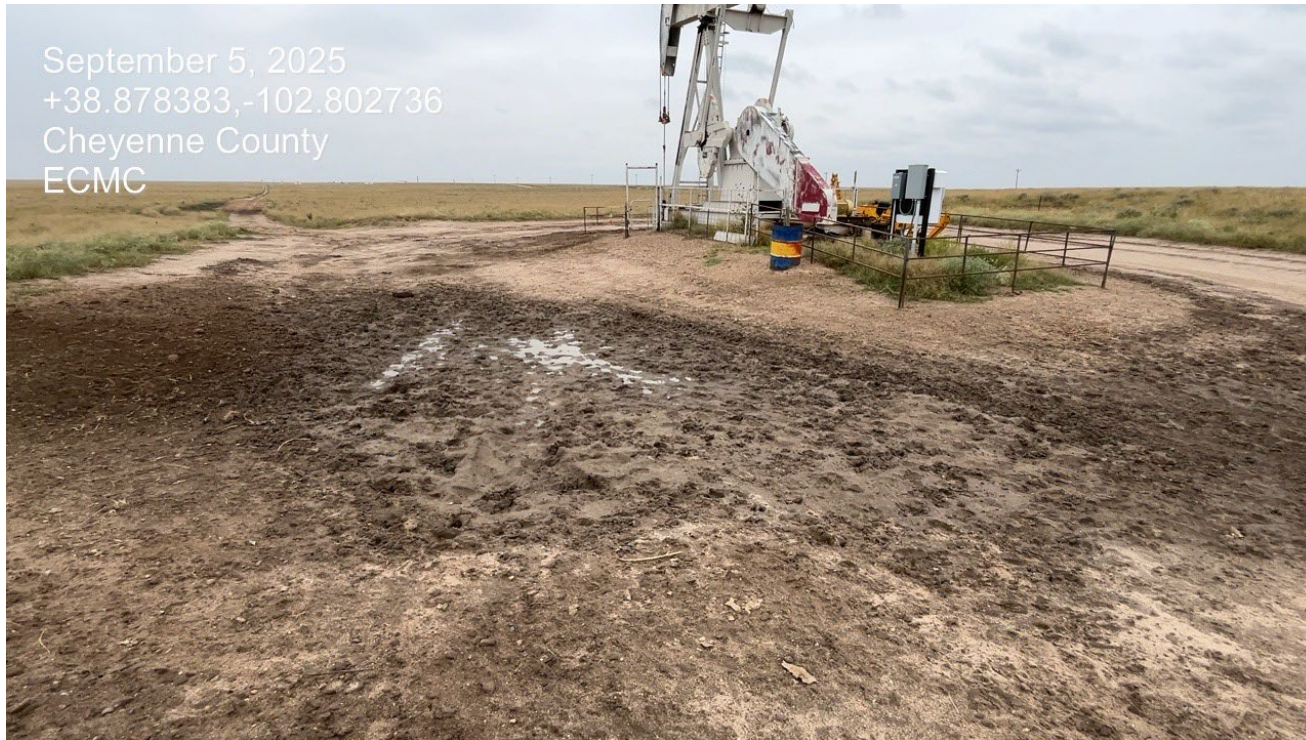
Photo 5. This area of the location collects stormwater and should be built up with road base to allow proper drainage.