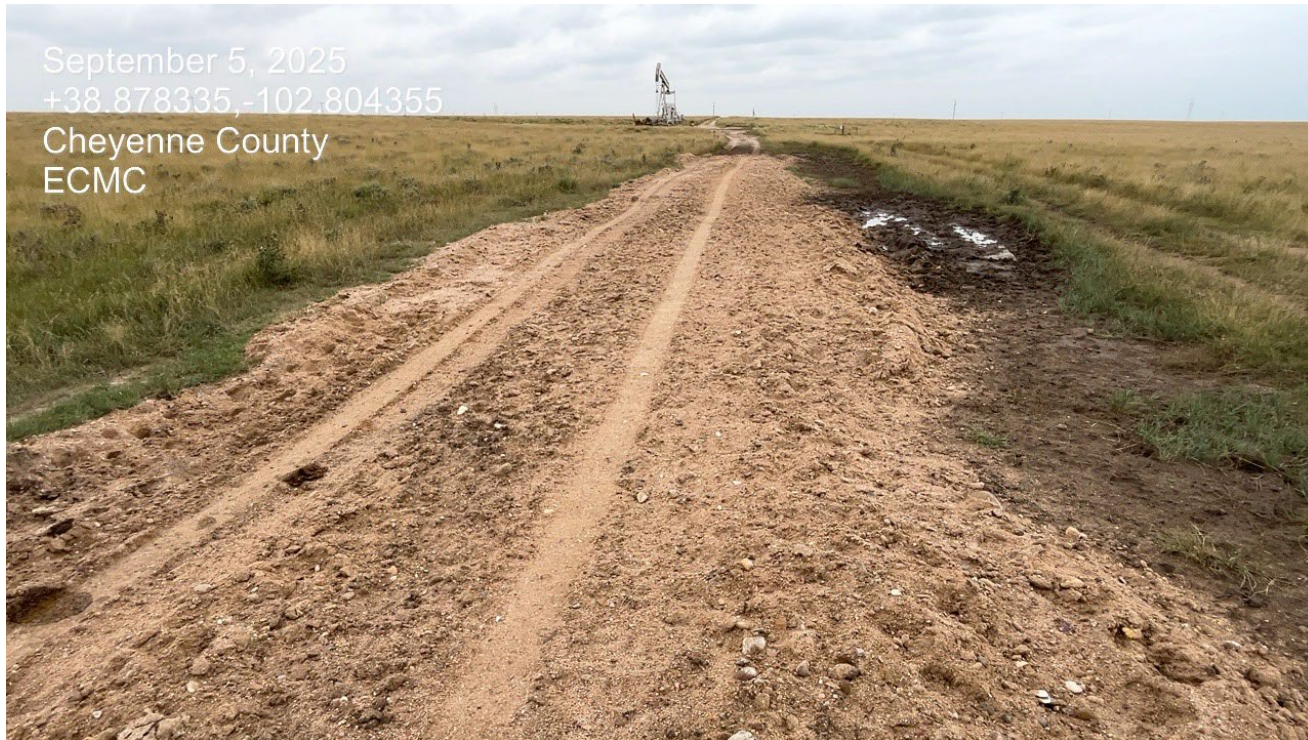
Photo 3. Facing east along the access road. There has been a load of road base sand material placed in this area but was not properly installed by crowning and compacting.