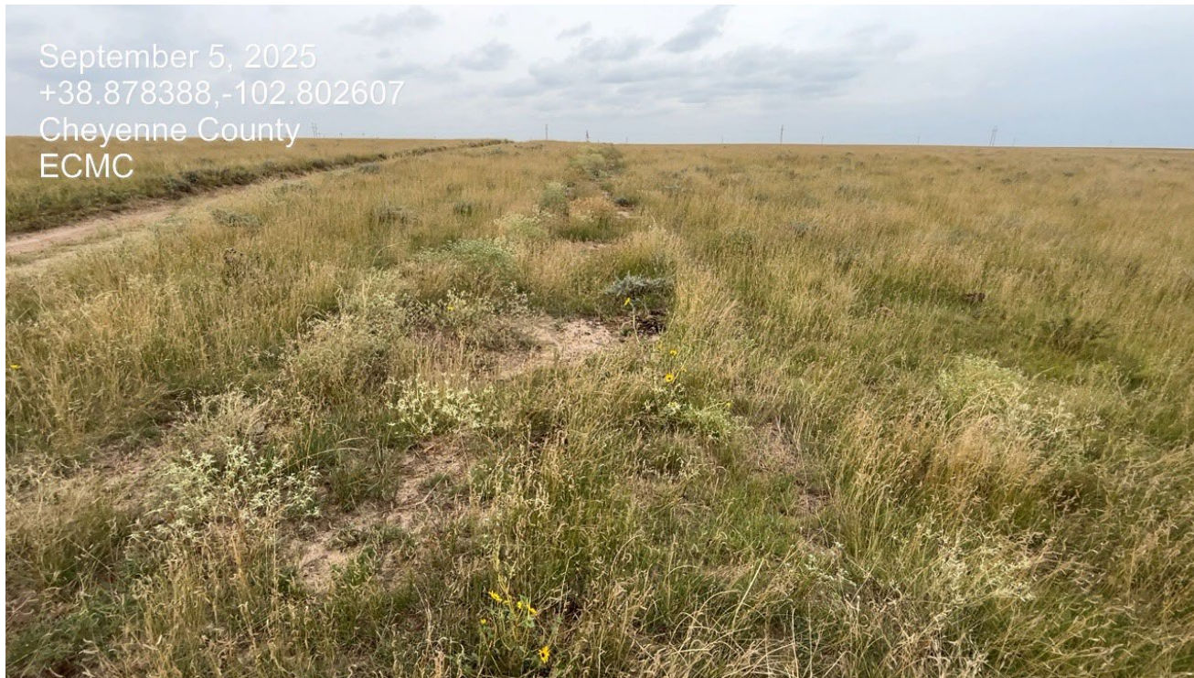
Photo 9. The disturbance along the buried electric line has mostly revegetated with the significant moisture summer season.