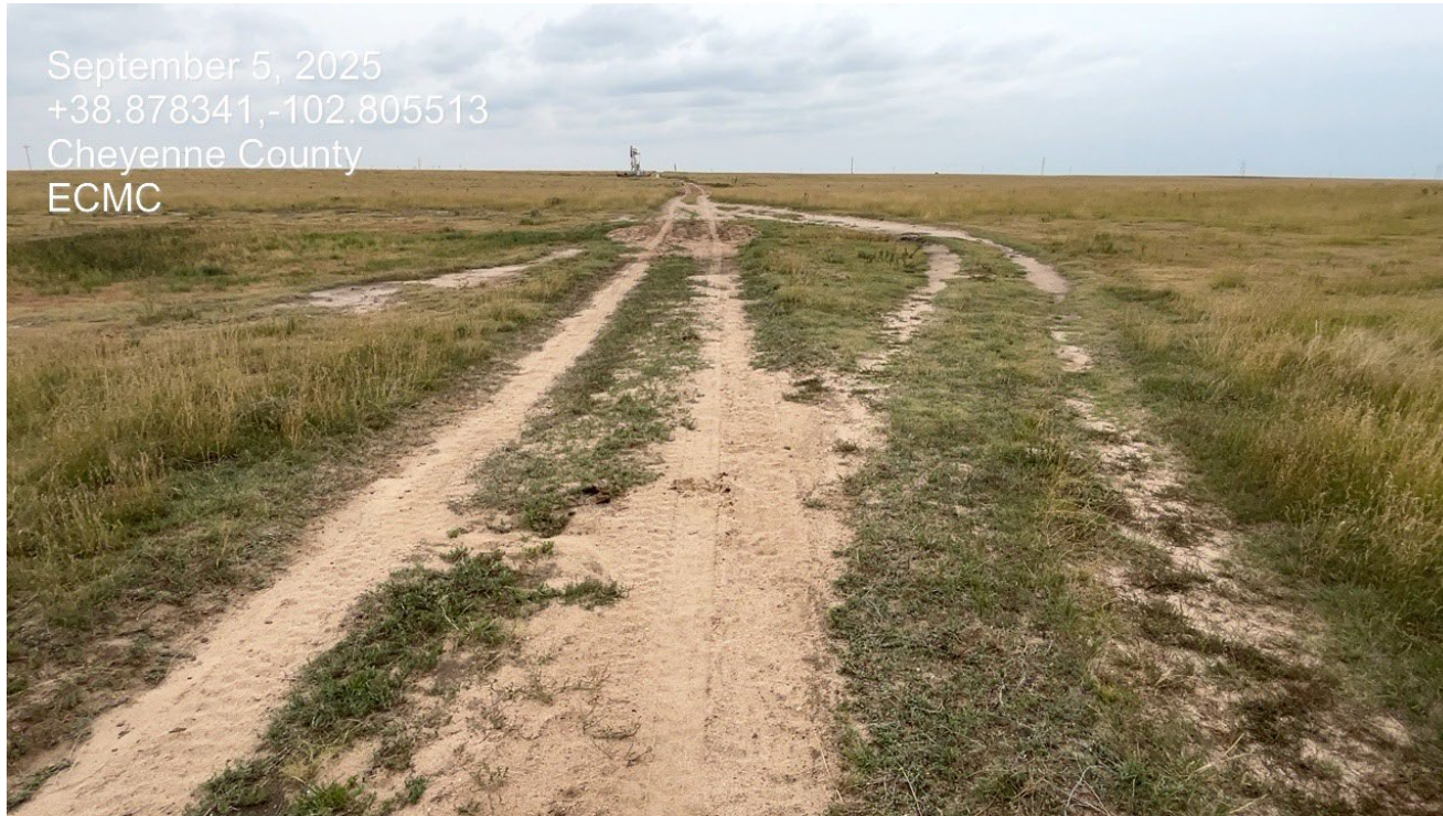
Photo 1. Facing east along the access road. There are areas where vehicles caused unnecessary disturbance driving outside of the access road due to stormwater pooling on the road.