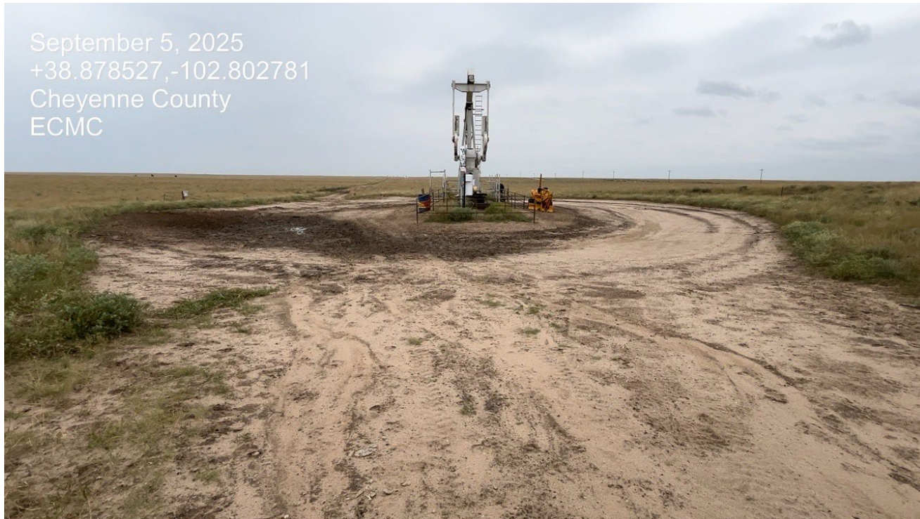
Photo 8. Facing west toward the wellsite.