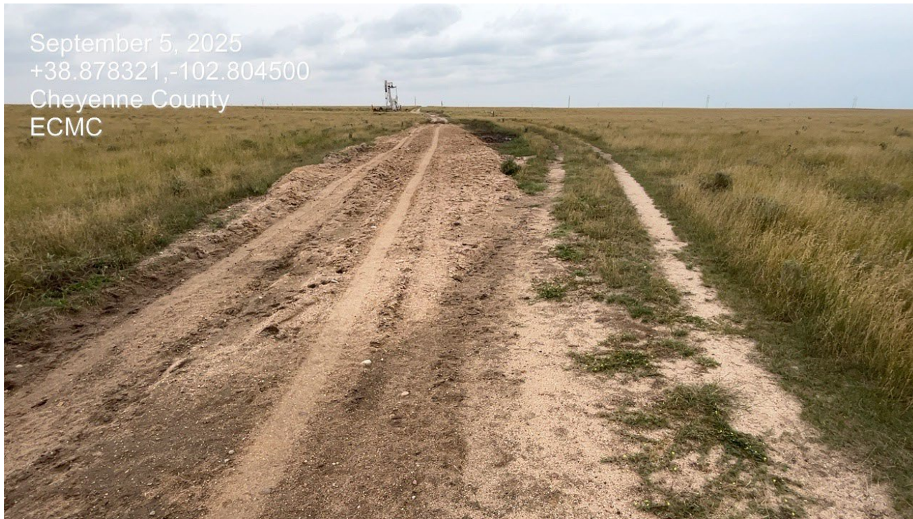
Photo 2. Facing east along the access road. There has been a load of road base sand material placed in this area but was not properly installed by crowning and compacting.