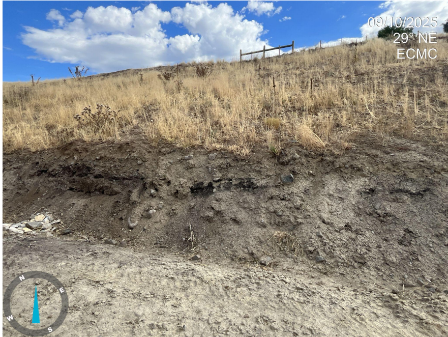
Photo 4. Photo taken of the cut slope on the northern portion of the Location, illustrating that some areas remain bare without vegetation.

Inspection Location Name: Dunca Location I