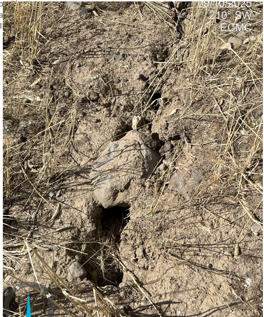
Photo 5. Photos 5-7 taken on top of the fill slope, on the eastern portion of the location, illustrating cracking along the fill slopes that are recurring.