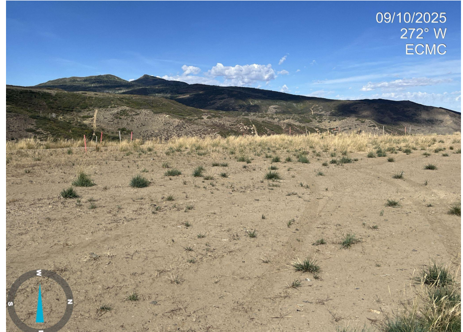
Photo 2. Photo taken from the southwestern portion of the location, facing west. Photo illustrates that the surplus material/debris was removed.