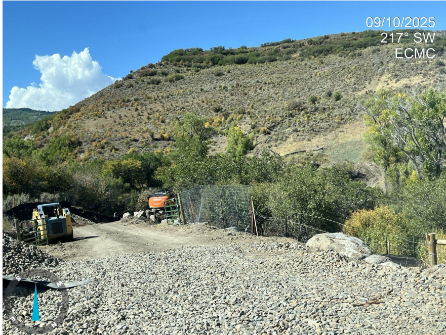
Photo 1. Photo taken from the east side of the stream crossing, facing southwest. Photo illustrates that construction of the stream crossing is still occurring at the Location.