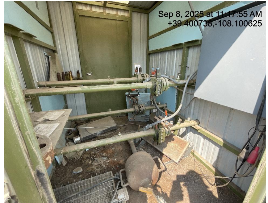
Photo # 4601 From inspection/audit 708906959 conducted on 07/24/2025 - Inside of unused meter house