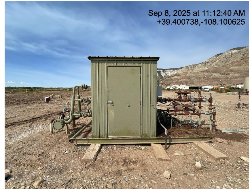
Photo # 4600 From inspection/audit 708906959 conducted on 07/24/2025 - Unused equipment