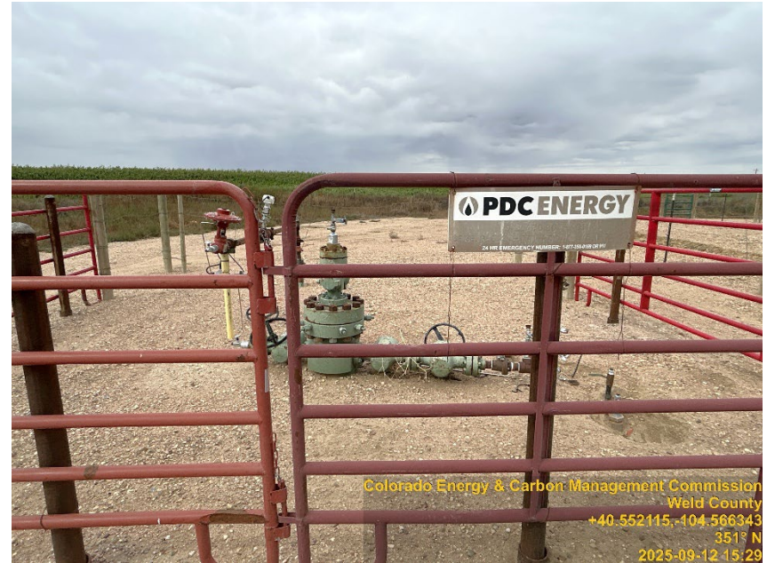
Photo #4 Dillard 20T-401 (123-36601) Wellsite Temporarily Abandoned | TA Gas lift