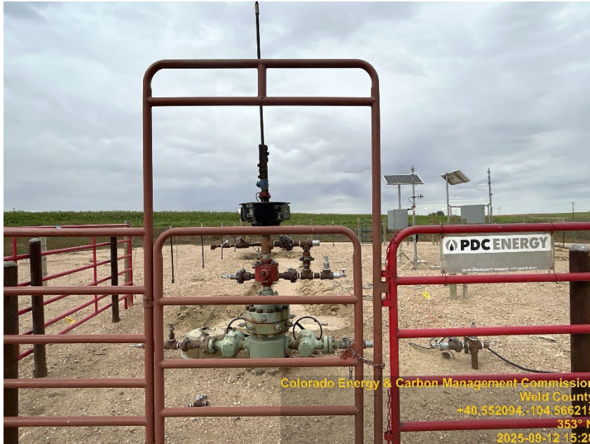
Photo #3 Dillard 20T-221 (123-36602) Wellsite Temporarily Abandoned | TA Pumpjack(s) removed