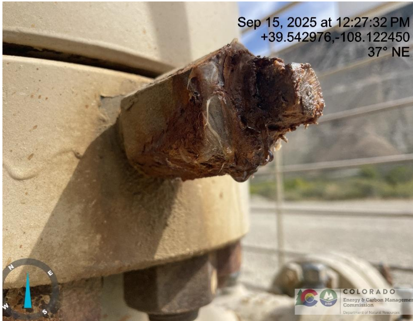
Photo # 8511 Mechanical Condition - Possible leak on tubing hanger lock pin