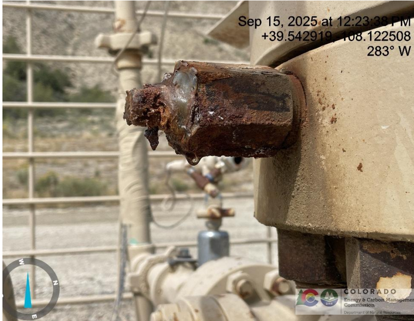
Photo # 8507 Mechanical Condition - Possible leak on tubing hanger lock pin