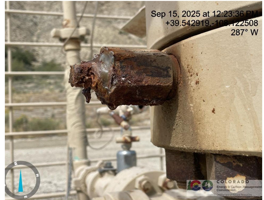
Photo # 8506 Mechanical Condition - Possible leak on tubing hanger lock pin