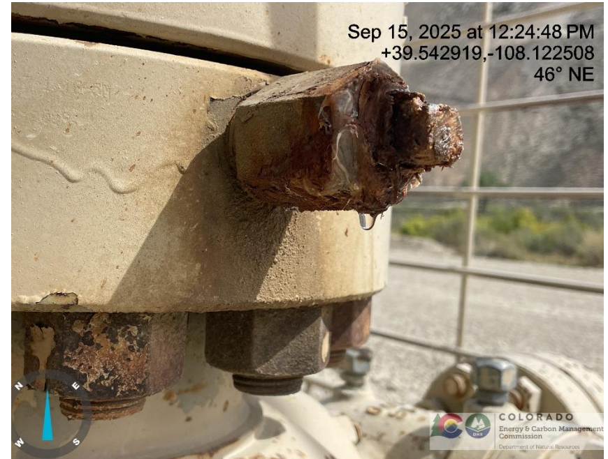
Photo # 8510 Mechanical Condition - Possible leak on tubing hanger lock pin