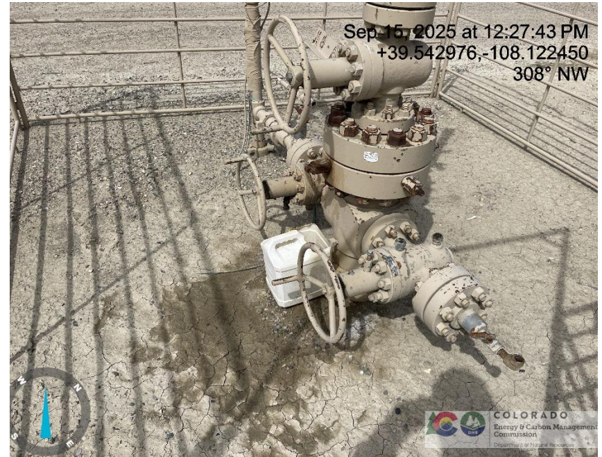
Photo # 8504 Mechanical Condition - Possible leak on tubing hanger lock pin