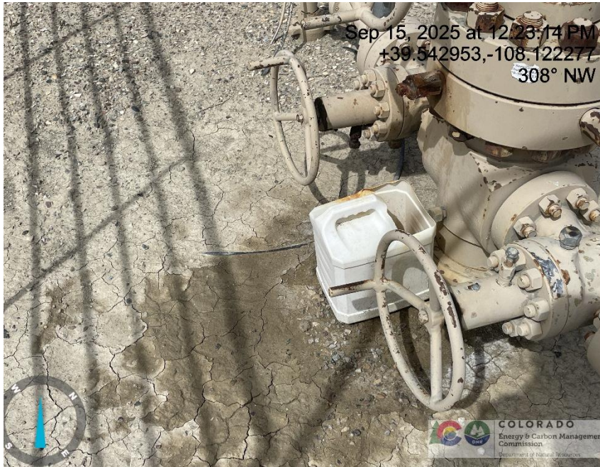
Photo # 8505 Mechanical Condition - Possible leak on tubing hanger lock pin