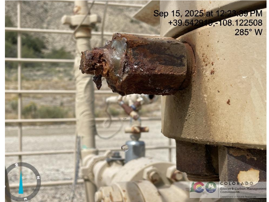
Photo # 8508 Mechanical Condition - Possible leak on tubing hanger lock pin