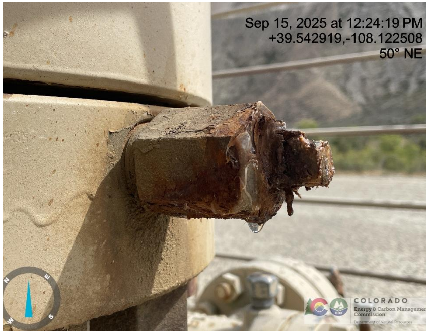
Photo # 8509 Mechanical Condition - Possible leak on tubing hanger lock pin