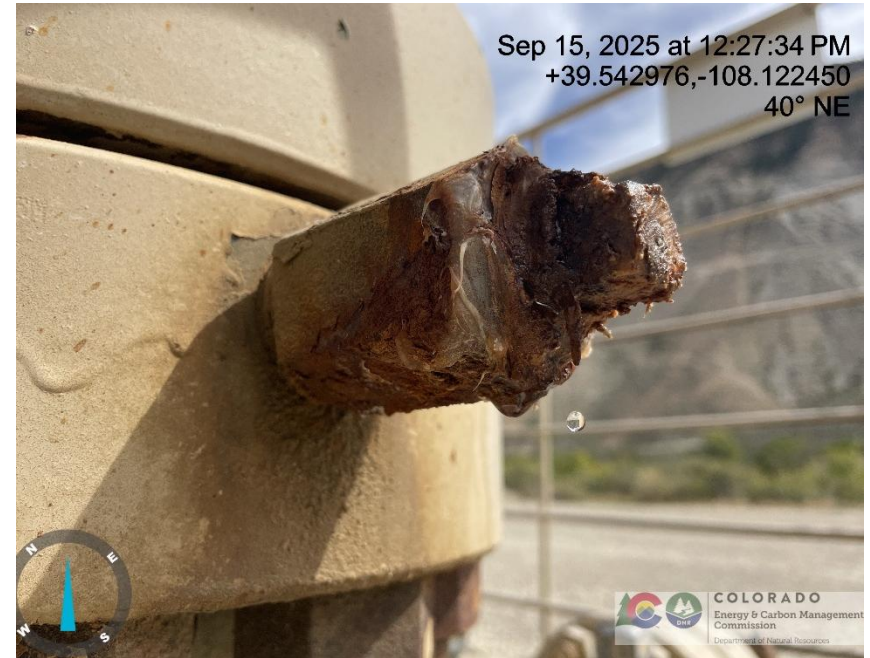
Photo # 8512 Mechanical Condition - Possible leak on tubing hanger lock pin