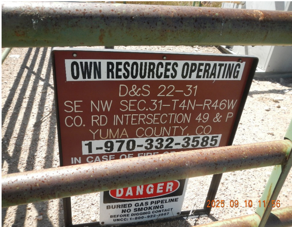
1. Lease sign at location.