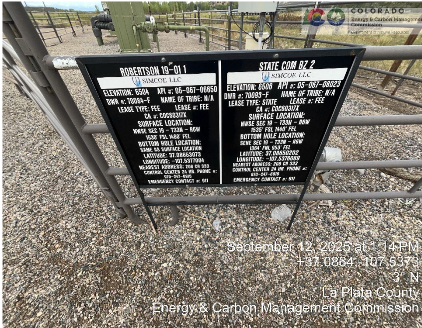
September 12, 2025 at 1:14 PM +37.0864, -107.5373 3° N La Plata County Energy & Carbon Management Commission