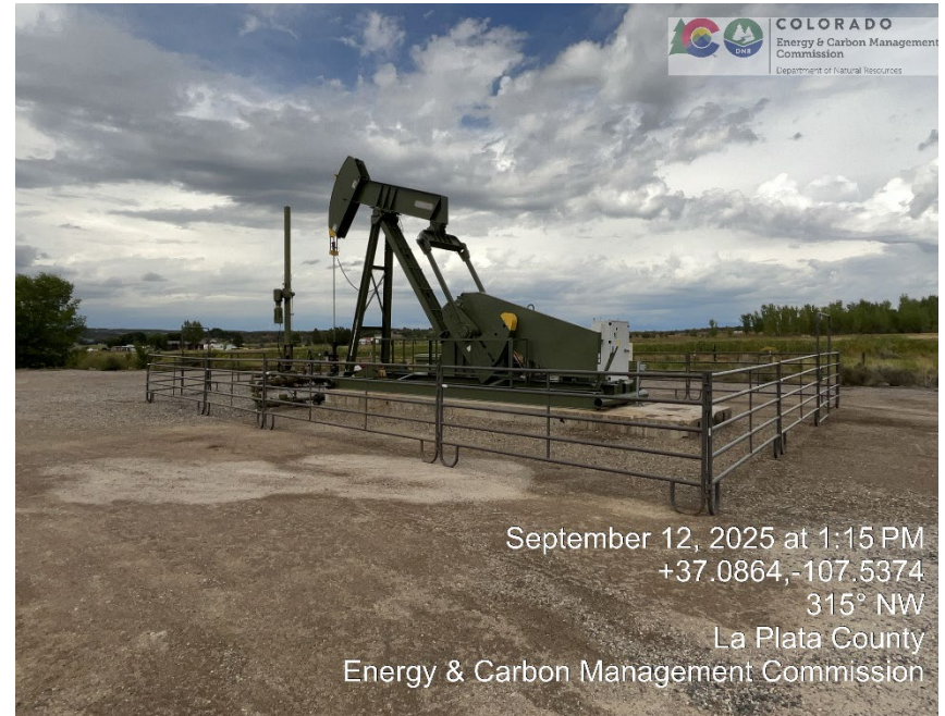
September 12, 2025 at 1:15 PM +37.0864, -107.5374 315° NW La Plata County Energy & Carbon Management Commission