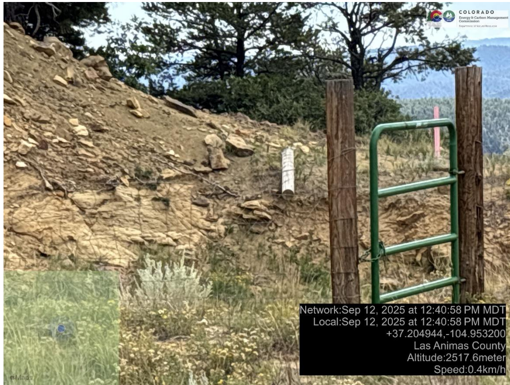
PHOTO 6: FENCE IS IN DISREPAIR ON R WELL PIT. REPAIR FENCE AROUND PIT PER RULE 1002. CA DATE 10-12-2025.