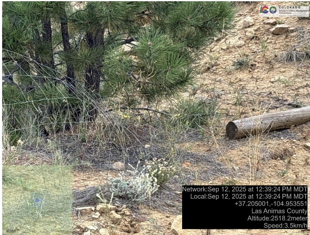
PHOTO 5: FENCE IS IN DISREPAIR ON V WELL PIT. REPAIR FENCE AROUND PIT PER RULE 1002. CA DATE 10-12-2025.