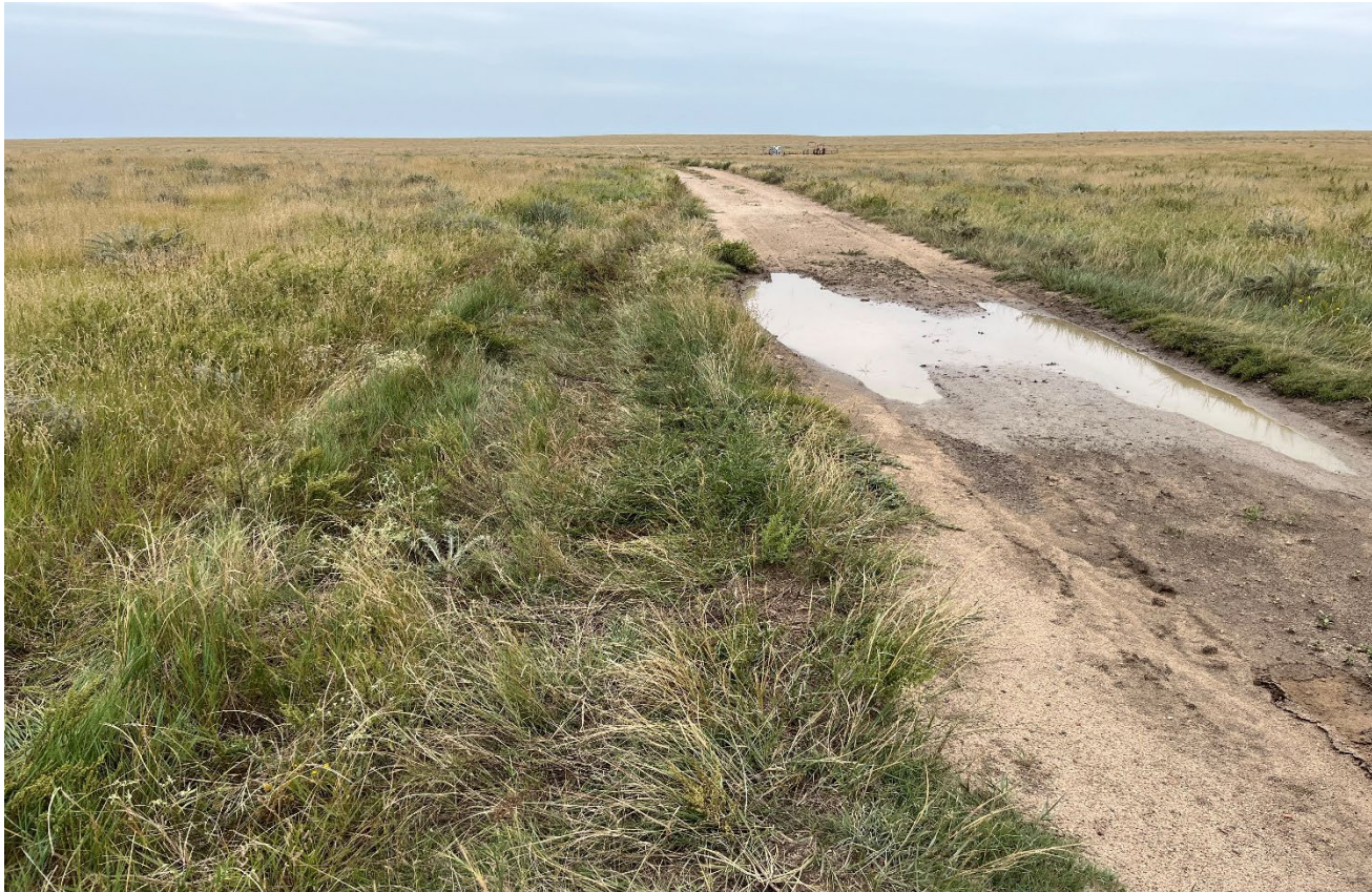
Photo 2. Facing south along the access road. Vehicles are causing unnecessary disturbance driving outside of the access road due to stormwater pooling on the road.