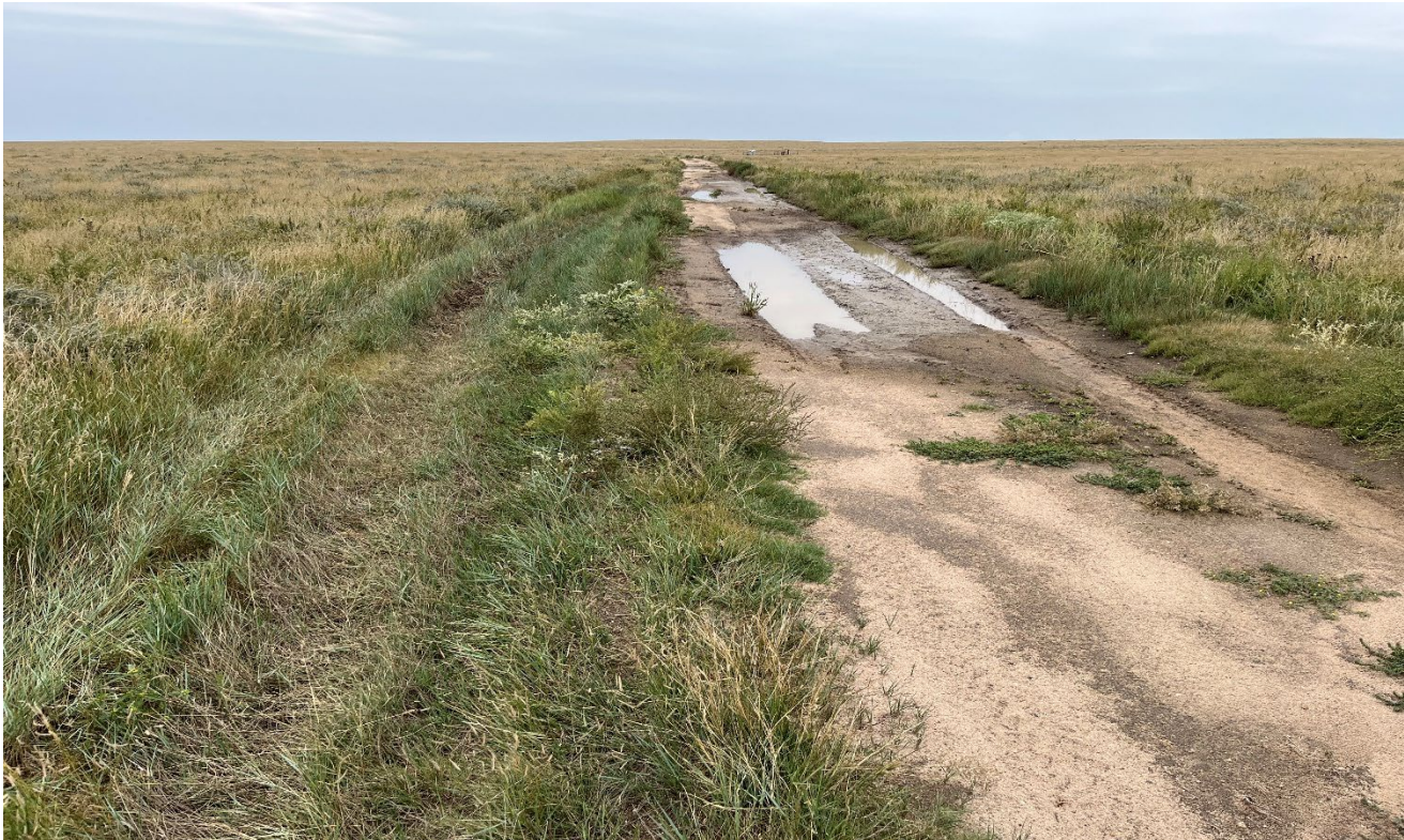
Photo 1. Facing south along the access road. Vehicles are causing unnecessary disturbance driving outside of the access road due to stormwater pooling on the road. The access road must be maintained and vehicles shall not drive outside of the access road boundary. Previous corrective action was not completed.