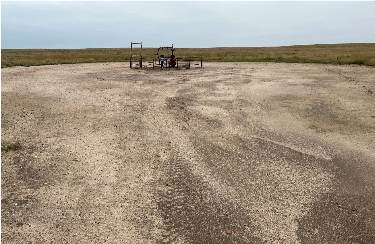
Photo 3. Facing southwest toward the wellsite.