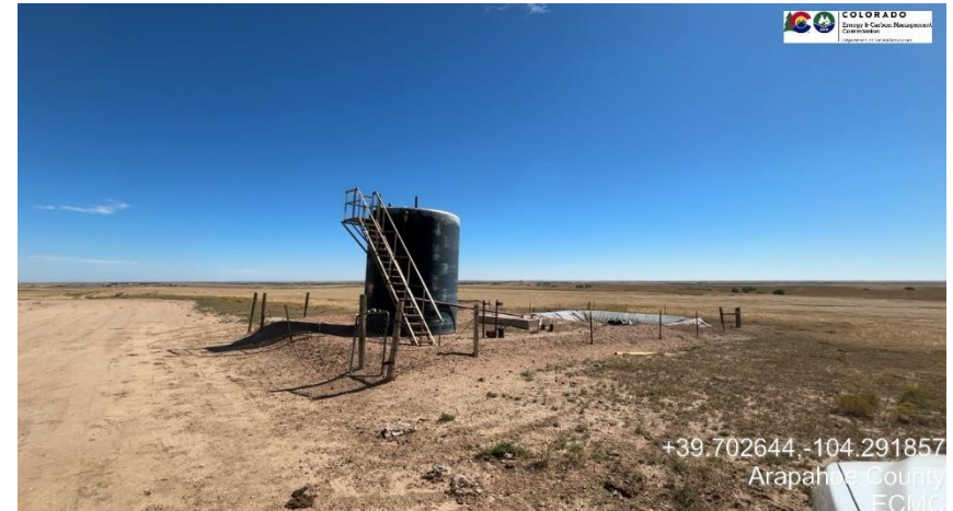
Pic 13 Open excavation