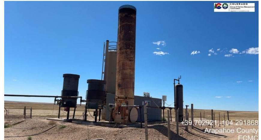
Pic 3 tanks