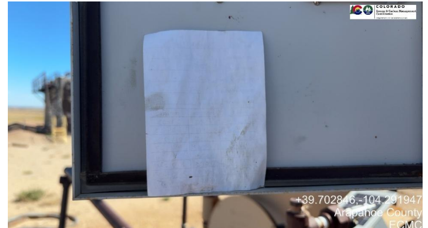
Pic 7 GMR calibration card