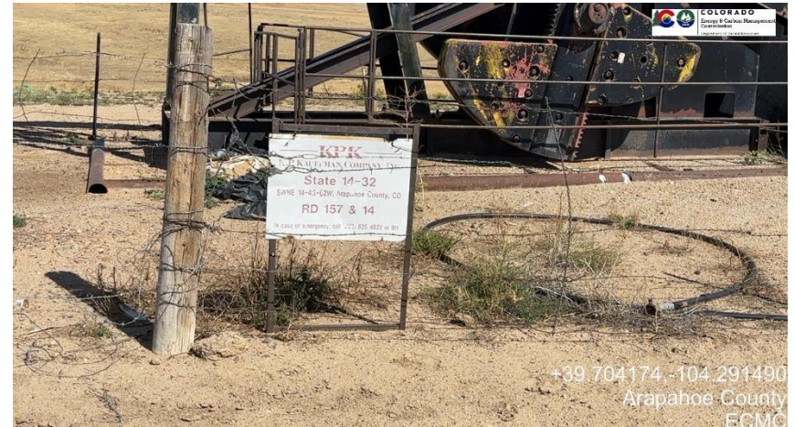
Pic 1 wellhead / pumpjack