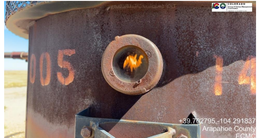
Pic 9 glass with flame inside of ECD