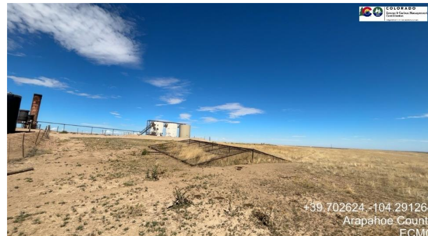
Pic 15 Pit