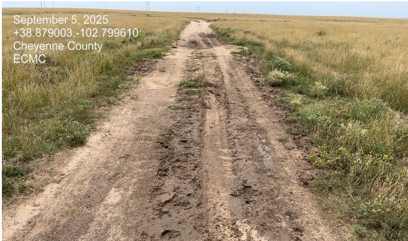
Photo 1. Facing south along the access road. It appears stormwater is still accumulating along the area of the road and there is vehicle rutting. BMP's have not been installed in this area per good engineering practice.