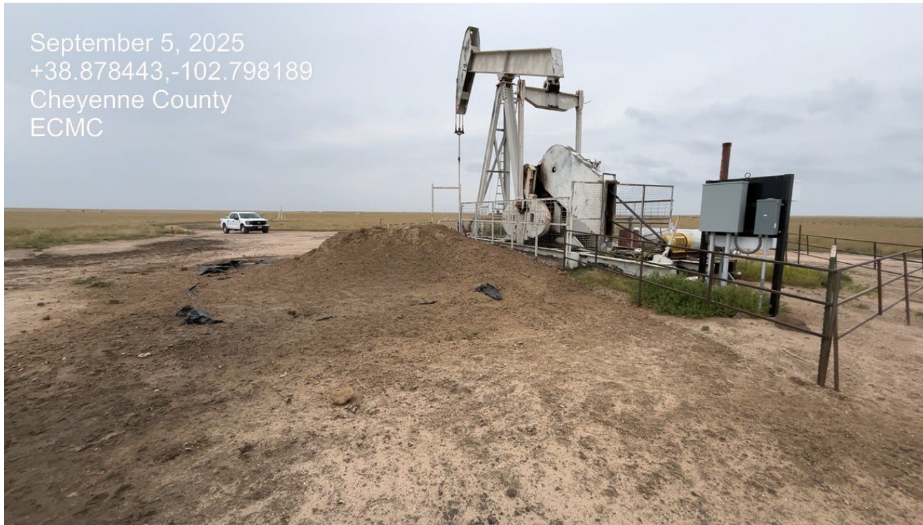
Photo 9. Facing northwest at the wellsite. The excavated material was stored on plastic liner but has no secondary containment. Much of the material fallen off the liner. The liner appears to be torn and may be compromised.