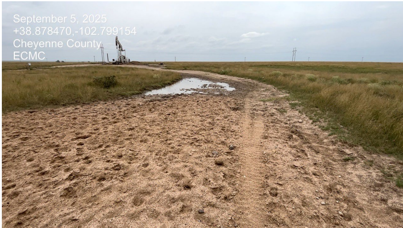
Photo 4. Facing east toward the wellsite. Stormwater is still pooling on the road causing vehicles to drive around the damaged area of the road. BMP's have not been installed to stabilize and maintain the road.