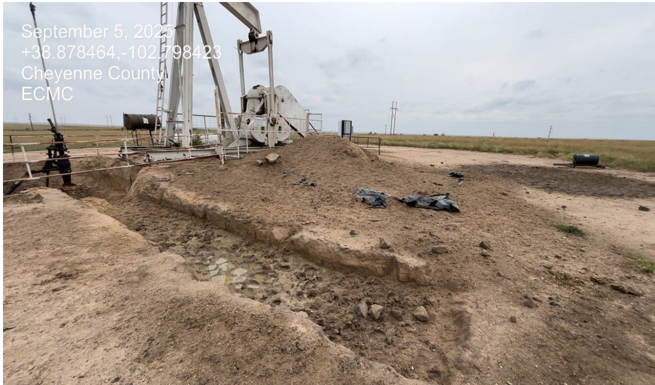
Photo 7. Facing northeast toward the excavated area where impacted material was identified.