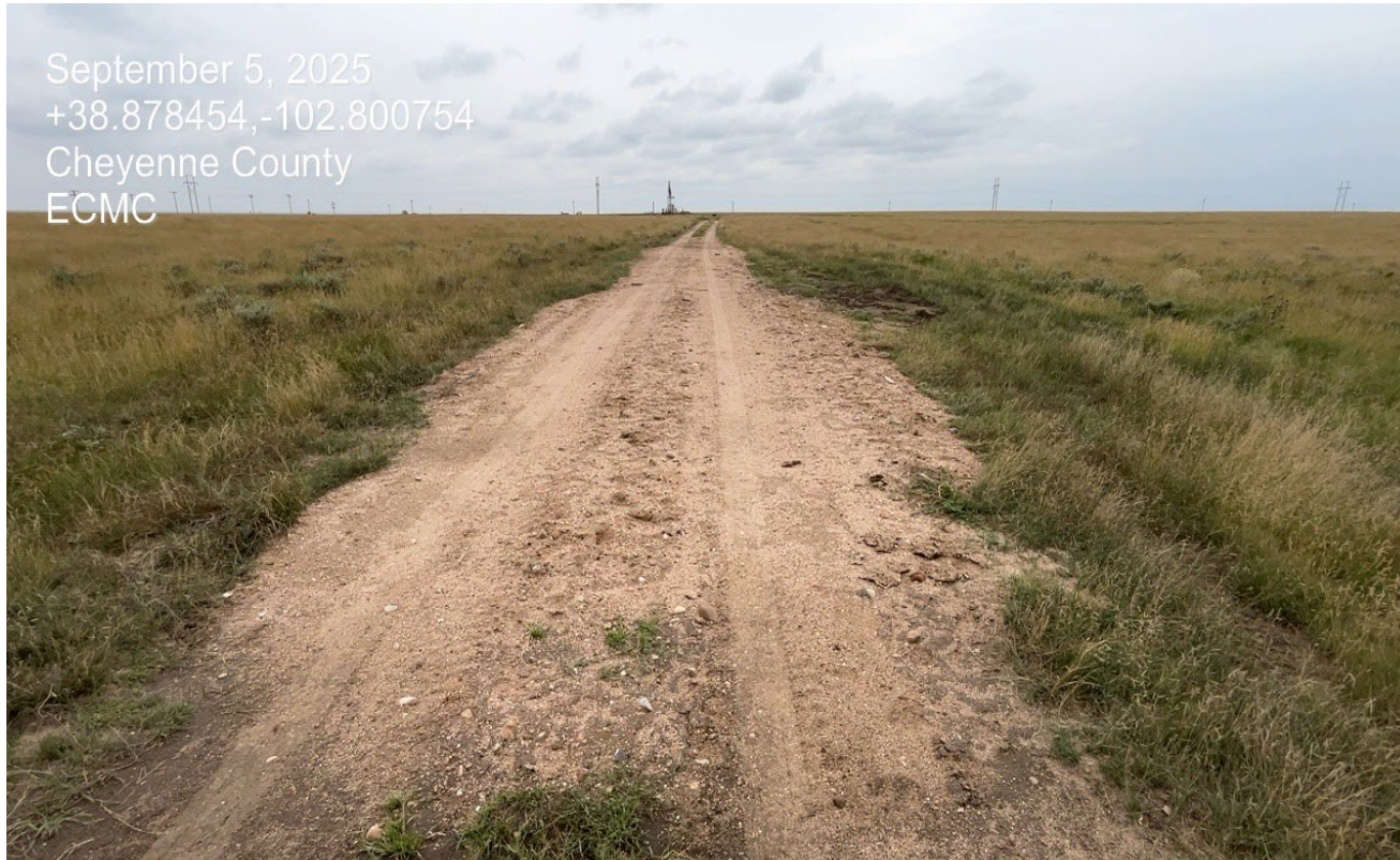
Photo 13. Facing east along the access road. There is a load of road base material but this material has not be graded and crowned.