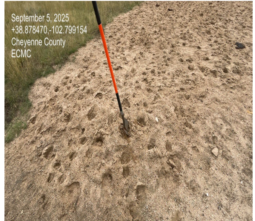
Photo 3. View of material placed on the road is not compacted. Cattle hoof marks and shove show the material is loose and susceptible to vehicle rutting and erosion.