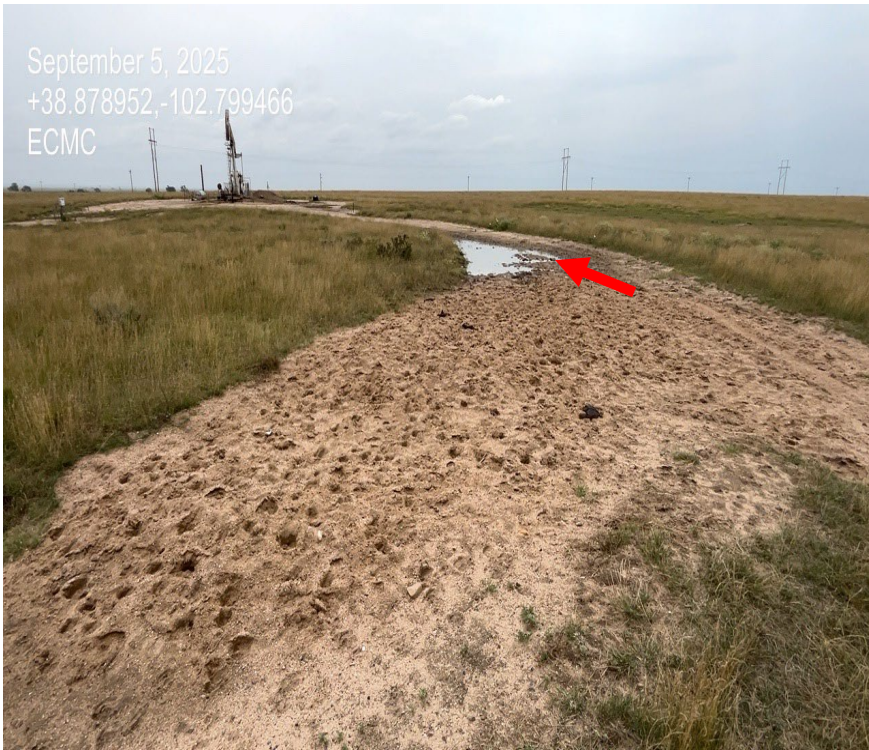
Photo 2. Facing southeast along the access road. There has been a load of road base sand material placed in this area but was not properly installed by crowning and compacting.