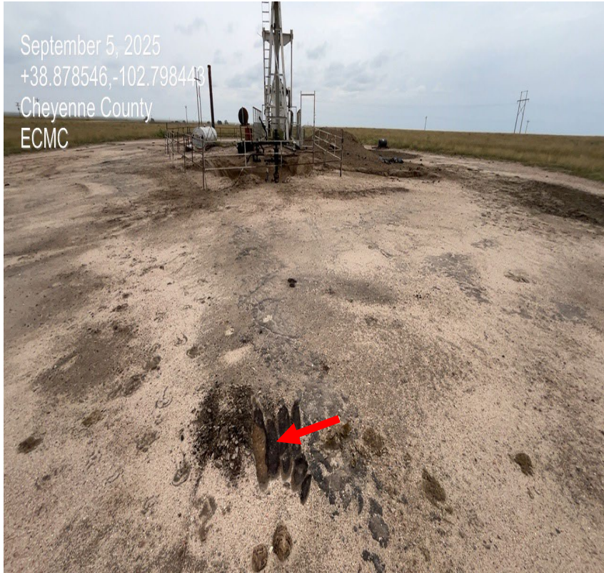
Photo 11. Facing east at the wellsite. There is black hardened hydrocarbon material shown at red arrow.