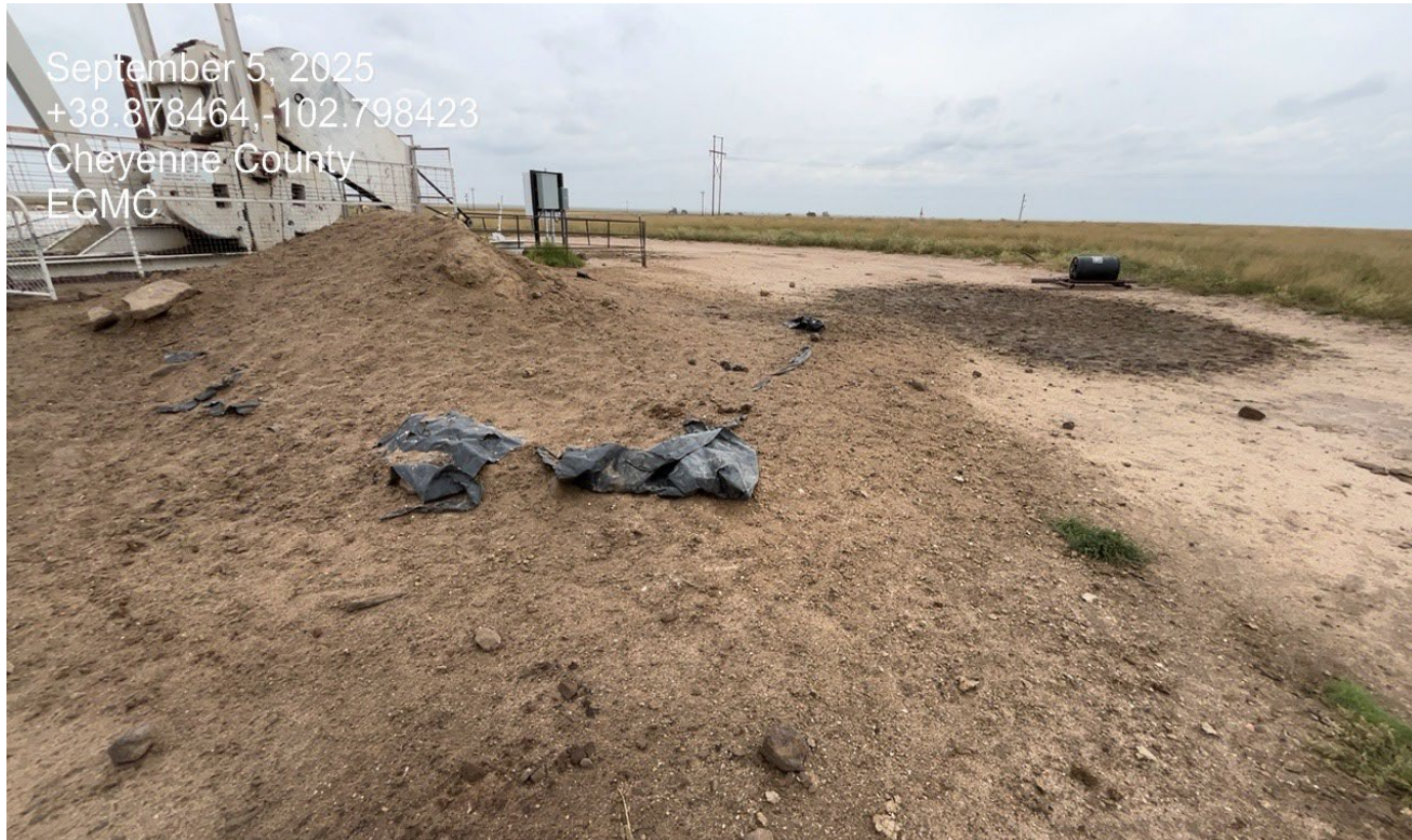
Photo 8. The excavated material was stored on plastic liner but has no secondary containment. Much of the material fallen off the liner. The liner appears to be torn and may be compromised.