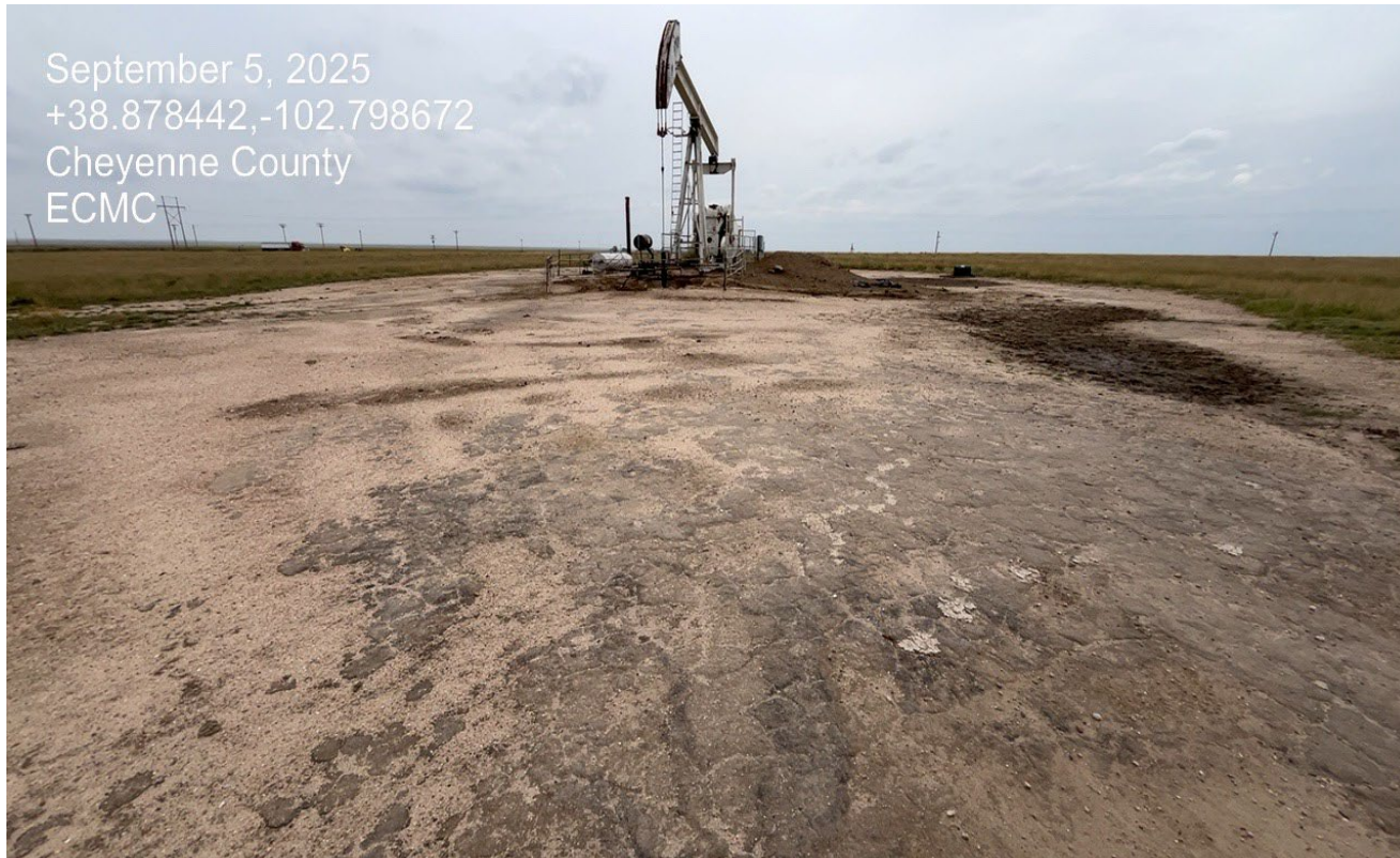
Photo 5. Facing east toward the wellsite.