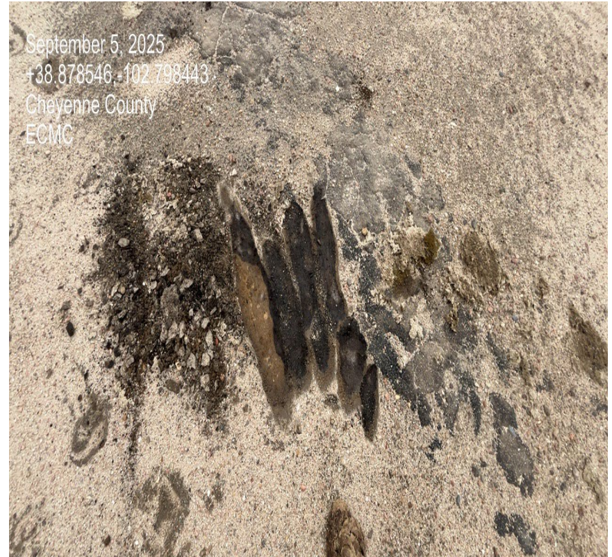
Photo 12. Closer view of the stained black material which appears to be impacted soils.