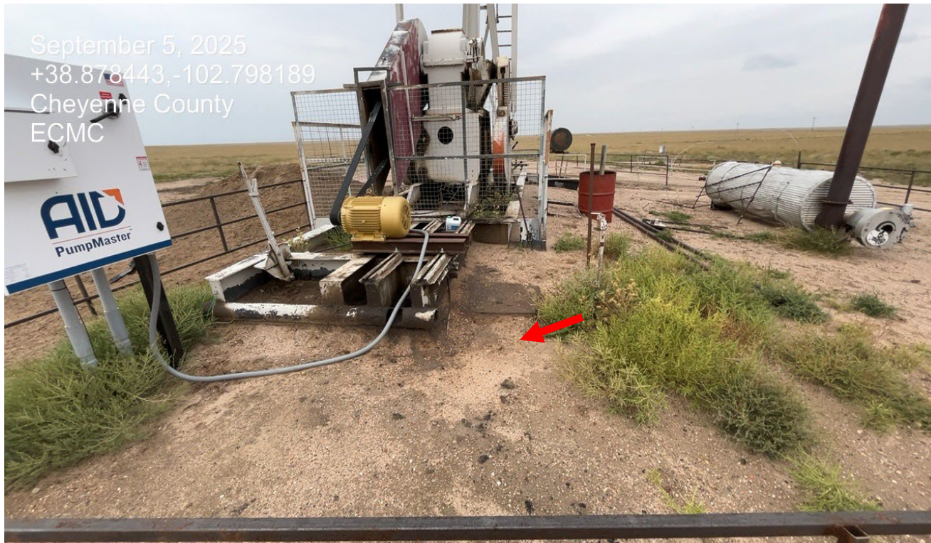
Photo 10. There is oil staining at the base of the pump jack that has not been cleaned up.