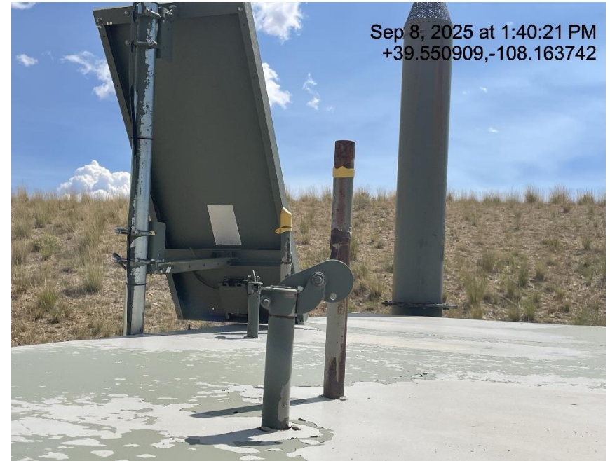
Photo # 6639 PRV vent line does not comply with CECMC pressure safety device rules