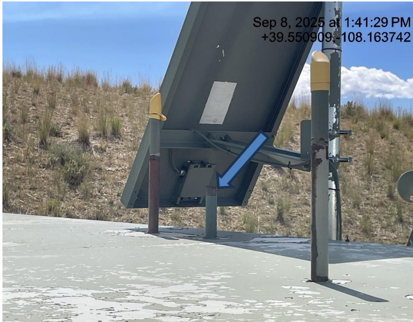
Photo # 6640 Rupture disc vent line does not comply with CECMC pressure safety device rules