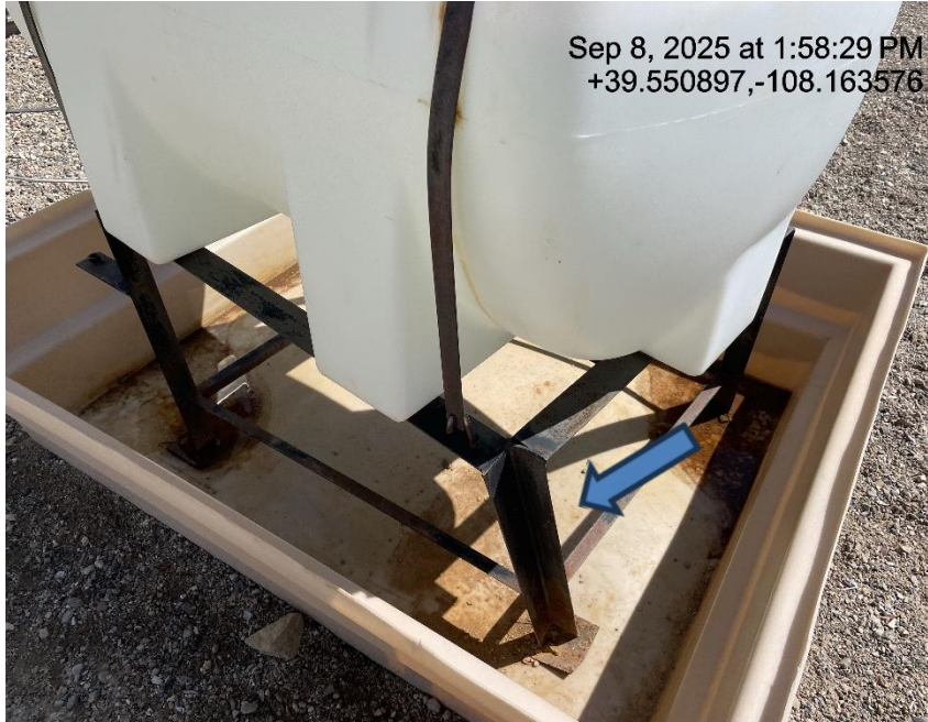
Photo # 6662 Leg on metal stand for chemical tank appears to be starting to buckle