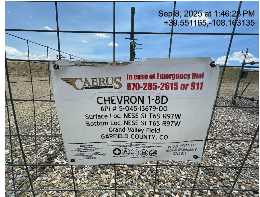
Photo # 6654 Sign at start of spur road to location has previous operators name