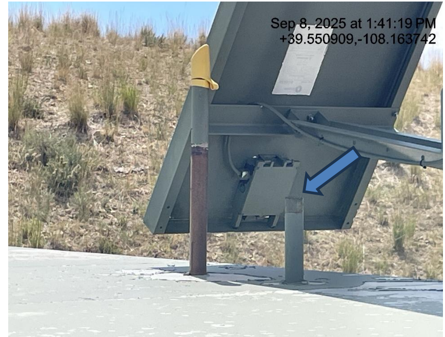
Photo # 6641 Rupture disc vent line does not comply with CECMC pressure safety device rules