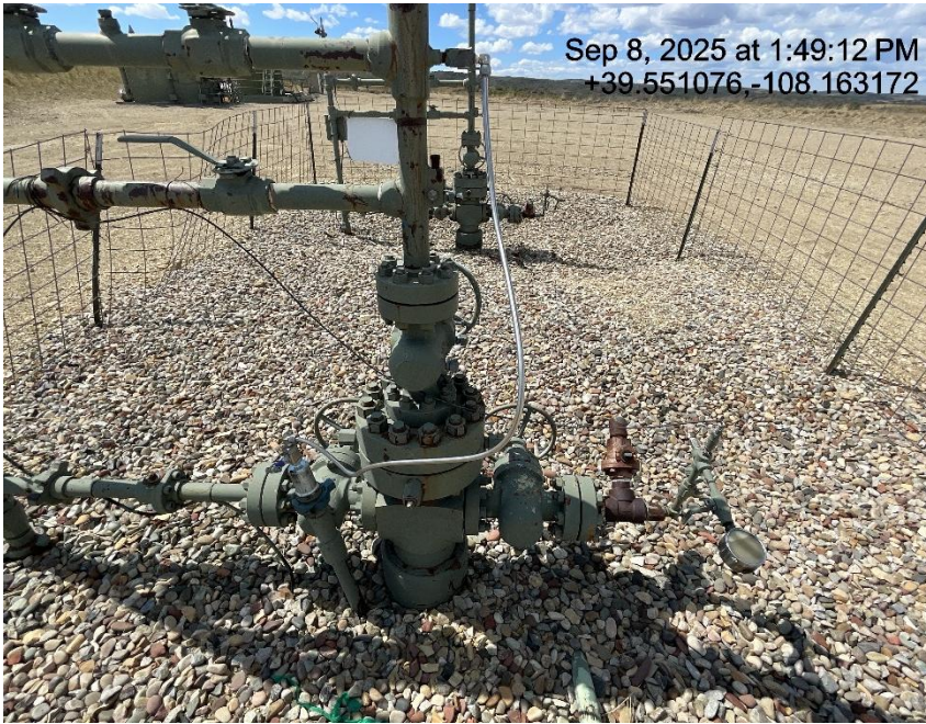
Photo # 6648 CHEVRON 275-1 BH line tied into flowline/no FORM 4 SUNDRY & no check valve