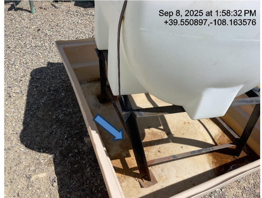
Photo # 6663 Leg on metal stand for chemical tank appears to be starting to buckle