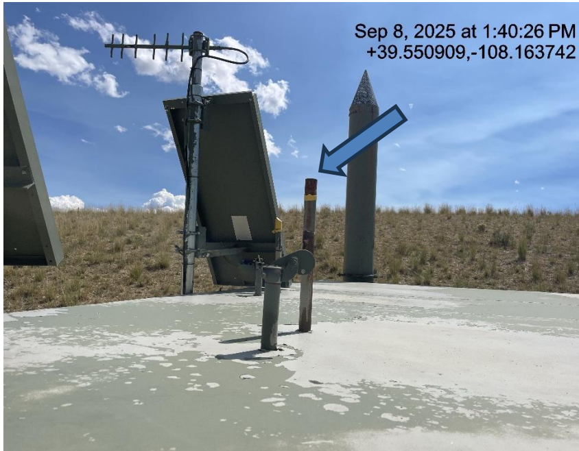
Photo # 6638 PRV vent line does not comply with CECMC pressure safety device rules