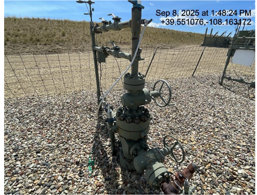
Photo # 6646 CHEVRON 275-1 BH line tied into flowline/no FORM 4 SUNDRY & no check valve