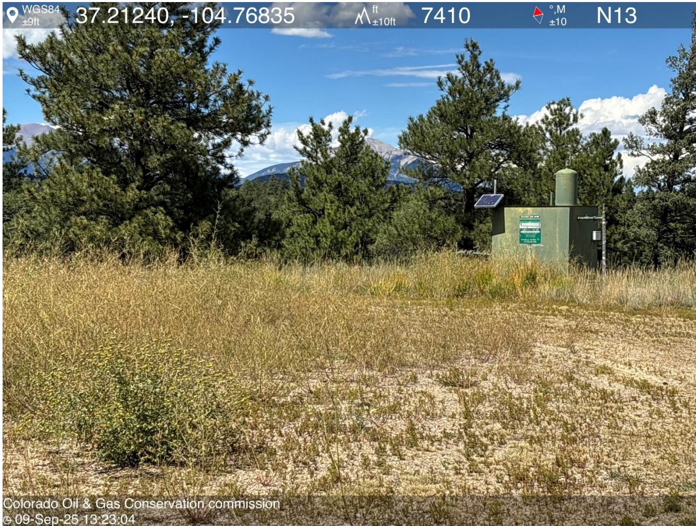
PHOTO 4: WEEDS/VEGETATION NOT MAINTAINED IN AROUND LOCATION AND METER HOUSE. MAINTAIN WEED/VEGETATION PER RULE 606. CA DATE 10/9/2025.