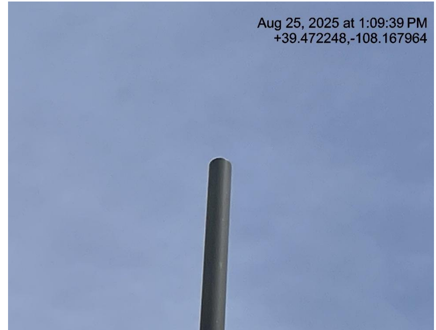
Photo # 3867 PRV vent line does not comply with CECMC pressure safety device rules