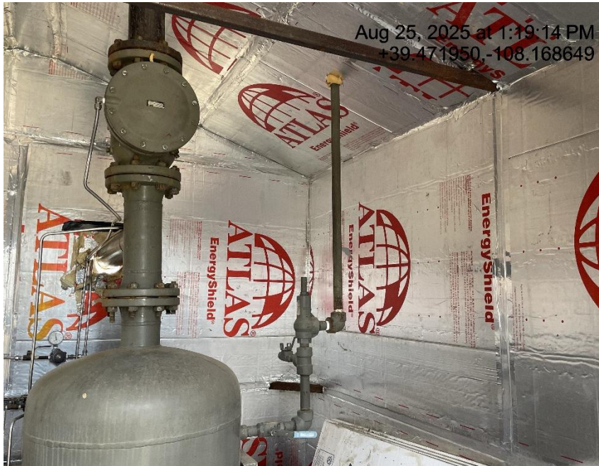
Photo # 3862 PRV vent line does not comply with CECMC pressure safety device rules