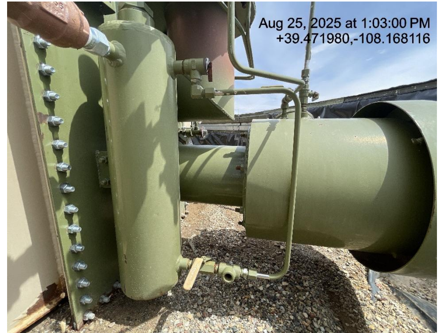
Photo # 3869 PRV vent line does not comply with CECMC pressure safety device rules