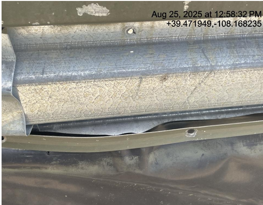
Photo # 3848 Secondary containment liner damaged/needs maintenance