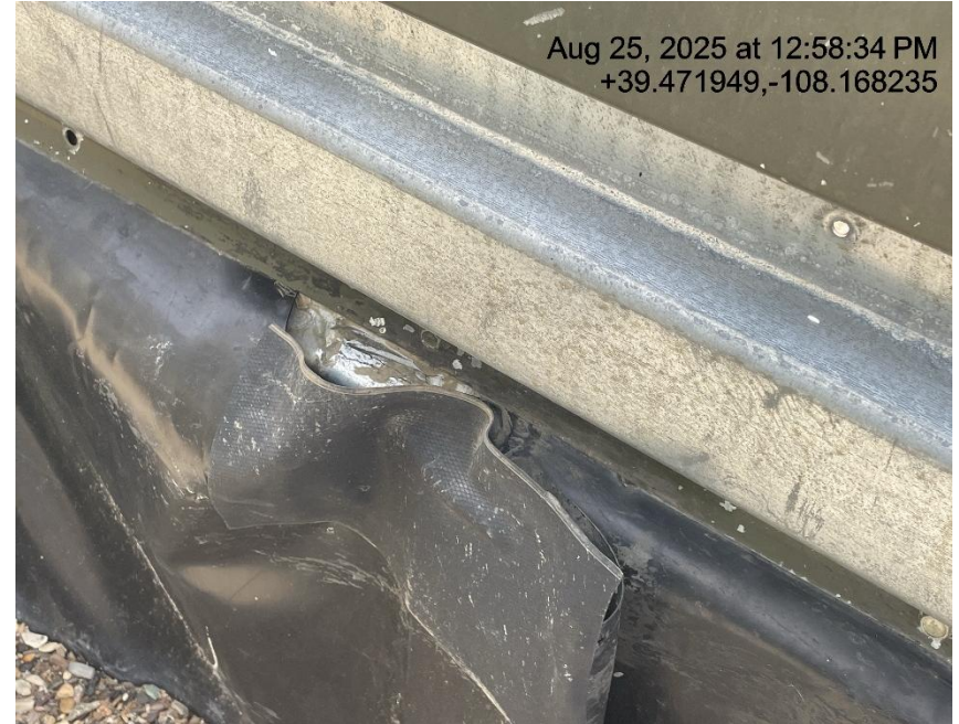
Photo # 3847 Secondary containment liner damaged/needs maintenance