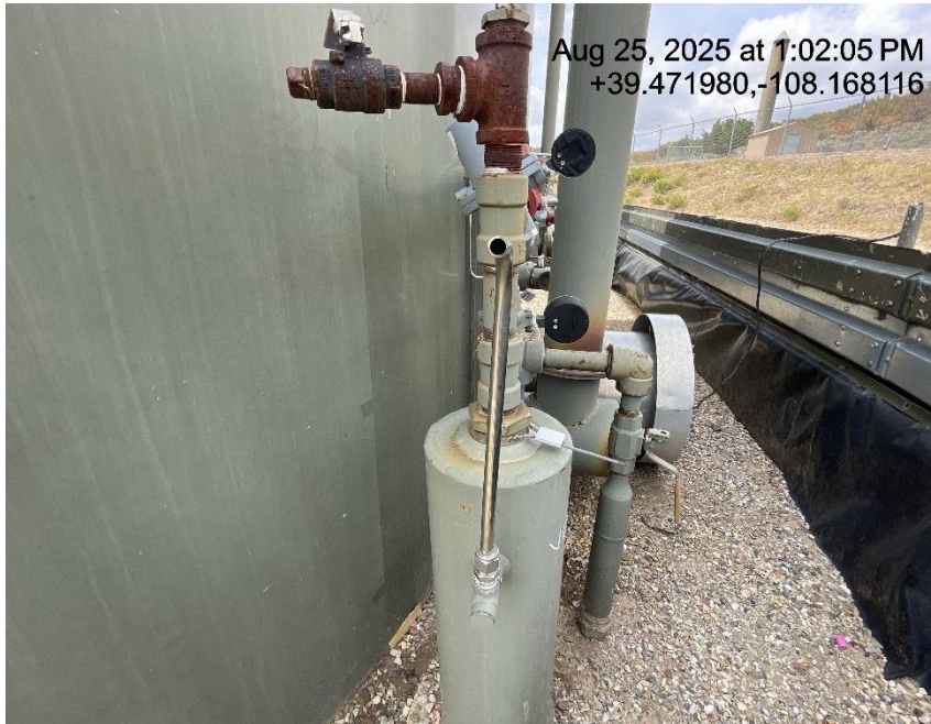
Photo # 3868 PRV vent line does not comply with CECMC pressure safety device rules