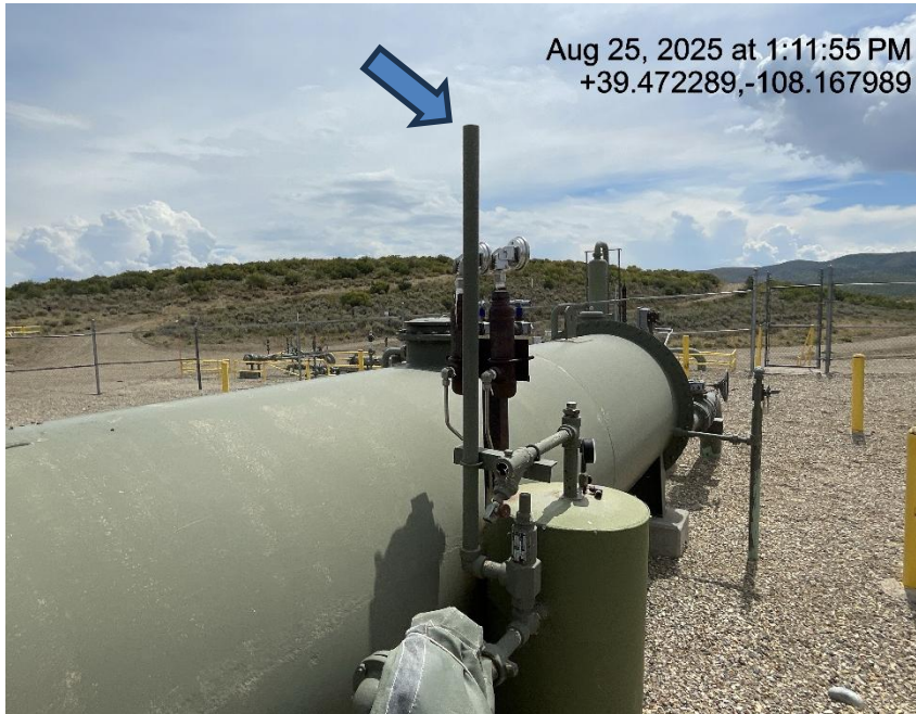
Photo # 3864 PRV vent line does not comply with CECMC pressure safety device rules