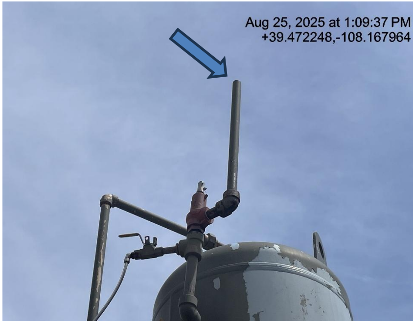
Photo # 3866 PRV vent line does not comply with CECMC pressure safety device rules