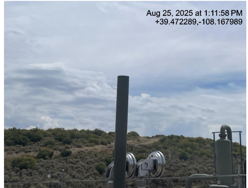
Photo # 3865 PRV vent line does not comply with CECMC pressure safety device rules