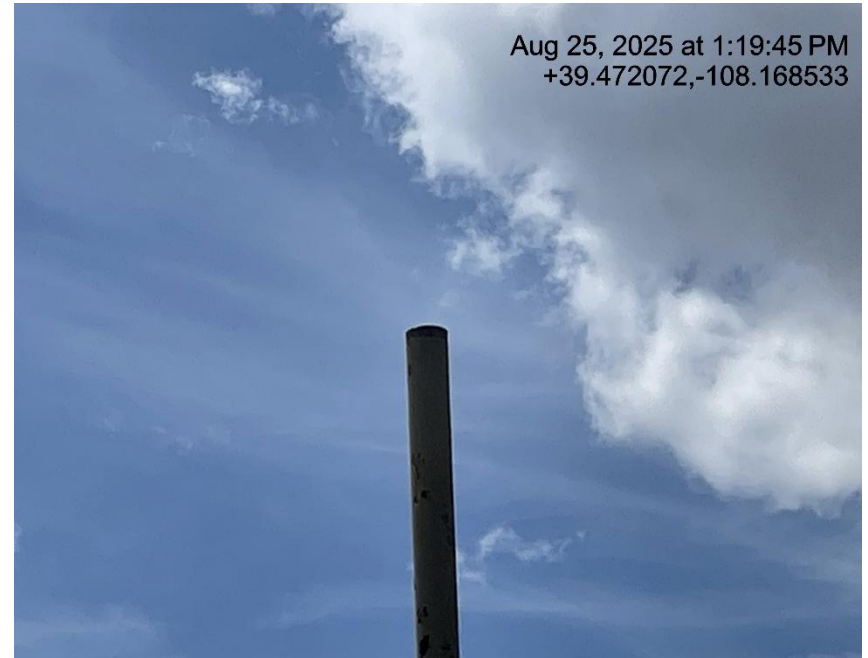
Photo # 3863 PRV vent line does not comply with CECMC pressure safety device rules