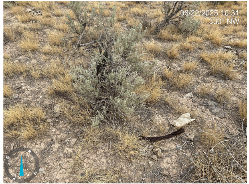
Photo 6: Photos show an example of trash and debris at the location. Damaged wattles, t-posts, steel cables and barbed wire appears to be present throughout the location. Comply with Rule 606.d.