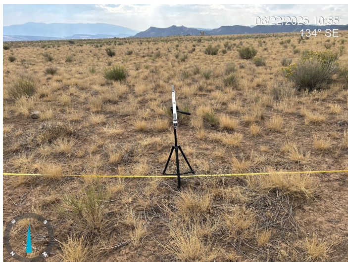
Photo 4: Photos show the middle of the reference area transect (top left), looking southeast (bottom left) and looking northwest (top right).