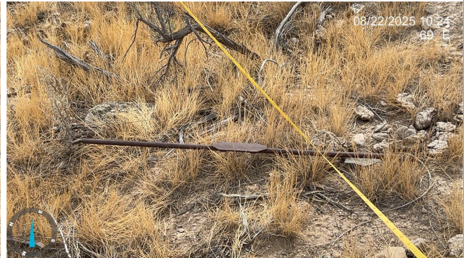
Photo 5: Photos show an example of trash and debris at the location. Damaged wattles, t-posts, steel cables and barbed wire appears to be present throughout the location. Comply with Rule 606.d.