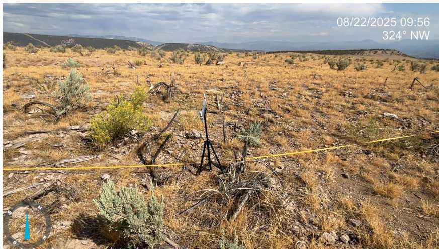
Photo 2: Photos show the middle of the disturbed area transect (top left), looking northwest (bottom left) and looking southeast (top right).