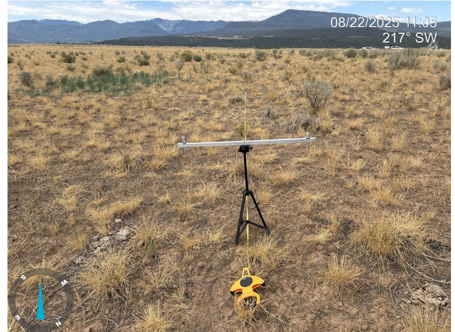
Photo 3: Photos show the beginning and end of the reference area vegetation transect, respectively.