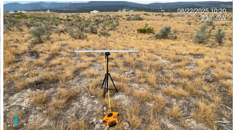
Photo 1: Photos show the beginning and end of the disturbed area vegetation transect, respectively.