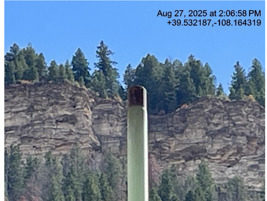
Photo # 4477 PRV vent line on fluid knockout for thermogen does not comply with CECMC pressure safety device rules