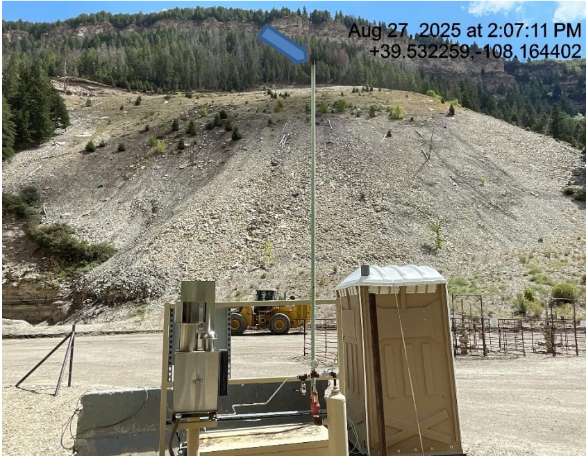
Photo # 4476 PRV vent line on fluid knockout for thermogen does not comply with CECMC pressure safety device rules