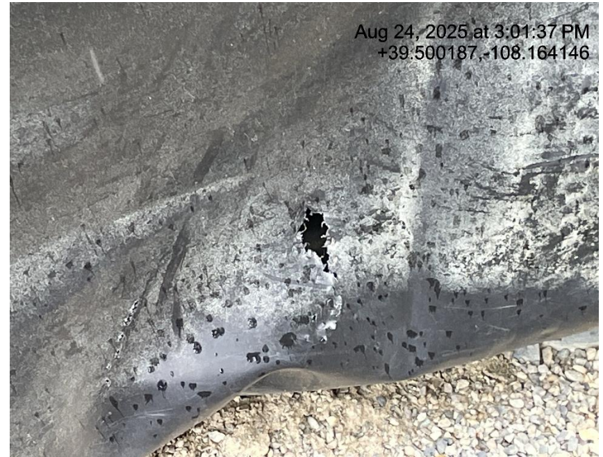
Photo # 3385 Hole in secondary containment liner/liner needs maintenance