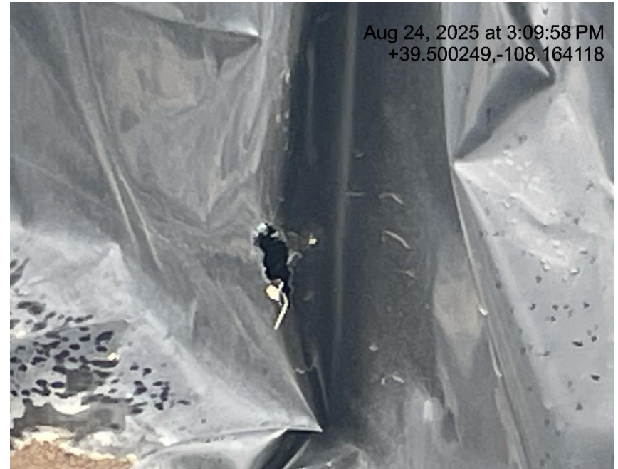
Photo # 3389 Hole in secondary containment liner/liner needs maintenance