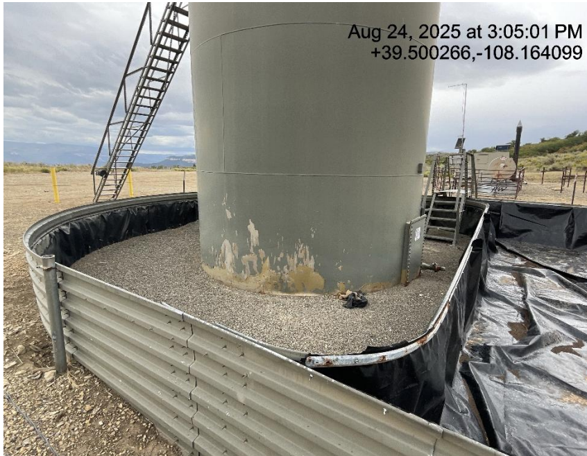
Photo # 3390 Secondary containment inadequately sized /not in compliance with CECMC rules