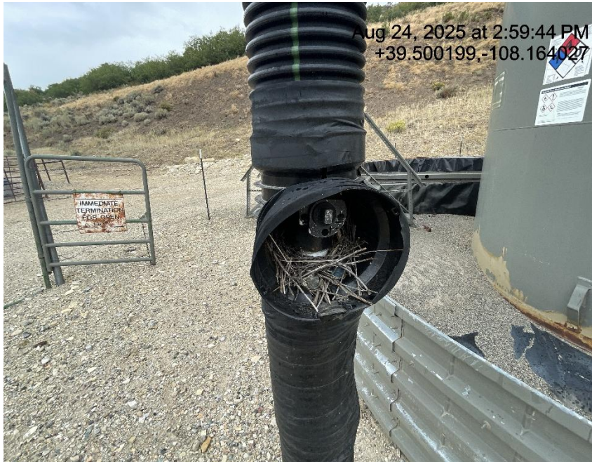
Photo # 3382 Flowline heating insulation open ended/ wildlife hazard – additionally there appears to be a possible nest inside