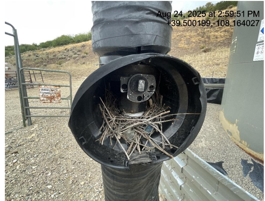
Photo # 3383 Flowline heating insulation open ended/ wildlife hazard – additionally there appears to be a possible nest inside