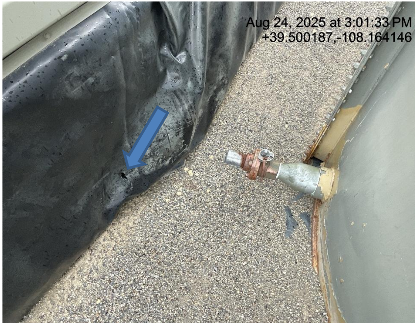
Photo # 3384 Hole in secondary containment liner/liner needs maintenance