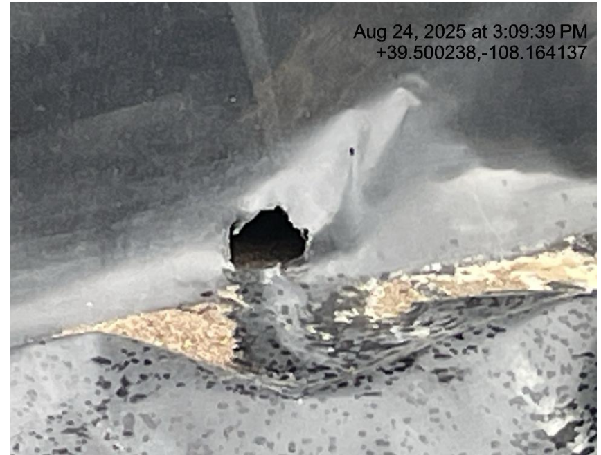
Photo # 3387 Hole in secondary containment liner/liner needs maintenance