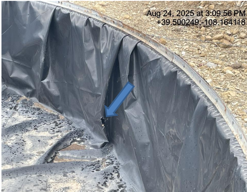
Photo # 3388 Hole in secondary containment liner/liner needs maintenance