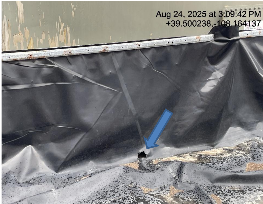
Photo # 3386 Hole in secondary containment liner/liner needs maintenance