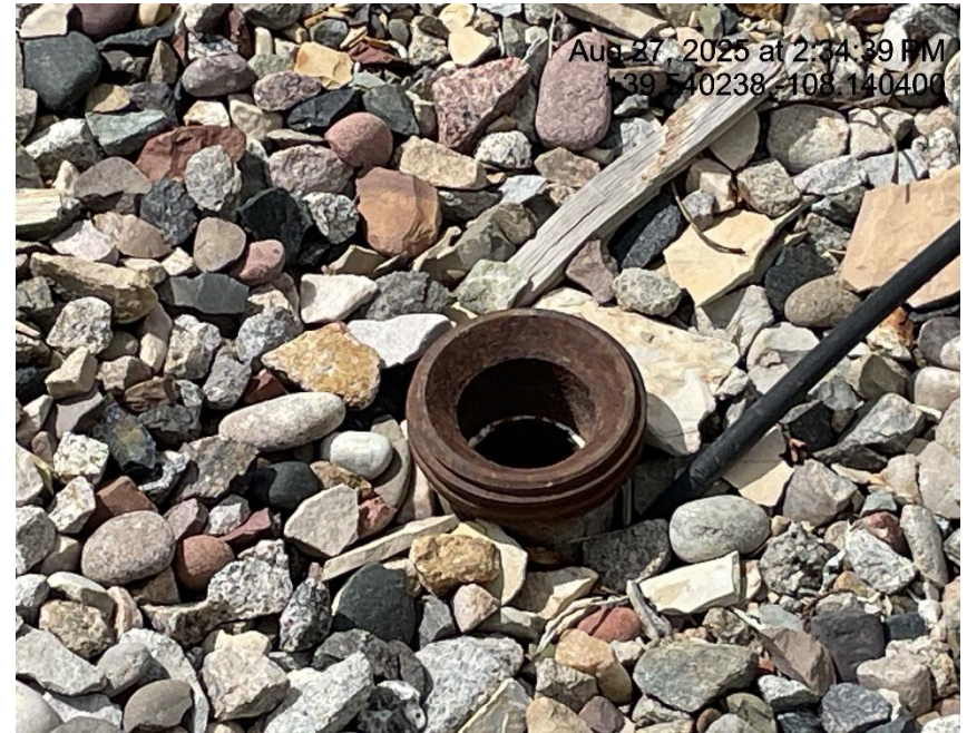
Photo # 4628 Open ended flowline/wildlife hazard & additionally unused flowline lacks lockout tagout (OOSLAT)