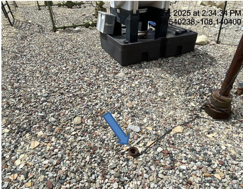
Photo # 4627 Open ended flowline/wildlife hazard & additionally unused flowline lacks lockout tagout (OOSLAT)