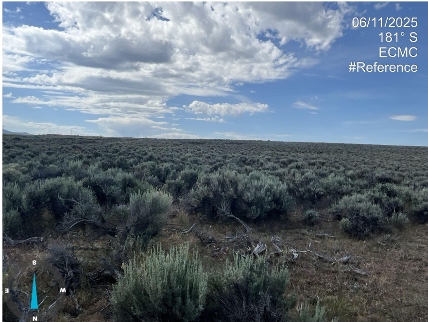
Photo 5. Photos 5-6 taken of the reference area vegetation, illustrating vegetation is primarily sagebrush.