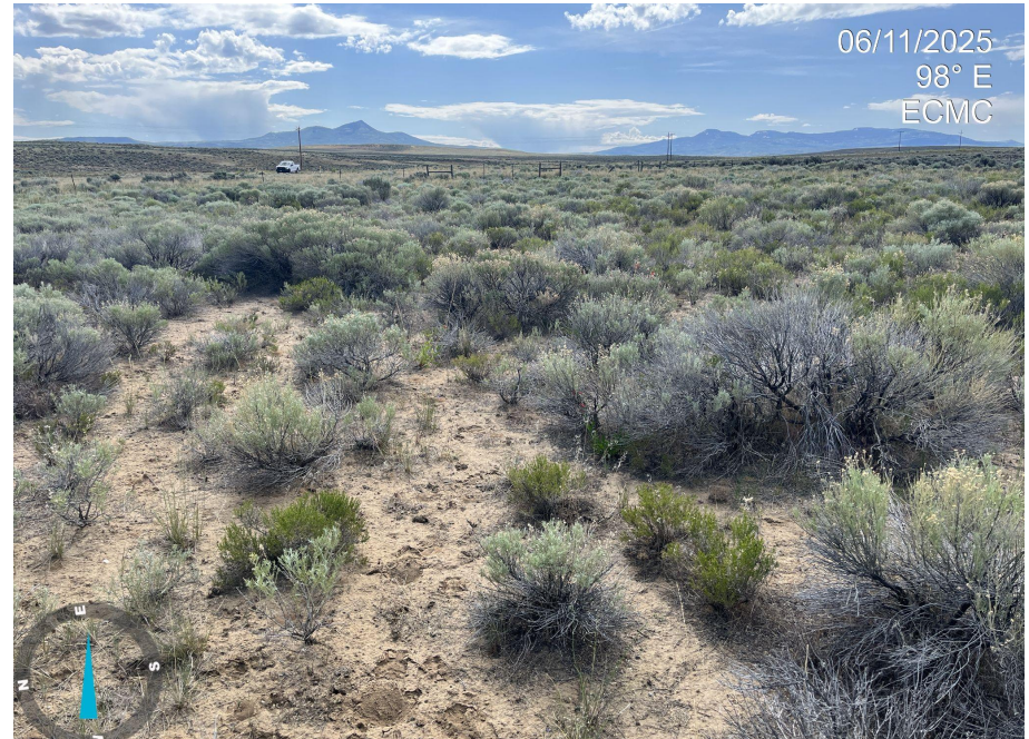
Photo 2. See comments under Photo 1.