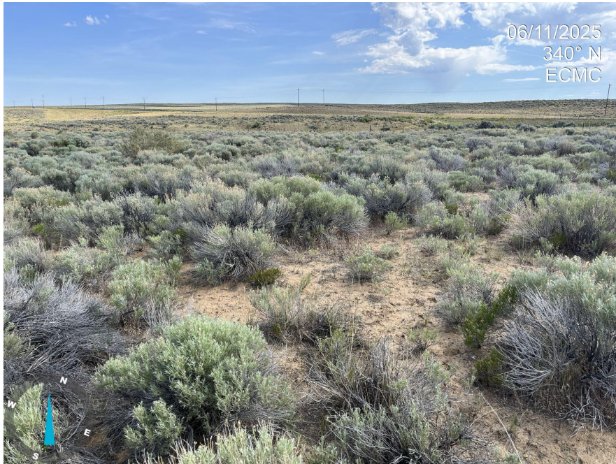
Photo 1. Photos 1-4 taken at the center of the previous Location disturbance, facing north, east, south, and southwest. Photos illustrates vegetation is primarily sagebrush, rabbitbrush, snakeweed .