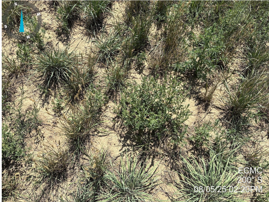
Photo 5. Photo taken of ground cover at the well location. Photo illustrates kochia ( Bassia scoparia ), perennial grass, and patches of bare ground.