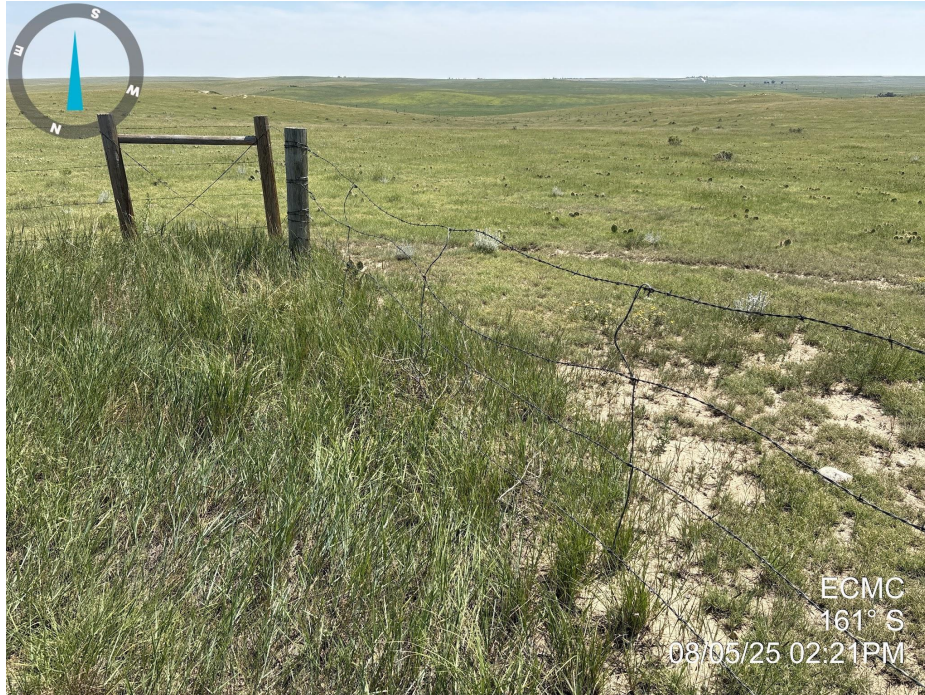
Photo 7. Photo taken of the entrance to the location, facing south. Photo illustrates that fencing remains surrounding the location.