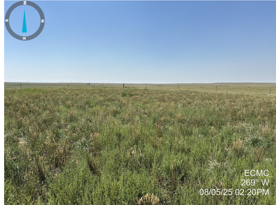
Photo 4. Photo taken of the well location, facing West. See comments under Photo 1.