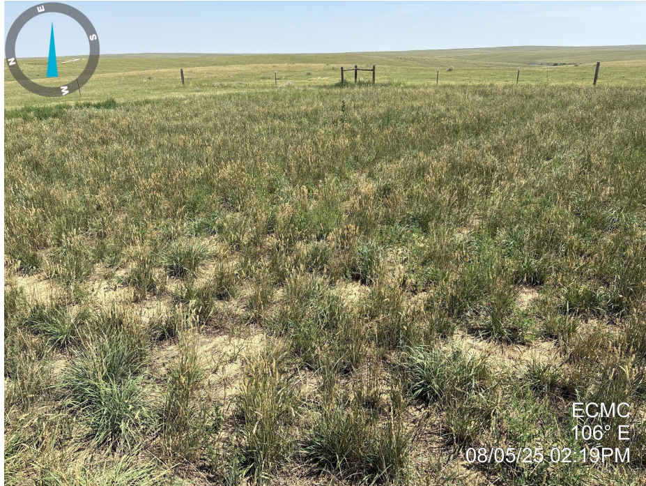
Photo 9. Photo taken of the tank battery location, facing east. See comments under Photo 8.