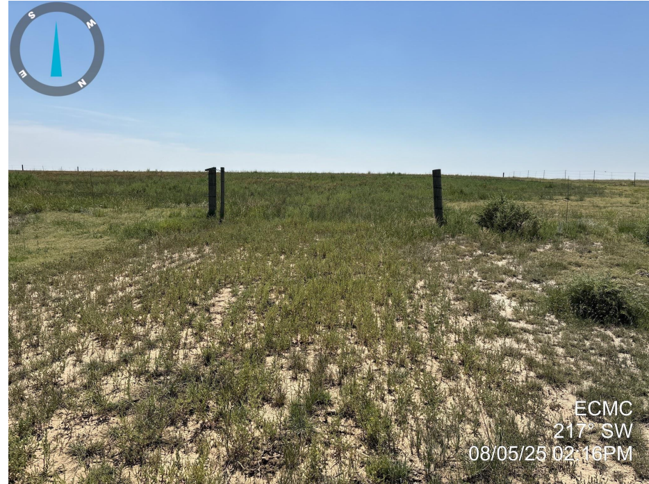
Photo 6. Photo taken of the access road to the well location, facing southwest, towards the location. Photo illustrates that final reclamation activities have taken place, with evidence of drill row seeding, but vegetation does not meet Rule 1004 standards.