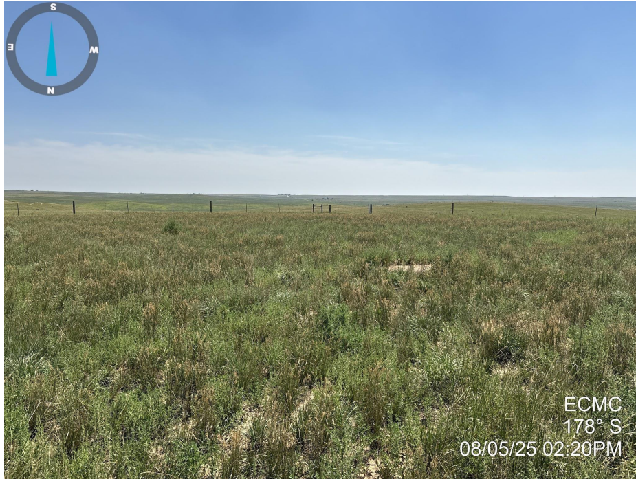
Photo 3. Photo taken of the well location, facing South. See comments under Photo 1.