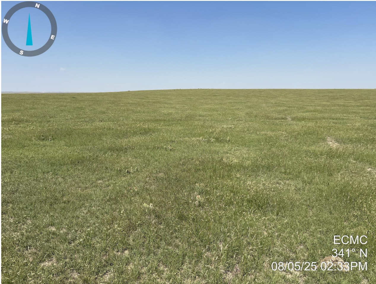
Photo 11. Photo taken of the reference area to the location, north of the location, facing north. Photo illustrates perennial grass vegetation.