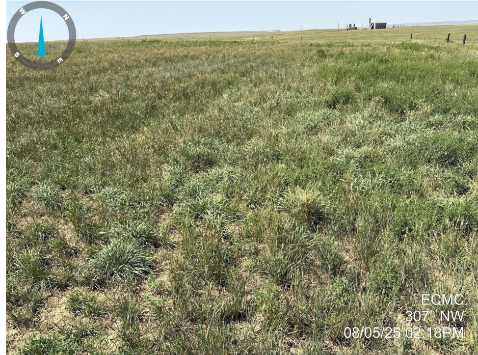
Photo 10. Photo taken of the tank battery location, facing northwest. See comments under Photo 8.