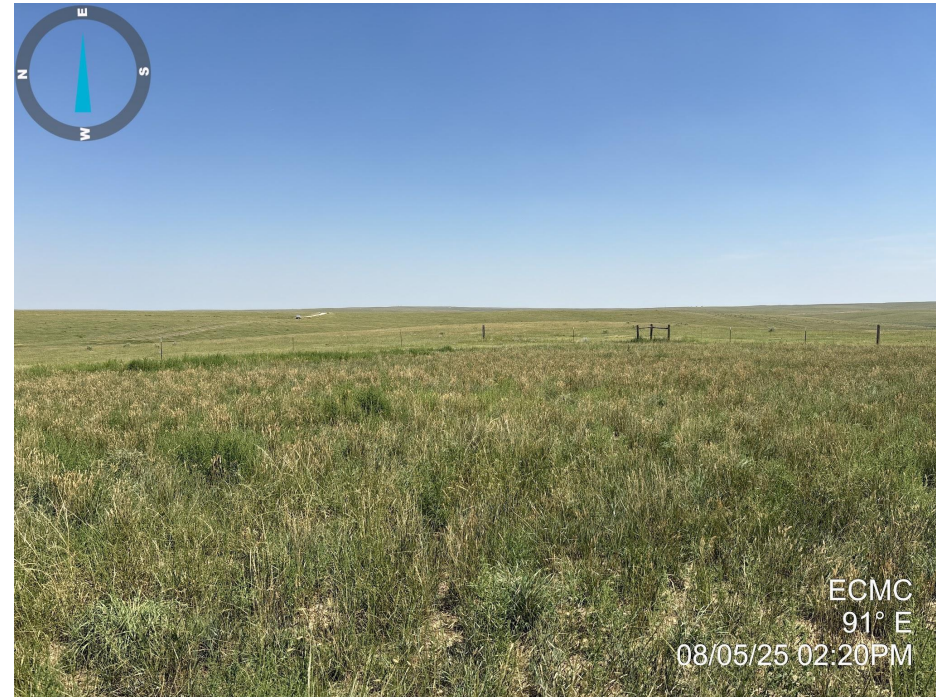
Photo 2. Photo taken of the well location, facing East. See comments under Photo 1.