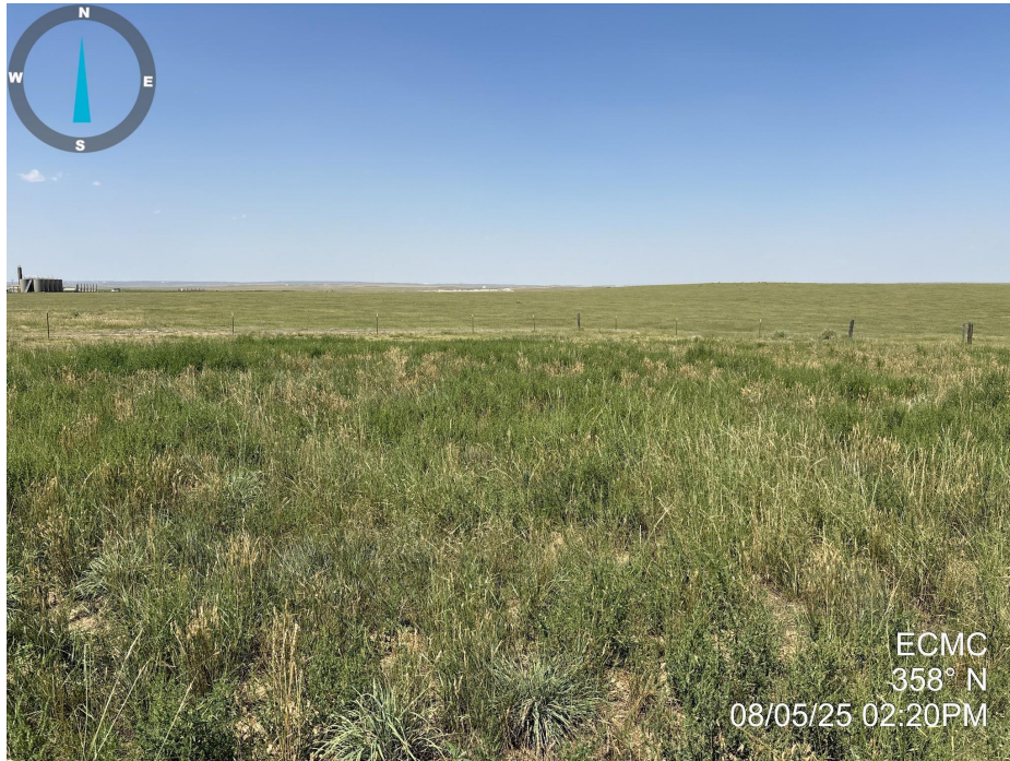
Photo 1. Photo taken of the well location, facing north. Photo illustrates that final reclamation activities have taken place, but the location does not meet Rule 1004 standards and weedy annual vegetation, including kochia ( Bassia scoparia ), was observed across the location.