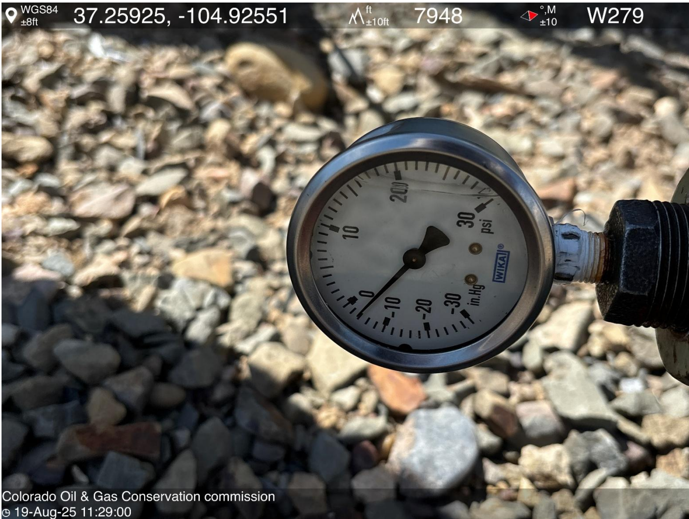
PHOTO 9: BRHD -2 EQUILIZED IN APP. 2 SECONDS NO FLUID FLOW NO SAMPLE TAKEN.