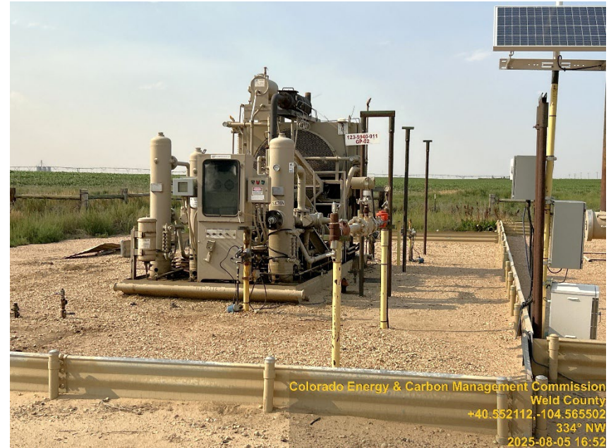
Photo #6 Dillard/20Y-HZ Pad Battery site Inactive | Shut-down Compressor(s)