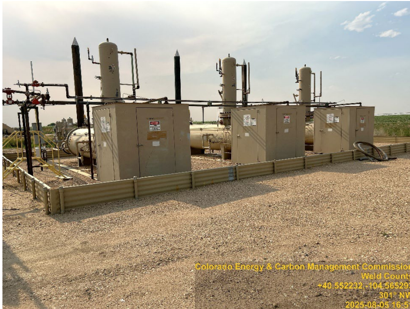
Photo #5 Dillard/20Y-HZ Pad Battery site Inactive | Shut-down Separator(s)