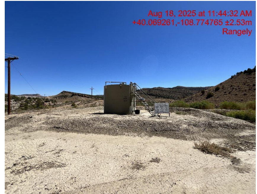
Photo # 2051 Wellhead sign lacks quarter/quarter section information. Additionally operator label is peeling but still legible.