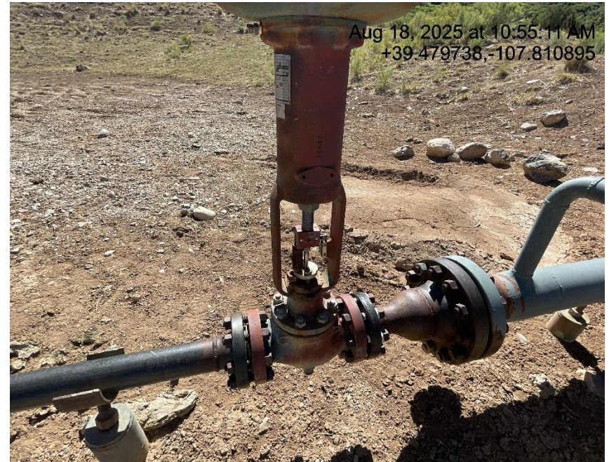
Photo # 1069 Pneumatic control valve on Summit Midstream pipeline has been modified/valve no longer has the ability to close