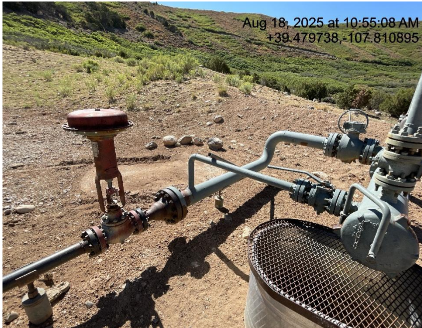
Photo # 1068 Pneumatic control valve on Summit Midstream pipeline has been modified/valve no longer has the ability to close