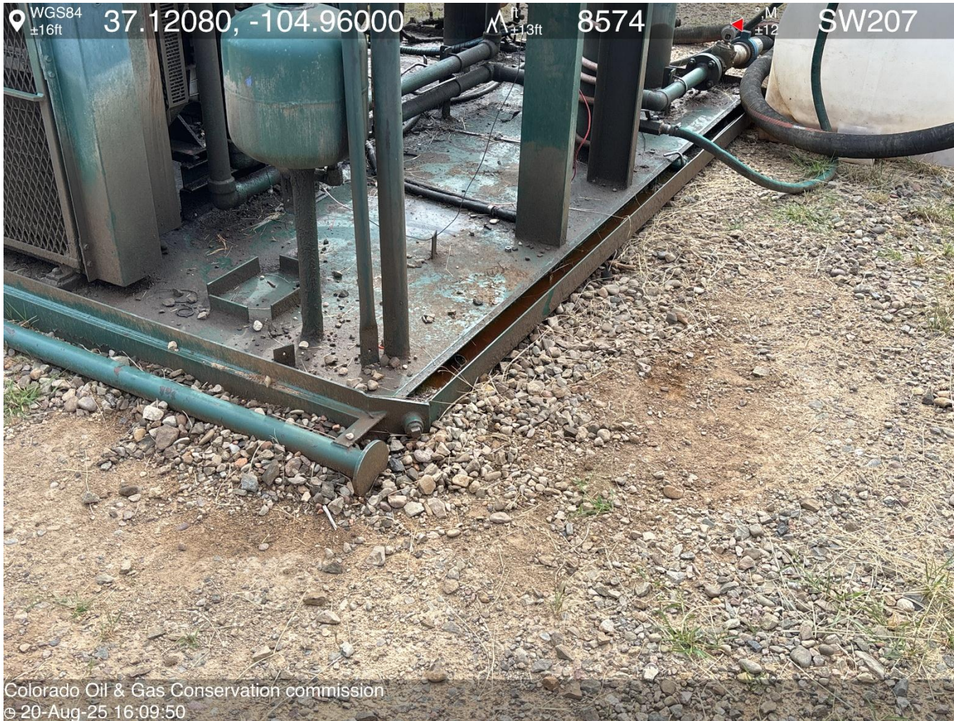
PHOTO 4: AREA OF IMPACTED SOIL NEAR COMPRESSOR. Conduct maintenance on equipment, cleanup stained material and review self inspection processes. COMPLY WITH RULE 1002,.(2).D. THIS IS THE NOTICE FOR THIS CA IMMEDIATE ACTION IS REQUIRED.