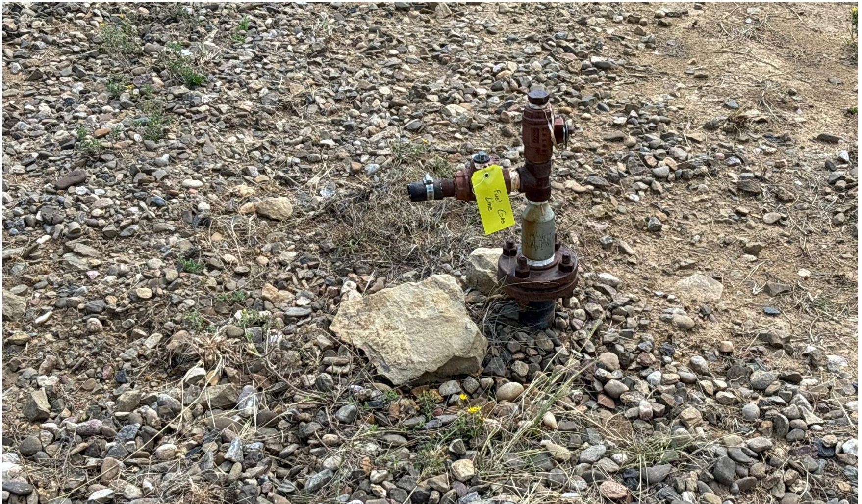
PHOTO 4: CORRECTIVE ACTION NOTED IN PREVIOUS INSPECTION HAS BEEN ADDRESSED HOWEVER THIS MARKER IS INADEQUATE THE MARKER NEEDS TO BE MORE PERMINATE.