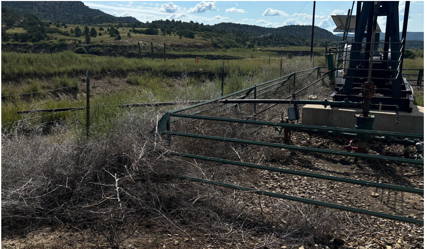
PHOTO 3: WEEDS ACCUMULATING BETWEEN PUMPJACK FENCE AND PIT FENCE. REMOVE DEAD WEEDS PER RULE 606. CA DATE 8-26-2025.