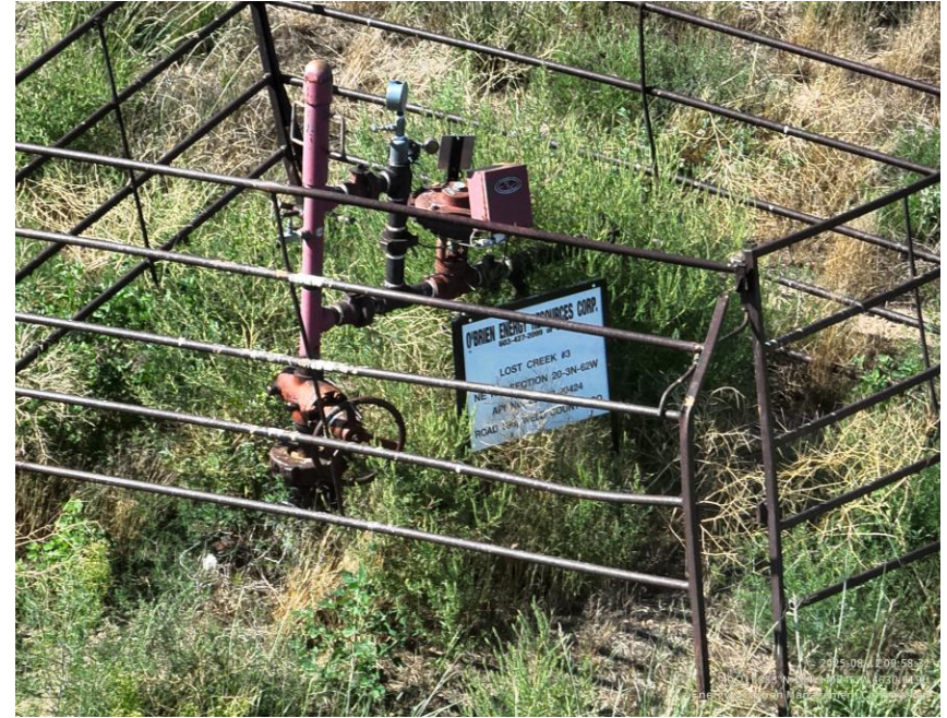
Well/ Overgrown Vegetation