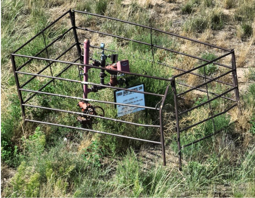
Well/ Overgrown Vegetation