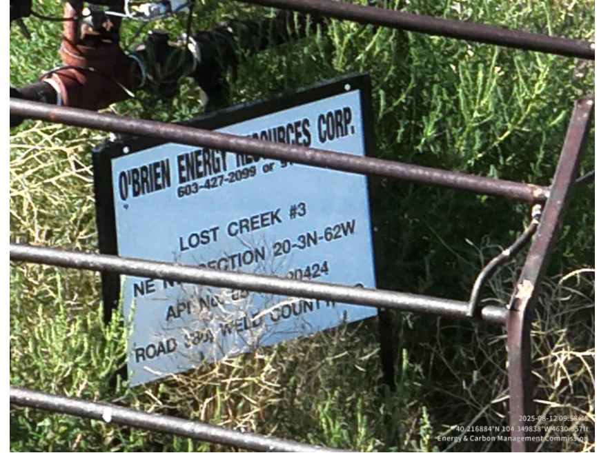
Well Sign doesn't reflect well name on file